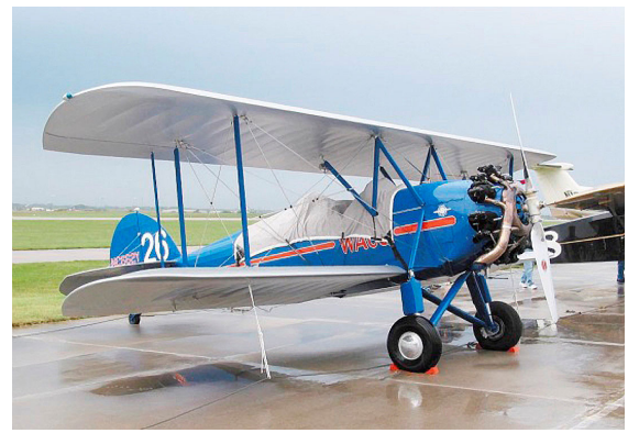
Waco ASO Canopy Cover