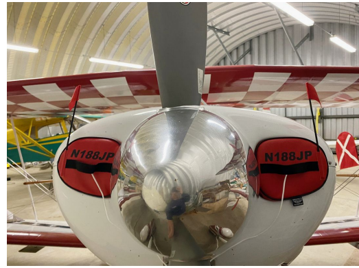
Pitts S-2A Engine Plugs