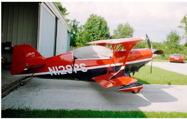
Pitts S2 Canopy Cover