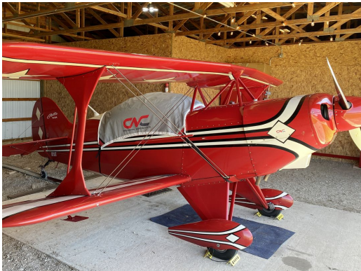
Pitts S2 Travel Canopy Cover