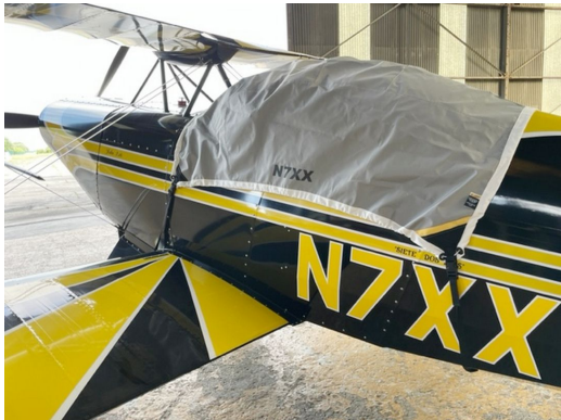
Pitts S2 Light Weight Travel Canopy Cover

Travel Covers are made with Silver Solution-Dyed Polyester fabric and only lined over the windshield to save weight. The material is lightweight and more compact for easy stowage in the aircraft. The polyester material is water resistant, but only intended for occasional use outside. We also have an ultra lightweight material available for fitted hangar dust covers. For daily outdoor use, the non-travel Sunbrella Cover is the best choice.