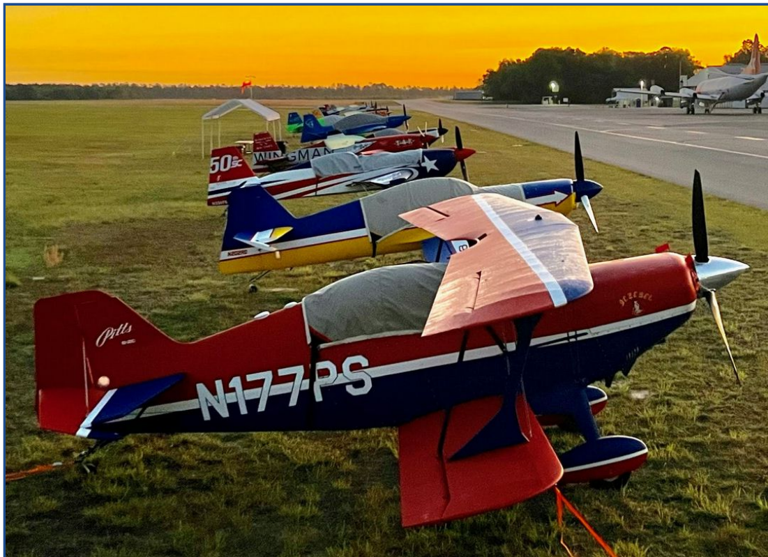
Pitts S2 Canopy Cover