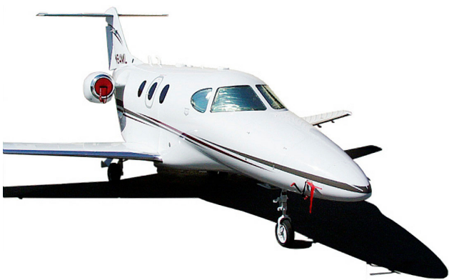
Raytheon Premier Intake Plugs, Pitot Covers & Cockpit HeatShields