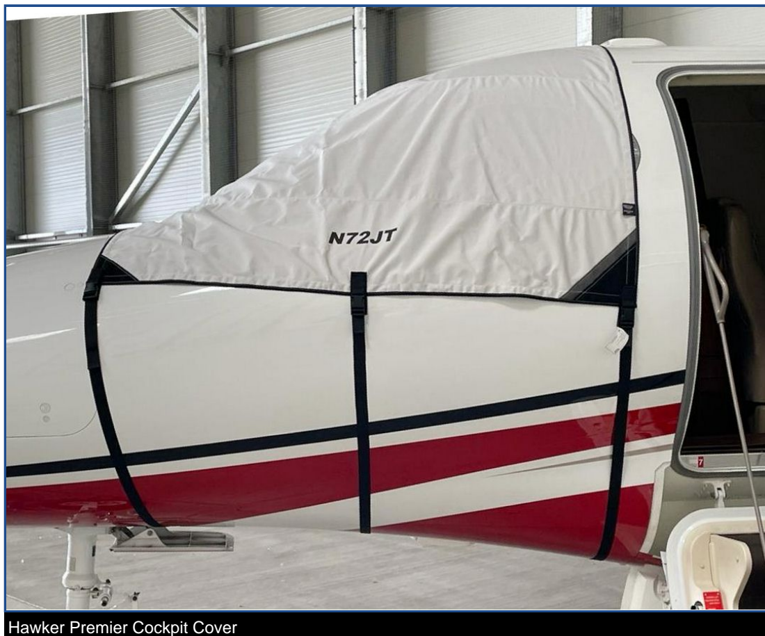
Hawker Premier Cockpit Cover