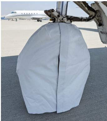
CJ1 Nose Gear Tire Cover, test fit