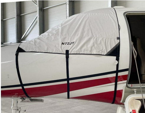
Hawker Premier Cockpit Cover

This cover type is made from Silver Acrylic Sunbrella canvas and is 100% lined with a soft and smooth microfiber. Bruce's Custom Covers developed this material combination especially for aircraft protection. The outer material is medium weight and treated for water resistance, UV resistance and anti-static buildup. The inner lining is a very soft and smooth microfiber to prevent scratching. The material is very reflective, and tests show that the cabin interior temperature can be reduced to near-ambient temperature on the hottest of days. It is water, ice and snow repellent, yet breathable to allow moisture to escape from between the cover and the aircraft surface.