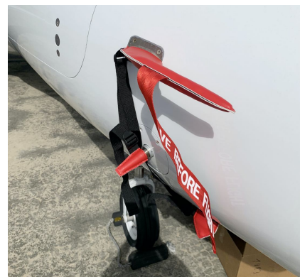
Beech Premier Pitot, AOA, Rosemont Cover Set