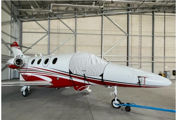
Hawker Premier Cockpit Cover