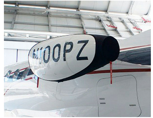
Phenom 100 "Bikini" Engine Covers