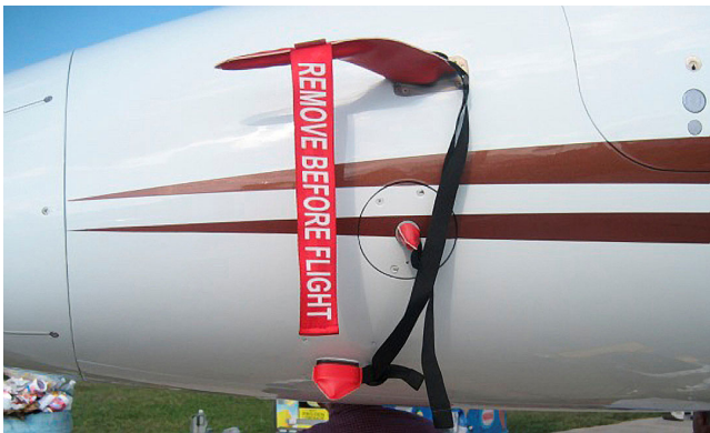
Premier Heat Resistant Pitot Covers set