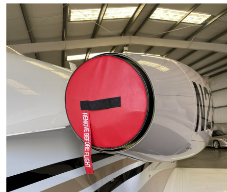
Hawker Beechcraft Premier 390 Intake Plug/Exhaust Plug Set