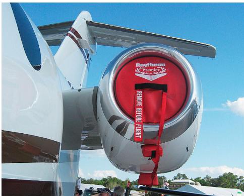
Premier Intake/Exhaust Plug set with Generator Inlet/Exhaust Plugs

The Hawker Beechcraft Premier 390 Intake/Exhaust Plugs are custom fit for the intake and exhaust openings, made with heavy-duty vinyl material, and stuffed with a single block of sculpted urethane foam. Each plug has a zipper that allows the foam to be removed and dried if necessary. Engine plugs have 'remove before flight' streamers sewn onto the face of the plugs. Most plugs are imprinted with the aircraft registration number in black. Engine plugs may be inserted after flight when the engine is still warm. Engine Inlet Plugs are commonly referred to as Cowl Plugs, Intake Plugs, Cowl Blocks, Engine Blocks, and Engine Bungs.