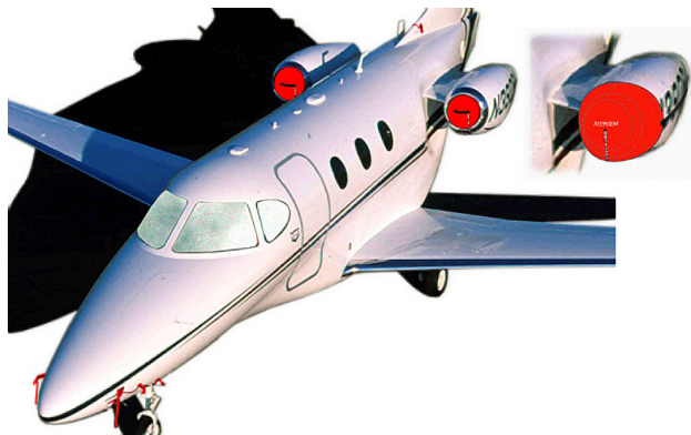
Premier Intake Plugs, Intake Covers, Pitot Covers & Cockpit HeatShields