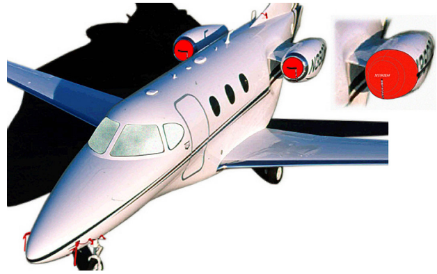
Hawker Beechcraft Premier Engine Covers, 3-Strap Style Premier Intake Plugs, Intake Covers, Pitot Covers & Cockpit HeatShields