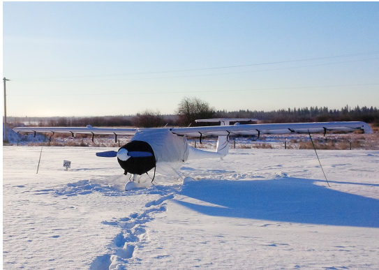
Pipistrel Canopy, Wings, Tail & Insulated Engine Covers