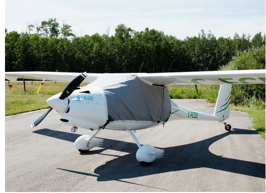
Pipistrel Light Weight Travel Canopy Cover