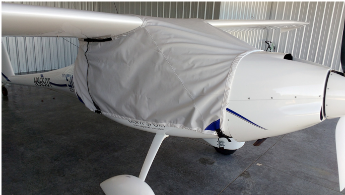
Pipistrel Sinus, Virus & Alpha Trainer Canopy Cover (Over-The-Top Style), Belly Strap Type