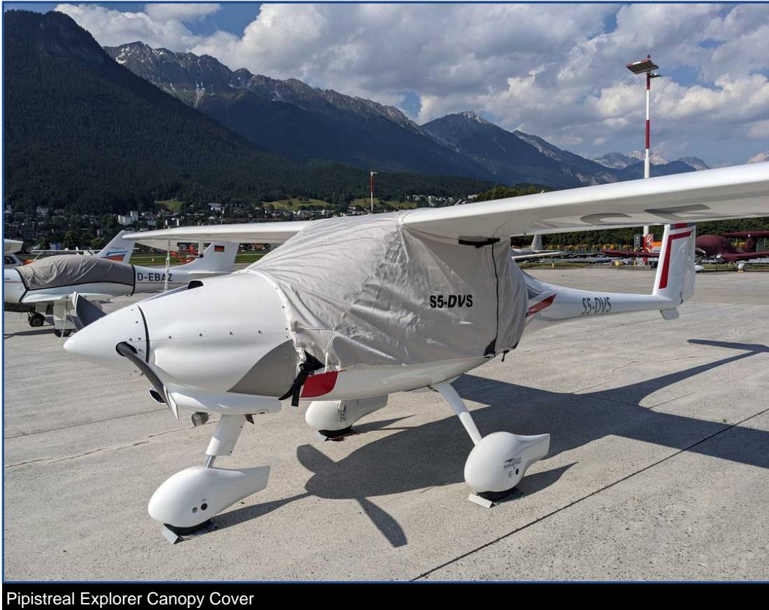
Pipistrel Explorer Canopy Cover