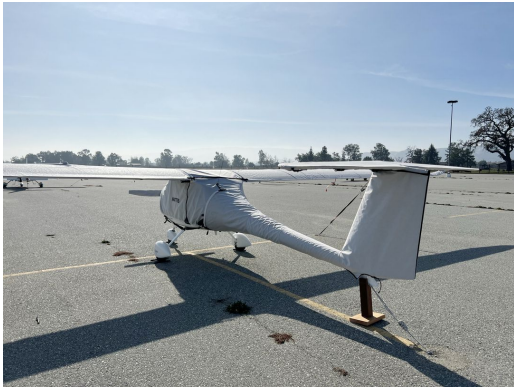
Pipistrel Sinus LSA Full Cover Set

This cover type is made from Silver Acrylic Sunbrella canvas and is 100% lined with a soft and smooth microfiber. Bruce's Custom Covers developed this material combination especially for aircraft protection. The outer material is medium weight and treated for water resistance, UV resistance and anti-static buildup. The inner lining is a very soft and smooth microfiber to prevent scratching. The material is very reflective, and tests show that the cabin interior temperature can be reduced to near-ambient temperature on the hottest of days. It is water, ice and snow repellent, yet breathable to allow moisture to escape from between the cover and the aircraft surface.