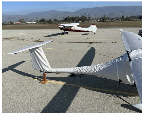
Pipistrel Sinus LSA Full Cover Set