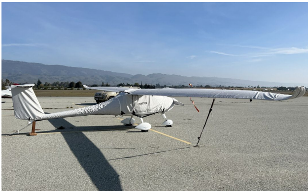
Pipistrel Sinus LSA Full Cover Set

WINTER USE MATERIAL - Made with Solution-Dyed Polyester fabric, this option is intended for seasonal use to aid in deicing, rain mitigation, or for occasional travel. The material is lighter and more compact, but more susceptible to UV damage and may have a shorter useful life if used continuously outside than the all-year use material.