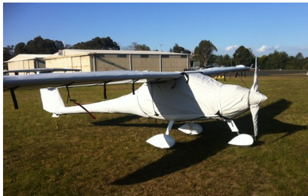
Pipistrel Full Cover Set

This cover type is made from Silver Acrylic Sunbrella canvas and is 100% lined with a soft and smooth microfiber. Bruce's Custom Covers developed this material combination especially for aircraft protection. The outer material is medium weight and treated for water resistance, UV resistance and anti-static buildup. The inner lining is a very soft and smooth microfiber to prevent scratching. The material is very reflective, and tests show that the cabin interior temperature can be reduced to near-ambient temperature on the hottest of days. It is water, ice and snow repellent, yet breathable to allow moisture to escape from between the cover and the aircraft surface.