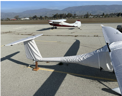
Pipistrel Sinus LSA Full Cover Set