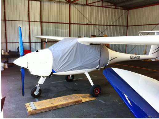
Pipistrel Light Weight Travel Canopy Cover

Travel Covers are made with Silver Solution-Dyed Polyester fabric and only lined over the windshield to save weight. The material is lightweight and more compact for easy stowage in the aircraft. The polyester material is water resistant, but only intended for occasional use outside. We also have an ultra lightweight material available for fitted hangar dust covers. For daily outdoor use, the non-travel Sunbrella Cover is the best choice.