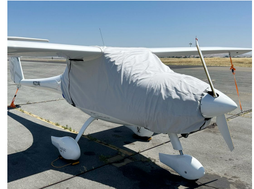
Pipistrel Virus SW Canopy/Engine Cover