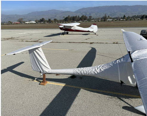
Pipistrel Sinus LSA Full Cover Set