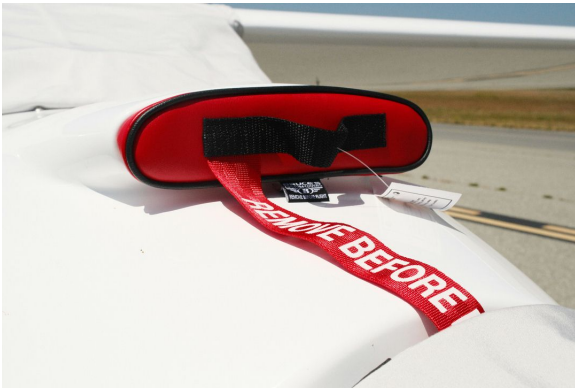
Pipistrel Virus Engine Plugs