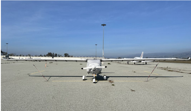
Pipistrel Sinus LSA Full Cover Set

This cover type is made from Silver Acrylic Sunbrella canvas and is 100% lined with a soft and smooth microfiber. Bruce's Custom Covers developed this material combination especially for aircraft protection. The outer material is medium weight and treated for water resistance, UV resistance and anti-static buildup. The inner lining is a very soft and smooth microfiber to prevent scratching. The material is very reflective, and tests show that the cabin interior temperature can be reduced to near-ambient temperature on the hottest of days. It is water, ice and snow repellent, yet breathable to allow moisture to escape from between the cover and the aircraft surface.