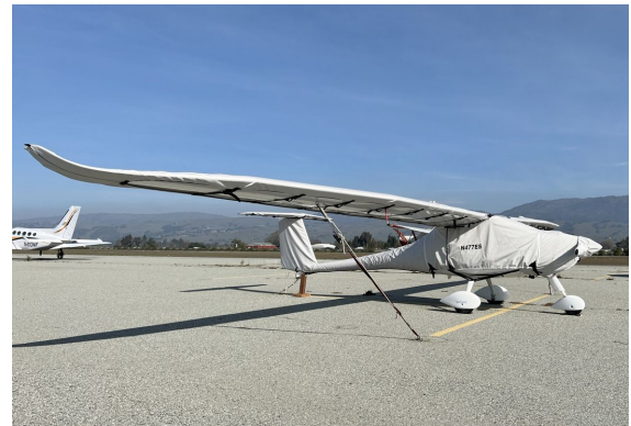
Pipistrel Sinus LSA Full Cover Set