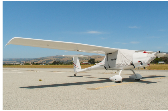
Pipistrel Virus Canopy Cover, Engine Plugs, Prop Cover