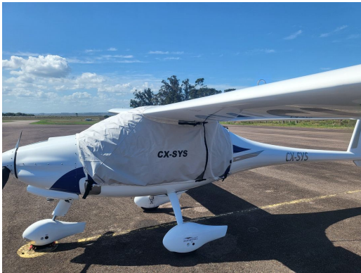
Pipistrel Explorer Over The Top Style Canopy Cover

This cover type is made from Silver Acrylic Sunbrella canvas and is 100% lined with a soft and smooth microfiber. Bruce's Custom Covers developed this material combination especially for aircraft protection. The outer material is medium weight and treated for water resistance, UV resistance and anti-static buildup. The inner lining is a very soft and smooth microfiber to prevent scratching. The material is very reflective, and tests show that the cabin interior temperature can be reduced to near-ambient temperature on the hottest of days. It is water, ice and snow repellent, yet breathable to allow moisture to escape from between the cover and the aircraft surface.