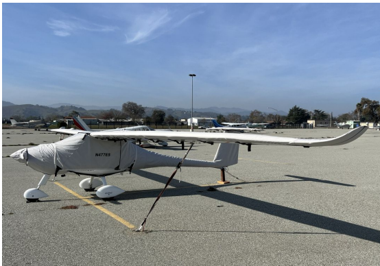
Pipistrel Sinus LSA Full Cover Set

WINTER USE MATERIAL - Made with Solution-Dyed Polyester fabric, this option is intended for seasonal use to aid in deicing, rain mitigation, or for occasional travel. The material is lighter and more compact, but more susceptible to UV damage and may have a shorter useful life if used continuously outside than the all-year use material.