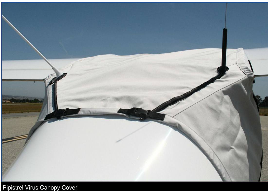
Pipistrel Virus Canopy Cover