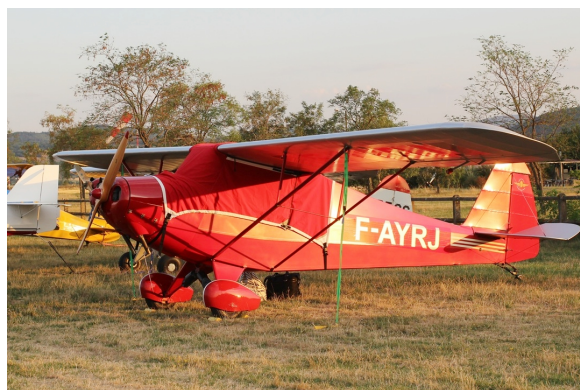
Porterfield Collegiate Canopy Cover