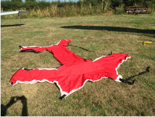
Porterfield Collegiate Canopy Cover

water resistance, UV resistance and anti-static buildup. The inner lining is a very soft and smooth microfiber to prevent scratching. The material is very reflective, and tests show that the cabin interior temperature can be reduced to near-ambient temperature on the hottest of days. It is water, ice and snow repellent, yet breathable to allow moisture to escape from between the cover and the aircraft surface.