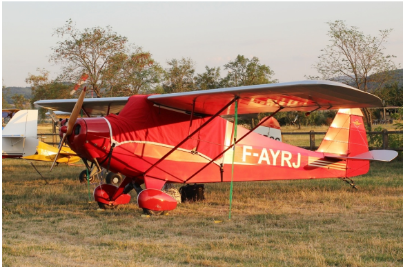
Porterfield Collegiate Canopy Cover

water resistance, UV resistance and anti-static buildup. The inner lining is a very soft and smooth microfiber to prevent scratching. The material is very reflective, and tests show that the cabin interior temperature can be reduced to near-ambient temperature on the hottest of days. It is water, ice and snow repellent, yet breathable to allow moisture to escape from between the cover and the aircraft surface.