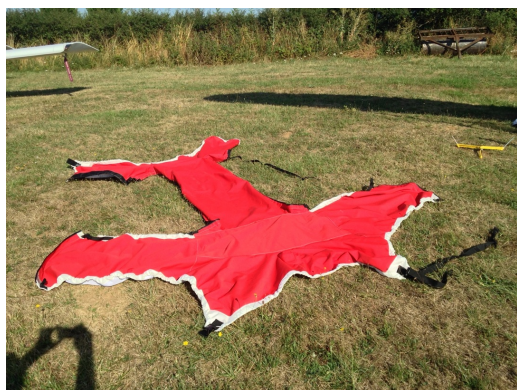
Porterfield Collegiate Canopy Cover