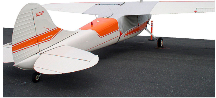
Cessna 195 Over-Top Canopy, Engine & Prop Covers