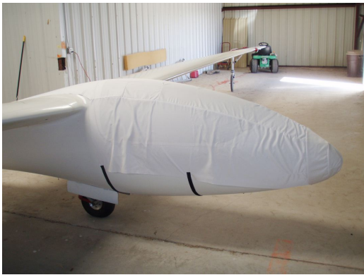
Bolkow Phoebus C-1 Canopy/Nose Cover, test fit cover

the hottest of days. It is water, ice and snow repellent, yet breathable to allow moisture to escape from between the cover and the aircraft surface.