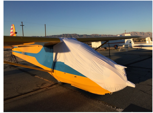
Sailplane Full Cover Set Graphic Indicators (Discus 2B, 3D model) Schweizer SGU 2-22EK Canopy/Nose Cover, test fit cover