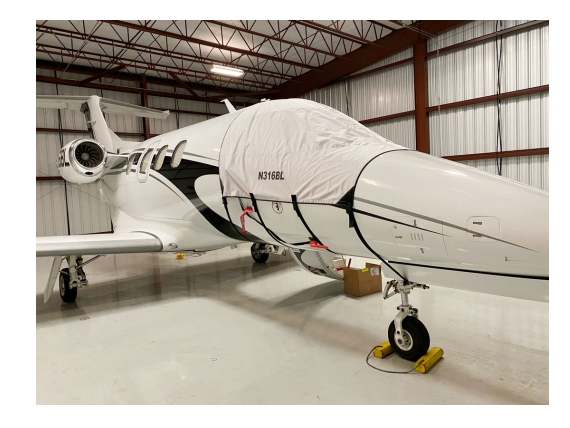
Embraer Phenom 100 Cockpit Cover

This cover type is made from Silver Acrylic Sunbrella canvas and is 100% lined with a soft and smooth microfiber. Bruce's Custom Covers developed this material combination especially for aircraft protection. The outer material is medium weight and treated for water resistance, UV resistance and anti-static buildup. The inner lining is a very soft and smooth microfiber to prevent scratching. The material is very reflective, and tests show that the cabin interior temperature can be reduced to near-ambient temperature on the hottest of days. It is water, ice and snow repellent, yet breathable to allow moisture to escape from between the cover and the aircraft surface.