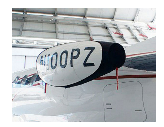
Phenom 100 "Bikini" Engine Covers