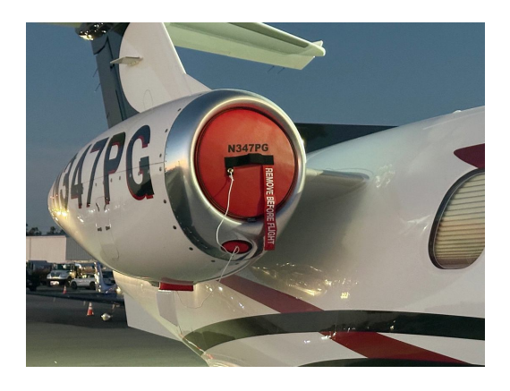
Embraer Phenom 100 Intake & Exhaust Plugs