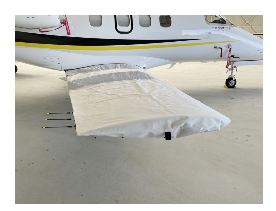
Embraer Phenom 100 Canopy/Nose Cover

WINTER USE MATERIAL - Made with Solution-Dyed Polyester fabric, this option is intended for seasonal use to aid in deicing, rain mitigation, or for occasional travel. The material is lighter and more compact, but more susceptible to UV damage and may have a shorter useful life if used continuously outside than the all-year use material.