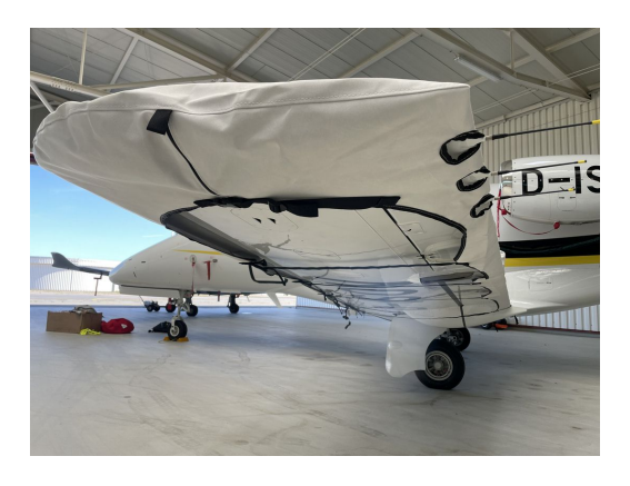
Embraer Phenom 100 Canopy/Nose Cover