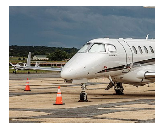
Embraer Phenom 100 Cockpit HeatShields

out because some aircraft manufacturers have issued advisories against reflective window inserts due to potential heat damage. A Heatshield is an excellent short-term remedy for cockpit overheating, but an external fabric cover is more effective for long-term protection.