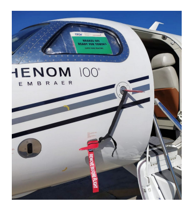
Phenom 100 (EMB 500) Pitot Cover/AOA Set

The Engine Inlet Plugs are custom fit for your Embraer Phenom 100 (EMB-500) intakes, made with heavy-duty vinyl material, and stuffed with a single block of sculpted urethane foam. Each plug has a zipper that allows the foam to be removed and dried if necessary. Engine plugs have 'remove before flight' streamers sewn onto the face of the plugs. Most plugs are imprinted with the aircraft registration number in black for an extra charge. Storage bag NOT included. Engine plugs may be inserted after flight when the engine is still warm. Engine Inlet Plugs are commonly referred to as Cowl Plugs, Intake Plugs, Cowl Blocks, Engine Blocks, and Engine Bungs.