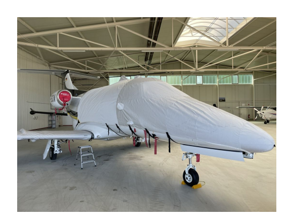
Embraer Phenom 100 Canopy/Nose Cover