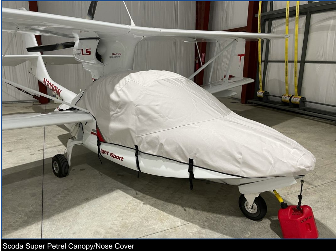
Scoda Super Petrel Canopy/Nose Cover