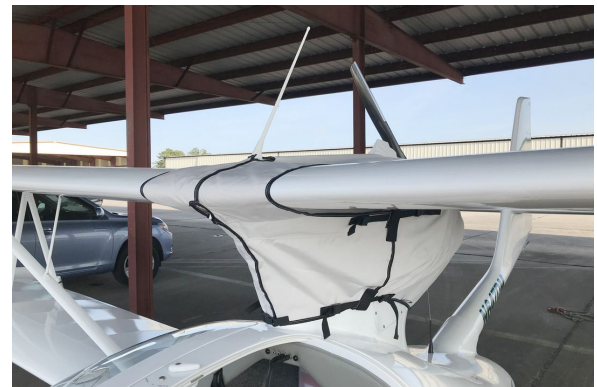
Scoda Aeronautica Super Petrel Engine Cover