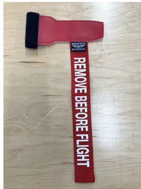
Pitot Tube Cover

Scoda Aeronautica Super Petrel Amphibian Pitot Tube Covers , NOT HEAT RESISTANT TYPE, are made of Naugahyde vinyl, and are designed to cover the entire pitot assembly. Slipping over the tube, the cover tightens around the base with a Velcro strap detail. A "Remove Before Flight" streamer is attached to the cover. Heat Resistant Pitot Covers are an upgrade to this design, and help prevent the pitot cover from melting onto the tube if the pitot heat is accidentally turned on while installed. If you want the set tethered together, please let us know.