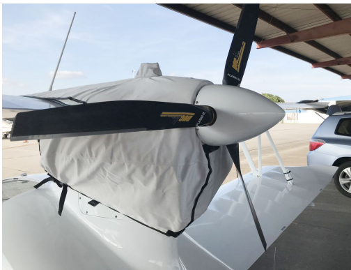
Scoda Aeronautica Super Petrel Engine Cover

Insulated Covers Material - A special composite material of solution-dyed polyester, 3M Thinsulate insulation, and soft nylon interior fabric. Our insulated covers are designed to complement an engine preheater and help retain heat in the engine compartment after shutdown. If you operate your aircraft in cold-weather, these covers will help prevent engine wear and tear.