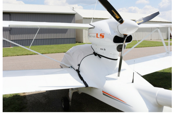
Scoda Aeronautica Super Petrel Canopy/Nose Cover