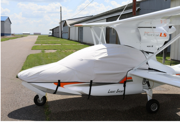
Scoda Aeronautica Super Petrel Canopy/Nose Cover

lightweight and more compact for easy stowage in the aircraft. The polyester material is water resistant, but only intended for occasional use outside. We also have an ultra lightweight material available for fitted hangar dust covers. For daily outdoor use, the non-travel Sunbrella Cover is the best choice.