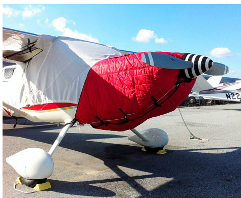
Glastar Insulated Engine Cover