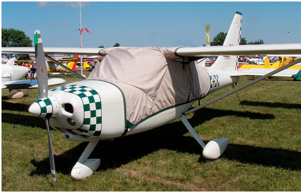
Glastar Over-Top Canopy Cover