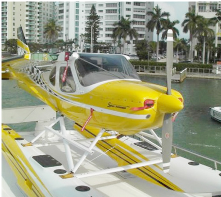
Glastar Engine Plugs

Engine Inlet Plugs are custom fit for your Ultravia Pelican intakes, made with heavy-duty vinyl material, and stuffed with a single block of sculpted urethane foam. Each plug has a zipper that allows the foam to be removed and dried if necessary. Engine plugs have warning flags that are visible from the cockpit or 'remove before flight' streamers sewn onto the face of the plugs. Most plugs are imprinted with the aircraft registration number in black for an extra charge. Storage bag NOT included. Engine plugs may be inserted after flight when the engine is still warm. Engine Inlet Plugs are commonly referred to as Cowl Plugs, Intake Plugs, Cowl Blocks, Engine Blocks, and Engine Bung.