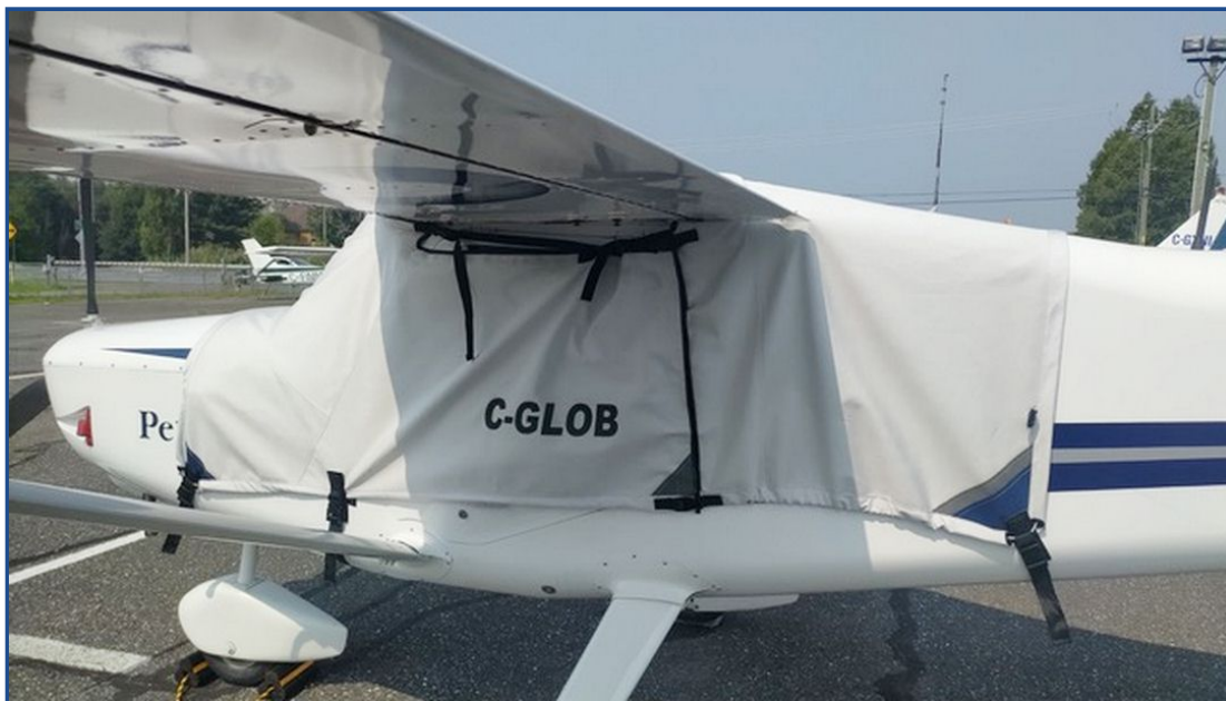
Ultravia Pelican Canopy Cover Over-Top type