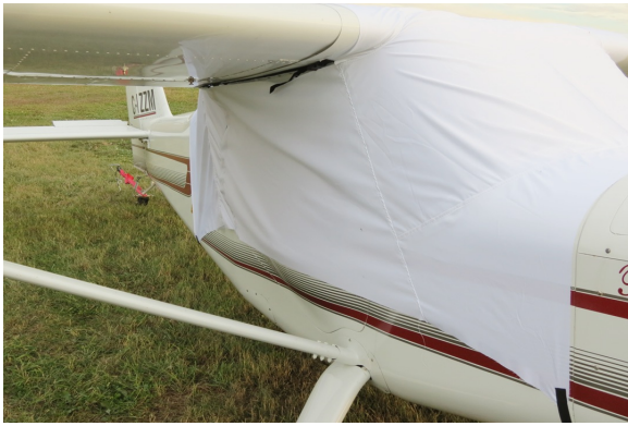
Pelican Canopy Cover (test fit cover)