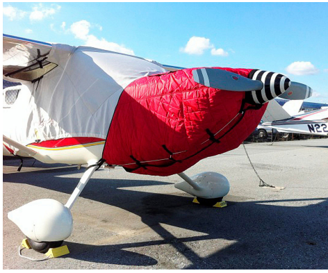
Glastar Insulated Engine Cover