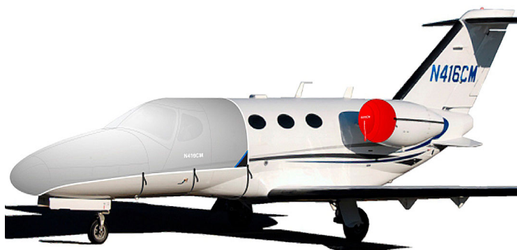
Pilatus PC-24 Cockpit Cover, also cover ice detector (3d model) Citation Mustang Cockpit/Door/Nose Cover, Engine Inlet Cover