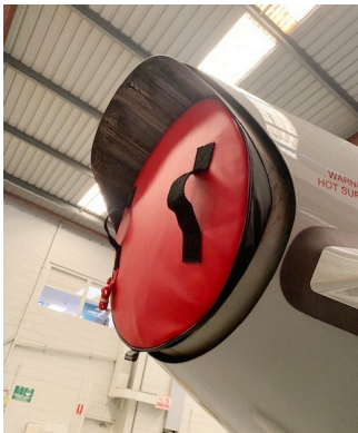
Pilatus PC-24 Engine Exhaust Plug

The Pilatus PC-24 Intake/Exhaust Plugs are custom fit for the intake and exhaust openings, made with heavy-duty vinyl material, and stuffed with a single block of sculpted urethane foam. Each plug has a zipper that allows the foam to be removed and dried if necessary. Engine plugs have 'remove before flight' streamers sewn onto the face of the plugs. Most plugs are imprinted with the aircraft registration number in black. Engine plugs may be inserted after flight when the engine is still warm. Engine Inlet Plugs are commonly referred to as Cowl Plugs, Intake Plugs, Cowl Blocks, Engine Blocks, and Engine Bungs.