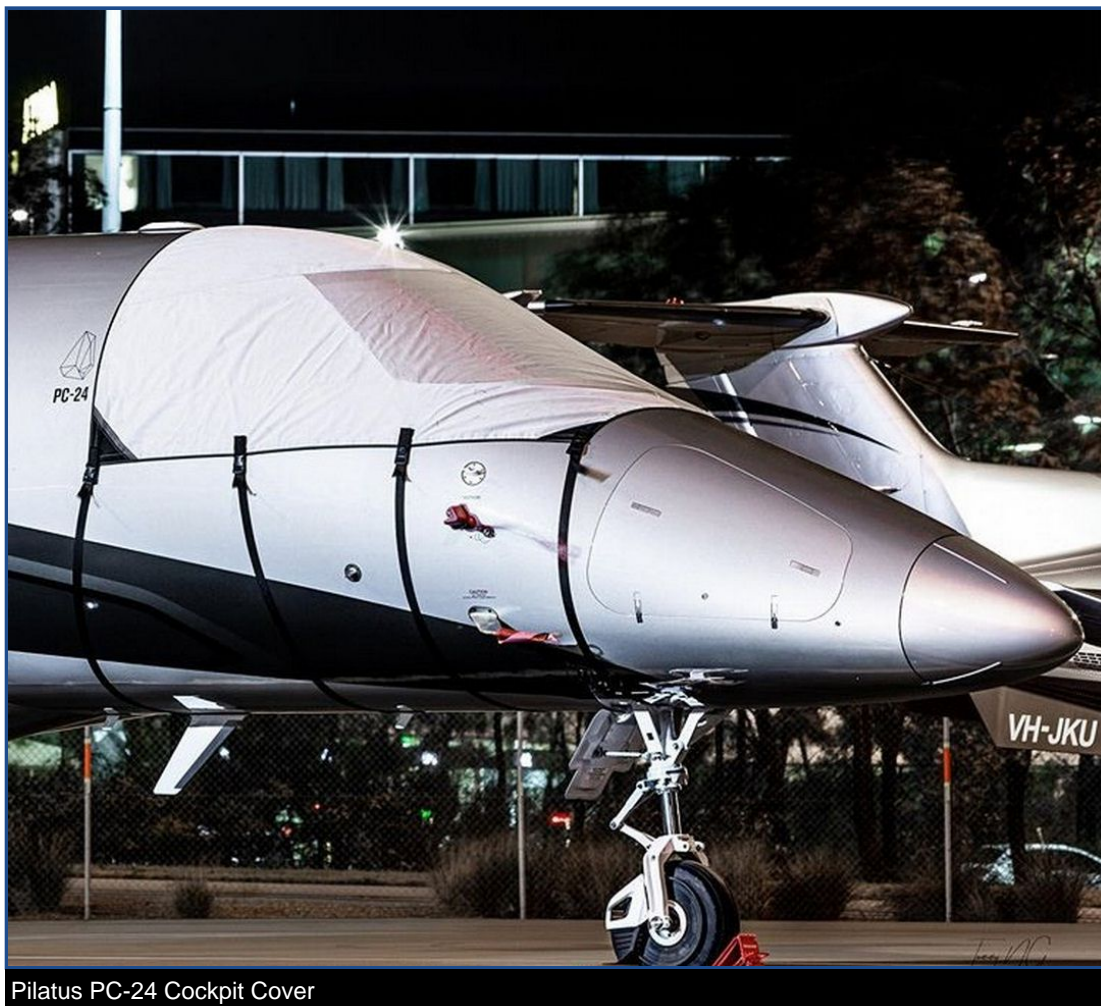
Pilatus PC-24 Cockpit Cover