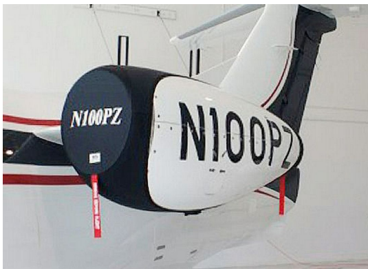
Phenom 100 "Bikini" Engine Covers

The Pilatus PC-24 Intake/Exhaust Plugs are custom fit for the intake and exhaust openings, made with heavy-duty vinyl material, and stuffed with a single block of sculpted urethane foam. Each plug has a zipper that allows the foam to be removed and dried if necessary. Engine plugs have 'remove before flight' streamers sewn onto the face of the plugs. Most plugs are imprinted with the aircraft registration number in black. Engine plugs may be inserted after flight when the engine is still warm. Engine Inlet Plugs are commonly referred to as Cowl Plugs, Intake Plugs, Cowl Blocks, Engine Blocks, and Engine Bungs.