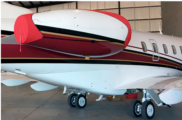
Intake/Exhaust Covers, 3-Strap Type. Successfully installed by two crew, one ladder.