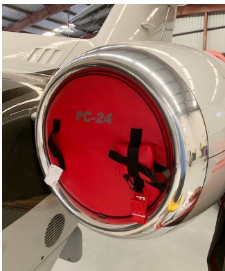
Pilatus PC-24 Engine Intake Plug

The Engine Inlet Plugs are custom fit for your Pilatus PC-24 intakes, made with heavy-duty vinyl material, and stuffed with a single block of sculpted urethane foam. Each plug has a zipper that allows the foam to be removed and dried if necessary. Engine plugs have 'remove before flight' streamers sewn onto the face of the plugs. Most plugs are imprinted with the aircraft registration number in black for an extra charge. Storage bag NOT included. Engine plugs may be inserted after flight when the engine is still warm. Engine Inlet Plugs are commonly referred to as Cowl Plugs, Intake Plugs, Cowl Blocks, Engine Blocks, and Engine Bungs.