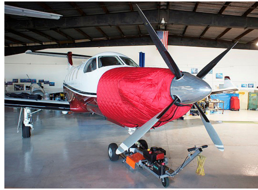
Pilatus PC-12 Insulated Engine Cover