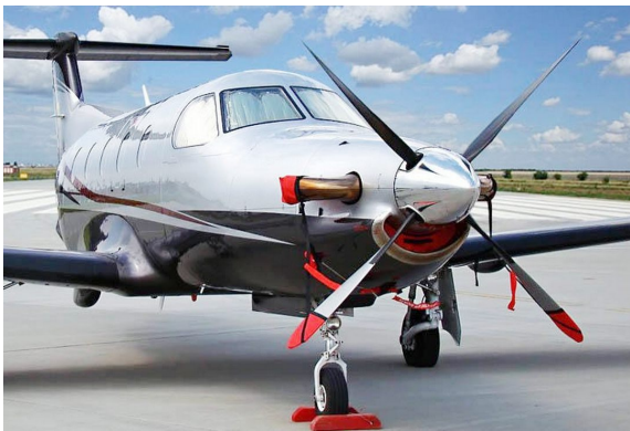
Pilatus PC-12 Engine Plugs, Prop Ties, Cockpit HeatShields