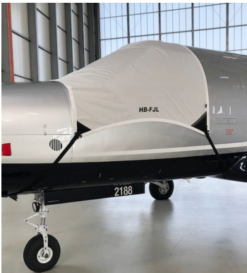
Pilatus PC-12 Cockpit Cover