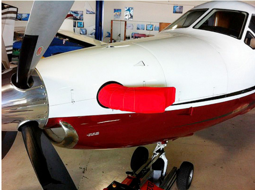
Pilatus PC-12 Exhaust Cover, Fully Enclosed, for protection against corrosion.

This cover type is made from Silver Acrylic Sunbrella canvas and is 100% lined with a soft and smooth microfiber. Bruce's Custom Covers developed this material combination especially for aircraft protection. The outer material is medium weight and treated for water resistance, UV resistance and anti-static buildup. The inner lining is a very soft and smooth microfiber to prevent scratching. The material is very reflective, and tests show that the cabin interior temperature can be reduced to near-ambient temperature on the hottest of days. It is water, ice and snow repellent, yet breathable to allow moisture to escape from between the cover and the aircraft surface.