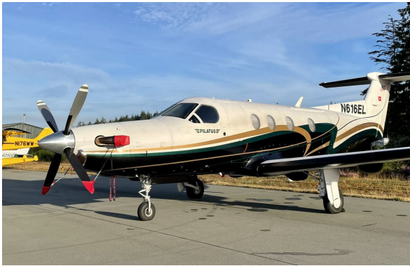
Pilatus PC-12 Prop Tie/Exhaust Covers

This cover type is made from Silver Acrylic Sunbrella canvas and is 100% lined with a soft and smooth microfiber. Bruce's Custom Covers developed this material combination especially for aircraft protection. The outer material is medium weight and treated for water resistance, UV resistance and anti-static buildup. The inner lining is a very soft and smooth microfiber to prevent scratching. The material is very reflective, and tests show that the cabin interior temperature can be reduced to near-ambient temperature on the hottest of days. It is water, ice and snow repellent, yet breathable to allow moisture to escape from between the cover and the aircraft surface.