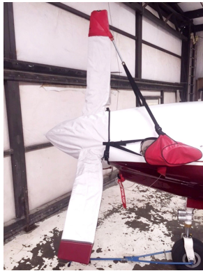
Pilatus PC-12 Prop Cover, Prop Tie/Exhaust Cover

This cover type is made from Silver Acrylic Sunbrella canvas and is 100% lined with a soft and smooth microfiber. Bruce's Custom Covers developed this material combination especially for aircraft protection. The outer material is medium weight and treated for water resistance, UV resistance and anti-static buildup. The inner lining is a very soft and smooth microfiber to prevent scratching. The material is very reflective, and tests show that the cabin interior temperature can be reduced to near-ambient temperature on the hottest of days. It is water, ice and snow repellent, yet breathable to allow moisture to escape from between the cover and the aircraft surface.