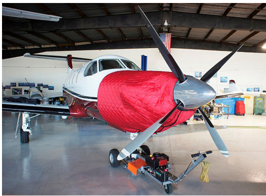
Pilatus PC-12 Insulated Engine Cover