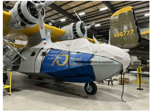
Consolidated Vultee PB5C Cockpit/Nose Cover