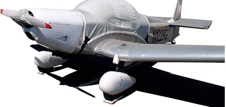
Pazmany PL2 Homebuilt Canopy Cover