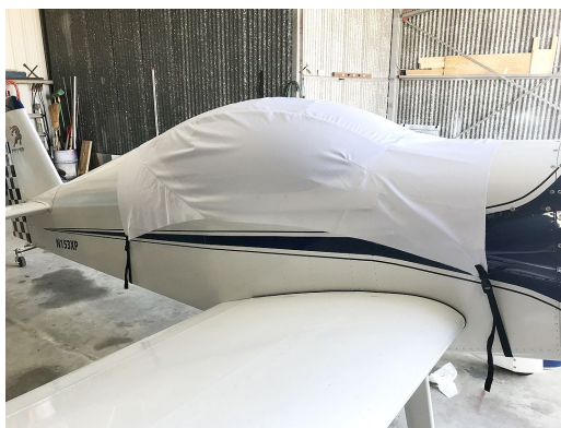
SPA, Sport Performance Aviation, Panther Canopy Cover (test fit cover)