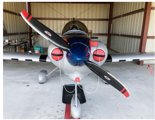
SPA Sport Panther Engine Inlet Plugs