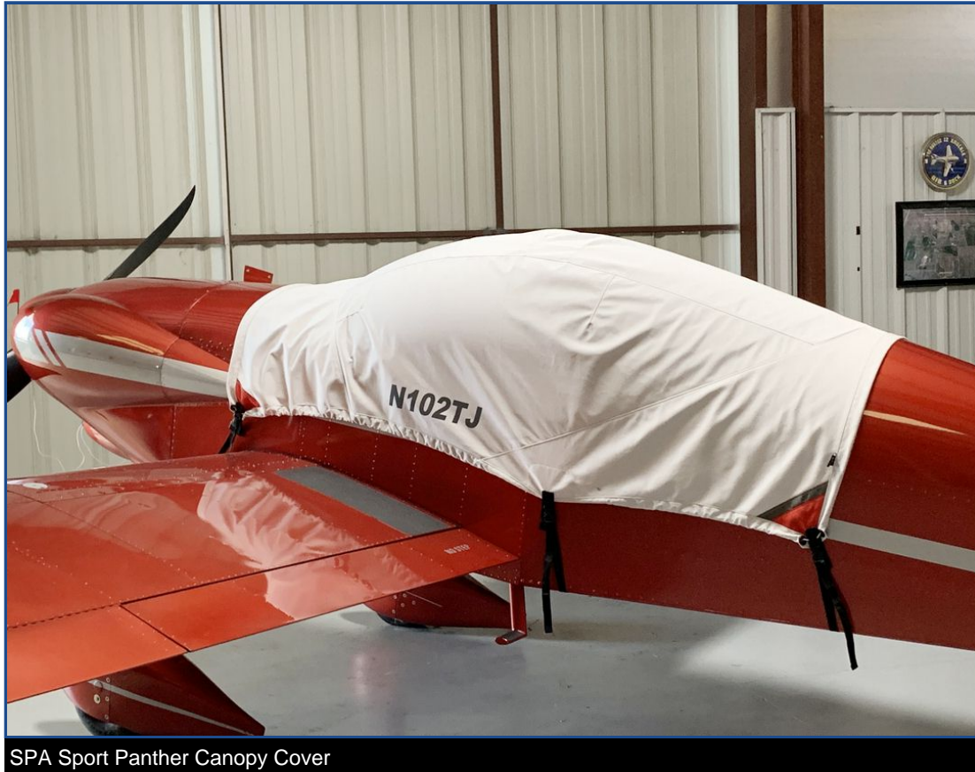
SPA Sport Panther Canopy Cover

(spa-sport-performance-aviation-PAN.pdf)