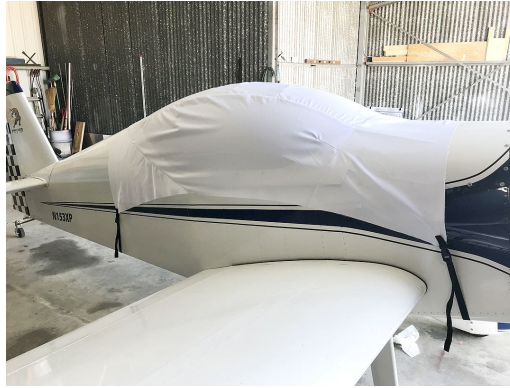
SPA, Sport Performance Aviation, Panther Canopy Cover (test fit cover)

non-travel Sunbrella Cover is the best choice.