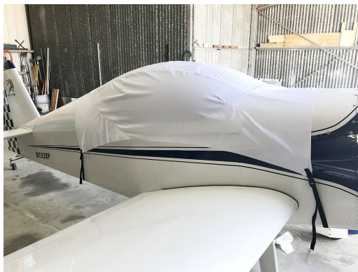
SPA, Sport Performance Aviation, Panther Canopy Cover (test fit cover)