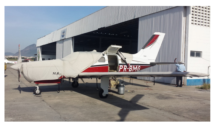
Piper Malibu/Mirage Extended Canopy Cover, Engine, Prop & Wing Covers