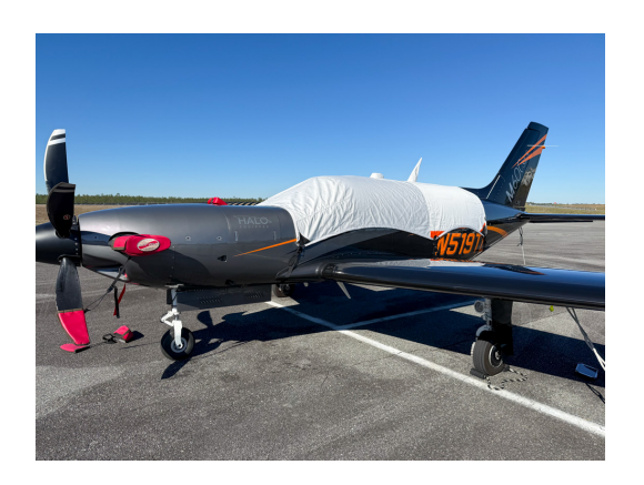
PA-46-600TP Canopy Cover