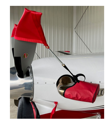
Piper Malibu JetProp Prop Tie & Exhaust Cover