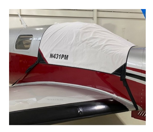
Piper Meridian Cockpit Cover

This cover type is made from Silver Acrylic Sunbrella canvas and is 100% lined with a soft and smooth microfiber. Bruce's Custom Covers developed this material combination especially for aircraft protection. The outer material is medium weight and treated for water resistance, UV resistance and anti-static buildup. The inner lining is a very soft and smooth microfiber to prevent scratching. The material is very reflective, and tests show that the cabin interior temperature can be reduced to near-ambient temperature on the hottest of days. It is water, ice and snow repellent, yet breathable to allow moisture to escape from between the cover and the aircraft surface.