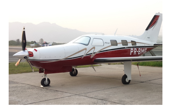
Piper Malibu/Mirage Engine Plugs, Cockpit HeatShields