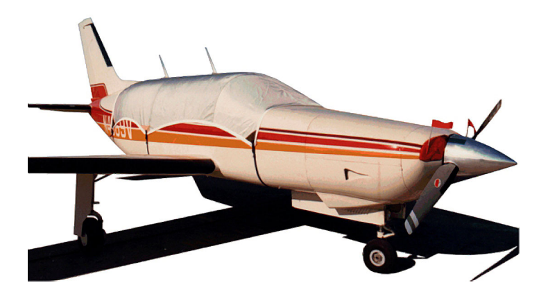
Piper Malibu/Mirage Standard Canopy Cover