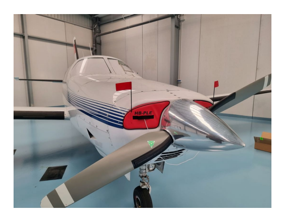
Piper PA-46 Malibu Engine Inlet Plugs