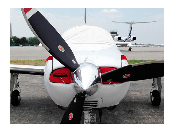
Piper Mirage Engine Plugs

Engine Inlet Plugs are custom fit for your Piper PA-46 Malibu intakes, made with heavy-duty vinyl material, and stuffed with a single block of sculpted urethane foam. Each plug has a zipper that allows the foam to be removed and dried if necessary. Engine plugs have warning flags that are visible from the cockpit or 'remove before flight' streamers sewn onto the face of the plugs. Most plugs are imprinted with the aircraft registration number in black for an extra charge. Storage bag NOT included. Engine plugs may be inserted after flight when the engine is still warm. Engine Inlet Plugs are commonly referred to as Cowl Plugs, Intake Plugs, Cowl Blocks, Engine Blocks, and Engine Bungs.