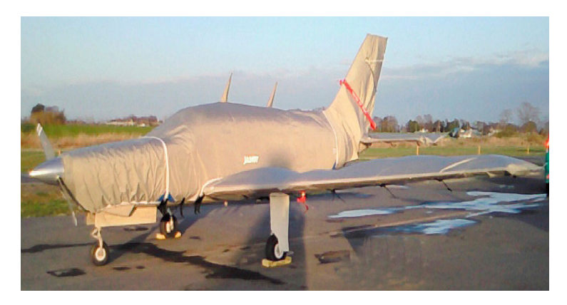
Piper PA-46 Malibu Complete Cover Set

This cover type is made from Silver Acrylic Sunbrella canvas and is 100% lined with a soft and smooth microfiber. Bruce's Custom Covers developed this material combination especially for aircraft protection. The outer material is medium weight and treated for water resistance, UV resistance and anti-static buildup. The inner lining is a very soft and smooth microfiber to prevent scratching. The material is very reflective, and tests show that the cabin interior temperature can be reduced to near-ambient temperature on the hottest of days. It is water, ice and snow repellent, yet breathable to allow moisture to escape from between the cover and the aircraft surface.