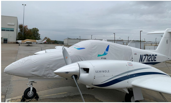
Piper PA-44 Seminole Canopy/Nose Cover with custom artwork