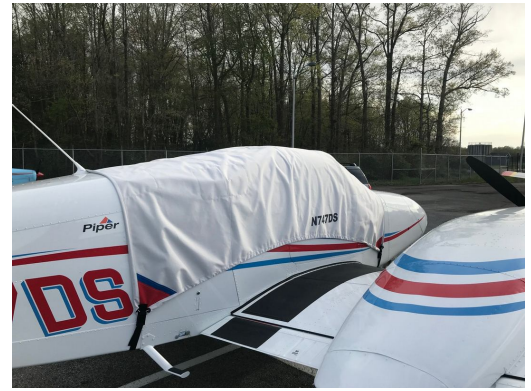
Piper Seminole Canopy Cover