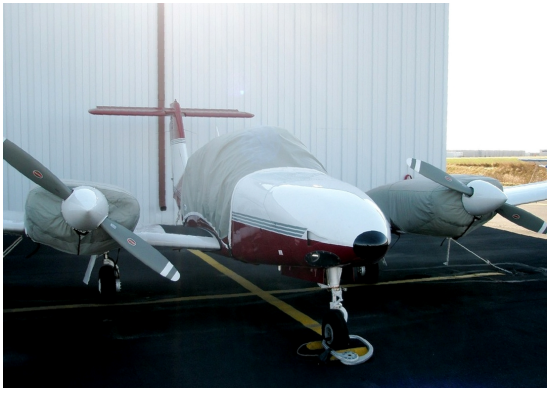
Piper Seminole Canopy and Engine Covers