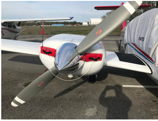
Piper Seminole Engine Plugs