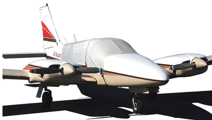
Piper Seneca PA-34 Canopy Cover

Travel Covers are made with Silver Solution-Dyed Polyester fabric and only lined over the windshield to save weight. The material is lightweight and more compact for easy stowage in the aircraft. The polyester material is water resistant, but only intended for occasional use outside. We also have an ultra lightweight material available for fitted hangar dust covers. For daily outdoor use, the non-travel Sunbrella Cover is the best choice.