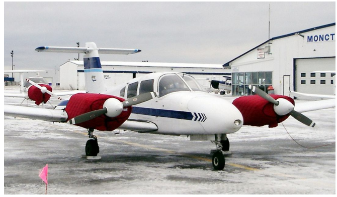
Piper Seminole Insulated Engine Covers