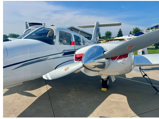
Piper PA-44 Seminole Engine Plugs