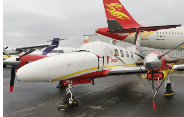
Piper PA-42 Cheyenne III Prop Tie/Exhaust Cover, Inlet Plugs Piper PA-42 Cheyenne III Cockpit Cover, Prop Tie/Exhaust Cover, Inlet Plugs