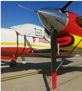
Piper PA-42 Cheyenne III Engine Plugs, Prop Ties, Cockpit Cover