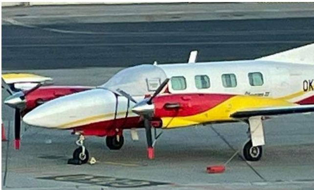
Piper PA-42 Cheyenne III Cockpit Cover

This cover type is made from Silver Acrylic Sunbrella canvas and is 100% lined with a soft and smooth microfiber. Bruce's Custom Covers developed this material combination especially for aircraft protection. The outer material is medium weight and treated for water resistance, UV resistance and anti-static buildup. The inner lining is a very soft and smooth microfiber to prevent scratching. The material is very reflective, and tests show that the cabin interior temperature can be reduced to near-ambient temperature on the hottest of days. It is water, ice and snow repellent, yet breathable to allow moisture to escape from between the cover and the aircraft surface.