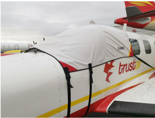
Piper PA-42 Cheyenne III Cockpit Cover

This cover type is made from Silver Acrylic Sunbrella canvas and is 100% lined with a soft and smooth microfiber. Bruce's Custom Covers developed this material combination especially for aircraft protection. The outer material is medium weight and treated for water resistance, UV resistance and anti-static buildup. The inner lining is a very soft and smooth microfiber to prevent scratching. The material is very reflective, and tests show that the cabin interior temperature can be reduced to near-ambient temperature on the hottest of days. It is water, ice and snow repellent, yet breathable to allow moisture to escape from between the cover and the aircraft surface.