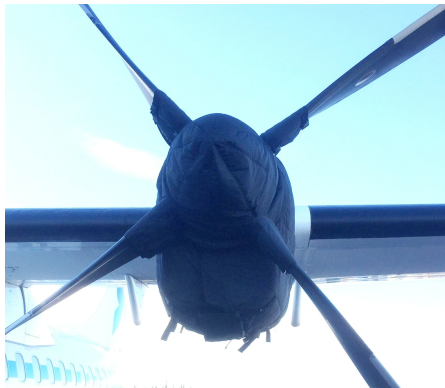
ATR-72-202 Insulated Engine & Prop Hub Covers

This cover type is made from Silver Acrylic Sunbrella canvas and is 100% lined with a soft and smooth microfiber. Bruce's Custom Covers developed this material combination especially for aircraft protection. The outer material is medium weight and treated for water resistance, UV resistance and anti-static buildup. The inner lining is a very soft and smooth microfiber to prevent scratching. The material is very reflective, and tests show that the cabin interior temperature can be reduced to near-ambient temperature on the hottest of days. It is water, ice and snow repellent, yet breathable to allow moisture to escape from between the cover and the aircraft surface.