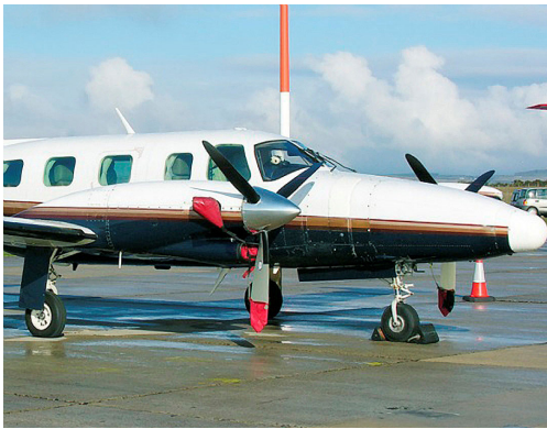
Piper Cheyenne IIXL Prop Tie/Exhaust Covers, Intake Plugs

This cover type is made from Silver Acrylic Sunbrella canvas and is 100% lined with a soft and smooth microfiber. Bruce's Custom Covers developed this material combination especially for aircraft protection. The outer material is medium weight and treated for water resistance, UV resistance and anti-static buildup. The inner lining is a very soft and smooth microfiber to prevent scratching. The material is very reflective, and tests show that the cabin interior temperature can be reduced to near-ambient temperature on the hottest of days. It is water, ice and snow repellent, yet breathable to allow moisture to escape from between the cover and the aircraft surface.