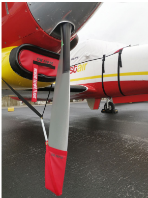
Piper PA-42 Cheyenne III Prop Tie/Exhaust Cover, Inlet Plugs

This cover type is made from Silver Acrylic Sunbrella canvas and is 100% lined with a soft and smooth microfiber. Bruce's Custom Covers developed this material combination especially for aircraft protection. The outer material is medium weight and treated for water resistance, UV resistance and anti-static buildup. The inner lining is a very soft and smooth microfiber to prevent scratching. The material is very reflective, and tests show that the cabin interior temperature can be reduced to near-ambient temperature on the hottest of days. It is water, ice and snow repellent, yet breathable to allow moisture to escape from between the cover and the aircraft surface.