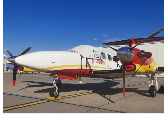
Piper PA-42 Cheyenne III Engine Plugs, Prop Ties, Cockpit Cover