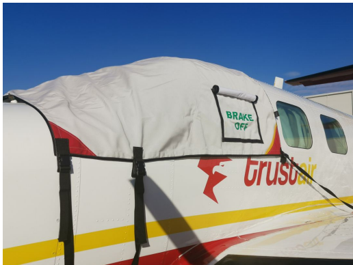
Piper PA-42 Cheyenne III Cockpit Cover

This cover type is made from Silver Acrylic Sunbrella canvas and is 100% lined with a soft and smooth microfiber. Bruce's Custom Covers developed this material combination especially for aircraft protection. The outer material is medium weight and treated for water resistance, UV resistance and anti-static buildup. The inner lining is a very soft and smooth microfiber to prevent scratching. The material is very reflective, and tests show that the cabin interior temperature can be reduced to near-ambient temperature on the hottest of days. It is water, ice and snow repellent, yet breathable to allow moisture to escape from between the cover and the aircraft surface.