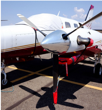
Piper Cheyenne Cockpit Cover, Engine Plugs, Prop Tie/Exhaust Covers

Travel Covers are made with Silver Solution-Dyed Polyester fabric and only lined over the windshield to save weight. The material is lightweight and more compact for easy stowage in the aircraft. The polyester material is water resistant, but only intended for occasional use outside. We also have an ultra lightweight material available for fitted hangar dust covers. For daily outdoor use, the non-travel Sunbrella Cover is the best choice.