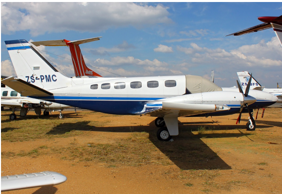
Cessna 441 Conquest II Cockpit Cover