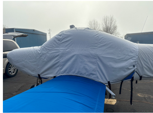
Piper PA-38 Tomahawk Extended Canopy/Engine Cover