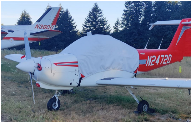
Piper PA-38 Tomahawk Canopy Cover

This cover type is made from Silver Acrylic Sunbrella canvas and is 100% lined with a soft and smooth microfiber. Bruce's Custom Covers developed this material combination especially for aircraft protection. The outer material is medium weight and treated for water resistance, UV resistance and anti-static buildup. The inner lining is a very soft and smooth microfiber to prevent scratching. The material is very reflective, and tests show that the cabin interior temperature can be reduced to near-ambient temperature on the hottest of days. It is water, ice and snow repellent, yet breathable to allow moisture to escape from between the cover and the aircraft surface.