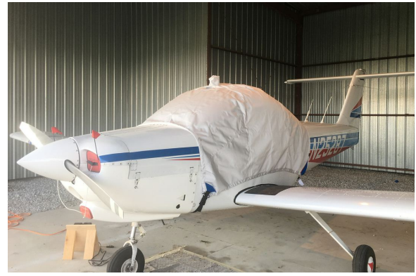
Piper PA-38 Canopy Cover