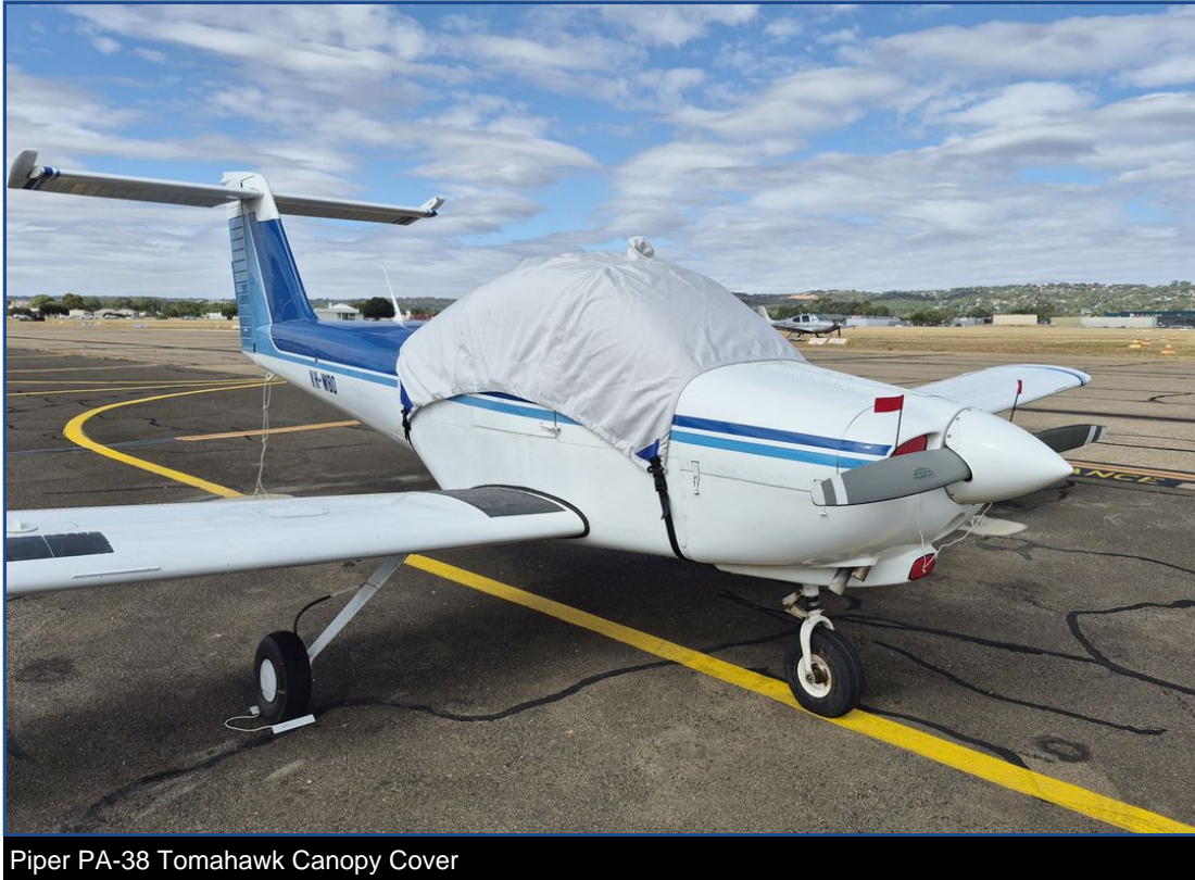
Piper PA-38 Tomahawk Canopy Cover