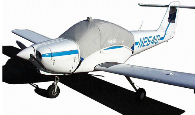
Piper Tomahawk Canopy Cover

Travel Covers are made with Silver Solution-Dyed Polyester fabric and only lined over the windshield to save weight. The material is lightweight and more compact for easy stowage in the aircraft. The polyester material is water resistant, but only intended for occasional use outside. We also have an ultra lightweight material available for fitted hangar dust covers. For daily outdoor use, the non-travel Sunbrella Cover is the best choice.