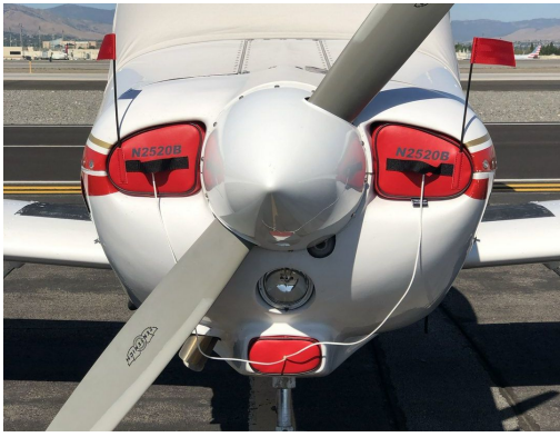
Piper Tomahawk Engine Inlet Plugs, set of 3