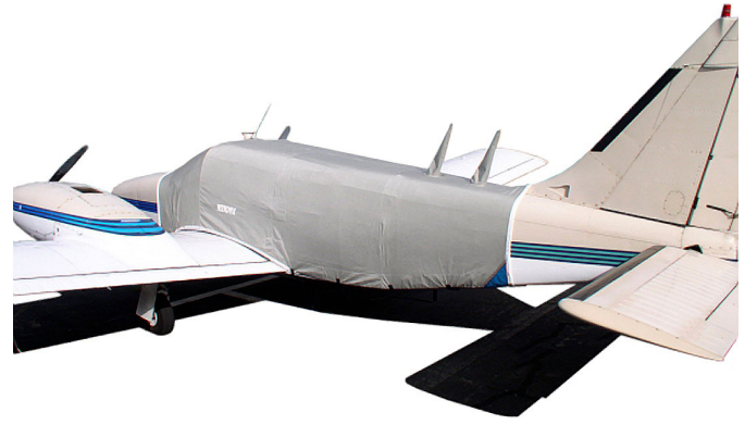
Piper Seneca Extra-Extended Canopy Cover, extends back to tail