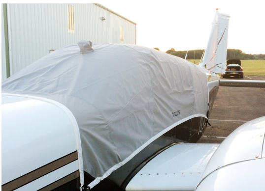
Piper PA-34 Seneca Travel Cover

Travel Covers are made with Silver Solution-Dyed Polyester fabric and only lined over the windshield to save weight. The material is lightweight and more compact for easy stowage in the aircraft. The polyester material is water resistant, but only intended for occasional use outside. We also have an ultra lightweight material available for fitted hangar dust covers. For daily outdoor use, the non-travel Sunbrella Cover is the best choice.