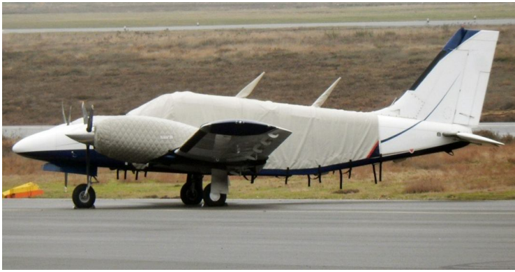
Piper Seneca Insulated Engine Covers