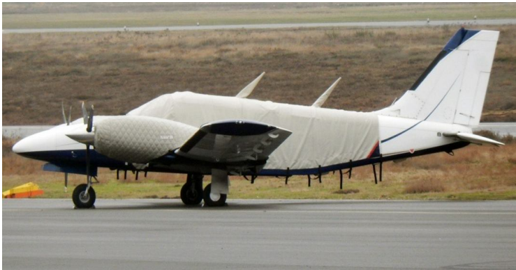
Piper Seneca Insulated Engine Covers

Covers developed this material combination especially for aircraft protection. The outer material is medium weight and treated for water resistance, UV resistance and anti-static buildup. The inner lining is a very soft and smooth microfiber to prevent scratching. The material is very reflective, and tests show that the cabin interior temperature can be reduced to near-ambient temperature on the hottest of days. It is water, ice and snow repellent, yet breathable to allow moisture to escape from between the cover and the aircraft surface.