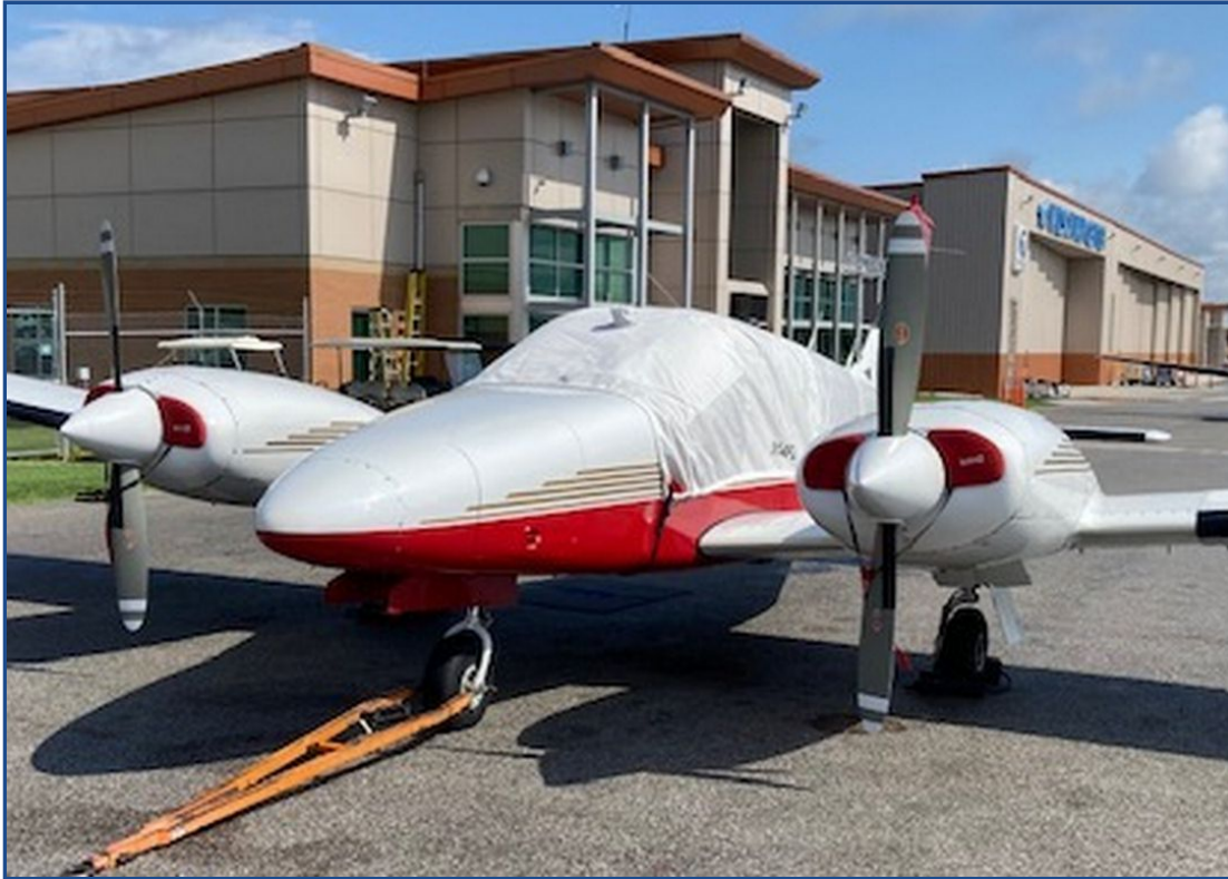
Piper PA-34 Seneca Canopy Cover