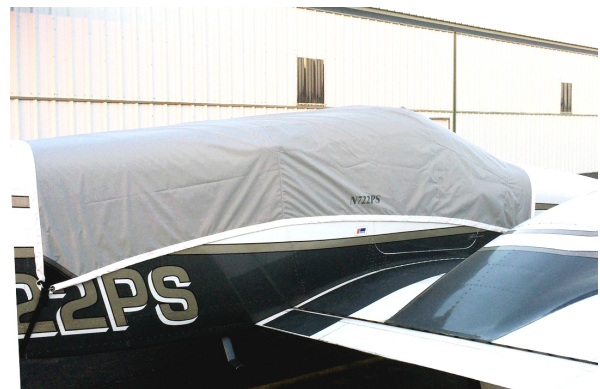
Piper PA-34 Seneca Travel Cover