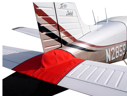
Piper PA-28 Tailcone Cover

WINTER USE MATERIAL - Made with Solution-Dyed Polyester fabric, this option is intended for seasonal use to aid in deicing, rain mitigation, or for occasional travel. The material is lighter and more compact, but more susceptible to UV damage and may have a shorter useful life if used continuously outside than the all-year use material.