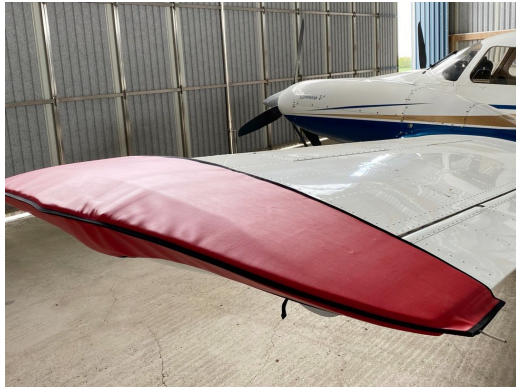
Piper PA-34 Seneca Wingtip Pads

Designed to prevent damage to the aircraft extremities in crowded hangars, these products are made of bright red Naugahyde and thickly padded with a sandwich of closed cell foam.