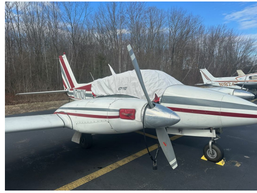
Piper PA-30 Twin Comanche Canopy Cover