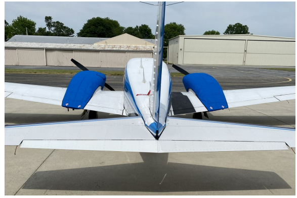
Piper PA-30 Twin Comanche Insulated Engine Covers