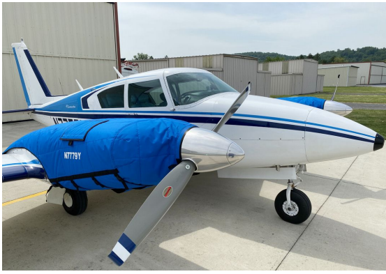
Piper PA-30 Twin Comanche Insulated Engine Covers