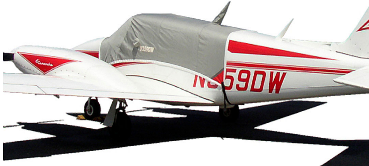
Piper Twin Comanche Canopy Cover

Travel Covers are made with Silver Solution-Dyed Polyester fabric and only lined over the windshield to save weight. The material is lightweight and more compact for easy stowage in the aircraft. The polyester material is water resistant, but only intended for occasional use outside. We also have an ultra lightweight material available for fitted hangar dust covers. For daily outdoor use, the non-travel Sunbrella Cover is the best choice.