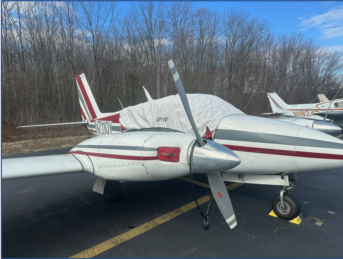
Piper PA-30 Twin Comanche Canopy Cover