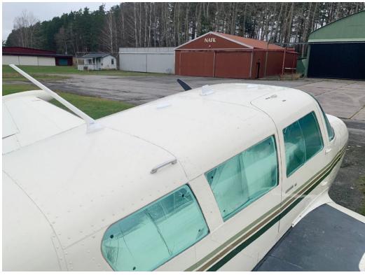
Piper PA-30 Twin Comanche HeatShields