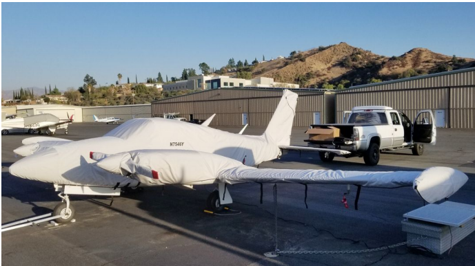
Piper PA-30 Twin Comanche Complete Cover Set

WINTER USE MATERIAL - Made with Solution-Dyed Polyester fabric, this option is intended for seasonal use to aid in deicing, rain mitigation, or for occasional travel. The material is lighter and more compact, but more susceptible to UV damage and may have a shorter useful life if used continuously outside than the all-year use material.