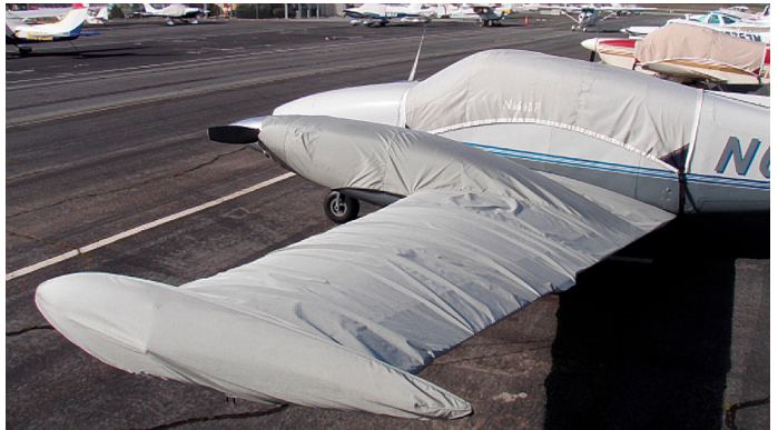
Piper Twin Comanche Canopy Cover, Wing & Engine Covers with Tip Tanks