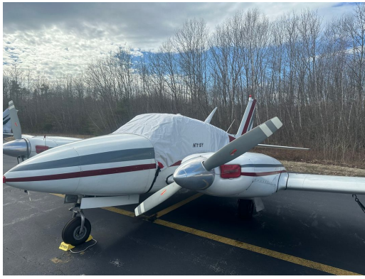
Piper PA-30 Twin Comanche Canopy Cover