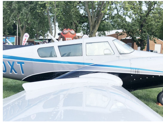
Piper PA-30 Twin Comanche Cockpit HeatShields