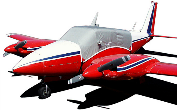
Piper Twin Comanche Canopy Cover