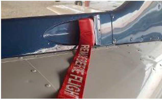
Piper PA-30/39 Twin Comanche Dorsal Inlet Plug