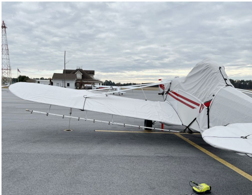
Piper PA-25 Pawnee Cover Set

WINTER USE MATERIAL - Made with Solution-Dyed Polyester fabric, this option is intended for seasonal use to aid in deicing, rain mitigation, or for occasional travel. The material is lighter and more compact, but more susceptible to UV damage and may have a shorter useful life if used continuously outside than the all-year use material.