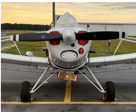
Piper PA-25 Pawnee Canopy/Hopper Cover

Engine Inlet Plugs are custom fit for your Piper Pawnee PA-25 intakes, made with heavy-duty vinyl material, and stuffed with a single block of sculpted urethane foam. Each plug has a zipper that allows the foam to be removed and dried if necessary. Engine plugs have warning flags that are visible from the cockpit or 'remove before flight' streamers sewn onto the face of the plugs. Most plugs are imprinted with the aircraft registration number in black for an extra charge. Storage bag NOT included. Engine plugs may be inserted after flight when the engine is still warm. Engine Inlet Plugs are commonly referred to as Cowl Plugs, Intake Plugs, Cowl Blocks, Engine Blocks, and Engine Bungs.