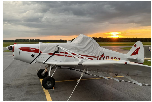
Piper PA-25 Pawnee Canopy/Hopper Cover