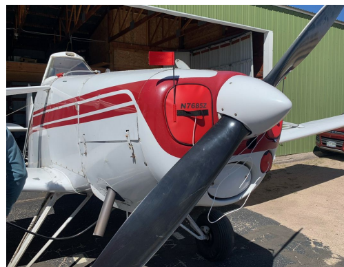
Piper PA-25 Pawnee Engine Plugs