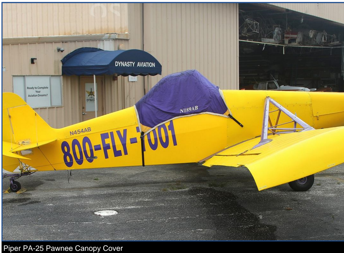
Piper PA-25 Pawnee Canopy Cover