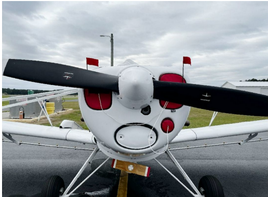
Piper Pawnee PA25 Engine Inlet Plugs