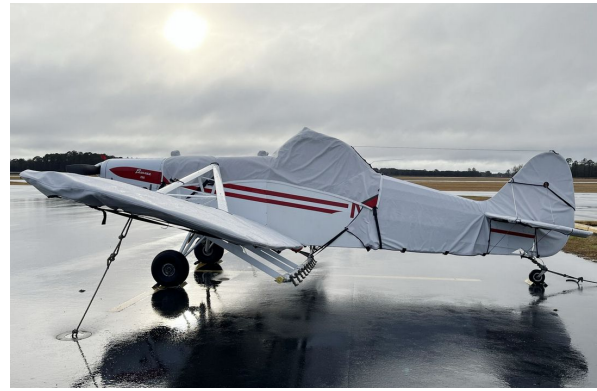
Piper Pawnee Canopy/Hopper, Wing & Empennage Covers