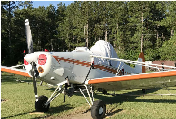
Piper Pawnee PA-25 Canopy/Hopper Cover, Engine Plugs

Engine Inlet Plugs are custom fit for your Piper Pawnee PA-25 intakes, made with heavy-duty vinyl material, and stuffed with a single block of sculpted urethane foam. Each plug has a zipper that allows the foam to be removed and dried if necessary. Engine plugs have warning flags that are visible from the cockpit or 'remove before flight' streamers sewn onto the face of the plugs. Most plugs are imprinted with the aircraft registration number in black for an extra charge. Storage bag NOT included. Engine plugs may be inserted after flight when the engine is still warm. Engine Inlet Plugs are commonly referred to as Cowl Plugs, Intake Plugs, Cowl Blocks, Engine Blocks, and Engine Bungs.