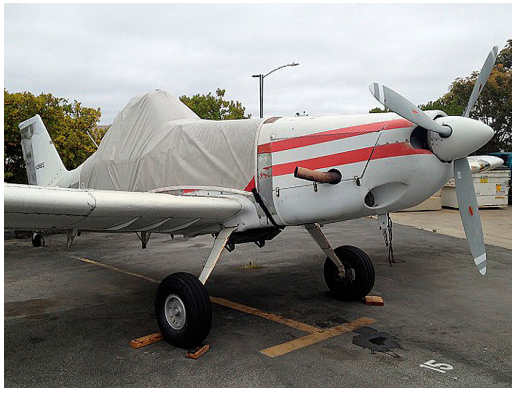
Piper Brave PA-36 Canopy/Hopper Cover