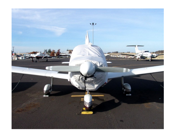
Piper PA-28 Extended Canopy Cover and Engine Cover