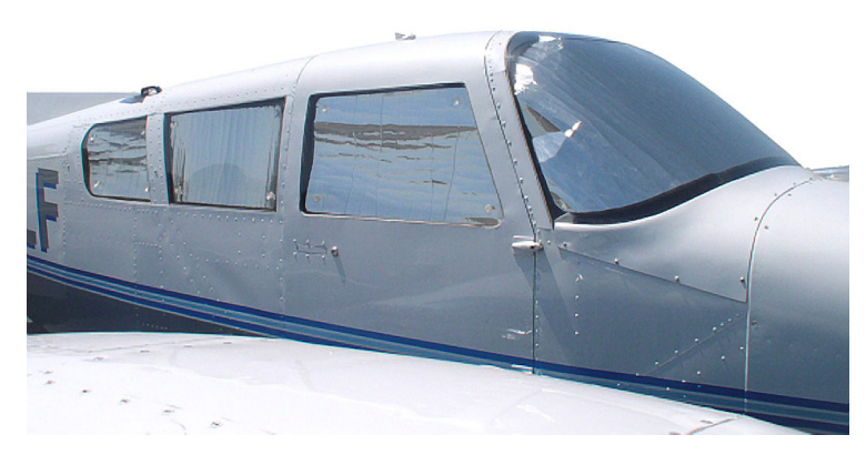
Piper Comanche HeatShield Set

Windshield Heatshields are interior sunshades for an aircraft's front windshield. The product is a unique composite of closed-cell foam with a silver mylar finish. The semi-rigid design is stiff enough to stand along the inside of the windshield using sun visors or window framing. It folds up flat and easily stores in the included storage sleeve. Some designs may require velcro and suction cups or split right and left sides. A Heatshield is an excellent short-term remedy for cockpit overheating. An external fabric cover is far more effective and practical for long-term protection.