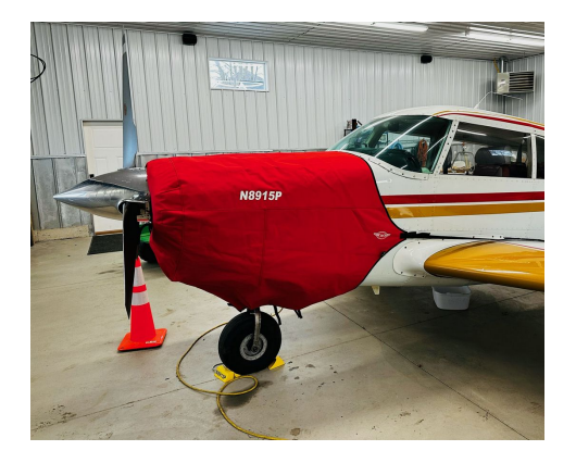
Piper PA-24-260 Comanche Insulated Engine Cover