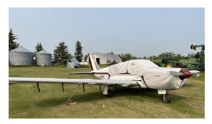
Piper PA-24 Comanche Canopy, Engine, Wing Covers