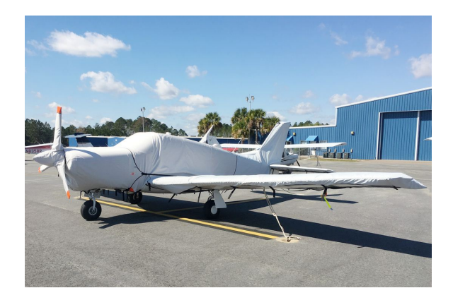
Piper PA-24 Comanche Full Cover Set

WINTER USE MATERIAL - Made with Solution-Dyed Polyester fabric, this option is intended for seasonal use to aid in deicing, rain mitigation, or for occasional travel. The material is lighter and more compact, but more susceptible to UV damage and may have a shorter useful life if used continuously outside than the all-year use material.