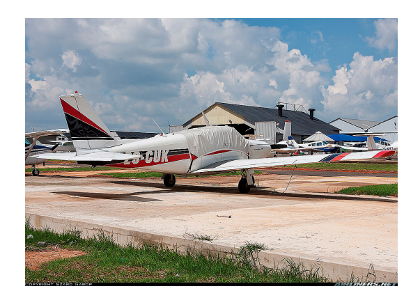
Piper Comanche Canopy Cover

This cover type is made from Silver Acrylic Sunbrella canvas and is 100% lined with a soft and smooth microfiber. Bruce's Custom Covers developed this material combination especially for aircraft protection. The outer material is medium weight and treated for water resistance, UV resistance and anti-static buildup. The inner lining is a very soft and smooth microfiber to prevent scratching. The material is very reflective, and tests show that the cabin interior temperature can be reduced to near-ambient temperature on the hottest of days. It is water, ice and snow repellent, yet breathable to allow moisture to escape from between the cover and the aircraft surface.