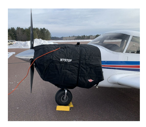
Piper PA-24-250 Insulated Engine Cover