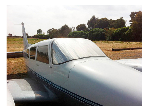
Piper Comanche Windshield HeatShield