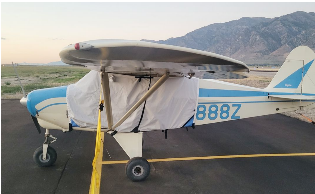
Piper PA-22 Colt Extended Canopy Cover

This cover type is made from Silver Acrylic Sunbrella canvas and is 100% lined with a soft and smooth microfiber. Bruce's Custom Covers developed this material combination especially for aircraft protection. The outer material is medium weight and treated for water resistance, UV resistance and anti-static buildup. The inner lining is a very soft and smooth microfiber to prevent scratching. The material is very reflective, and tests show that the cabin interior temperature can be reduced to near-ambient temperature on the hottest of days. It is water, ice and snow repellent, yet breathable to allow moisture to escape from between the cover and the aircraft surface.