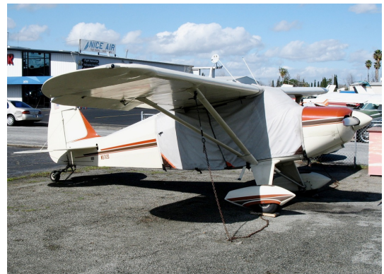
Piper PA-22 Extended Canopy Cover