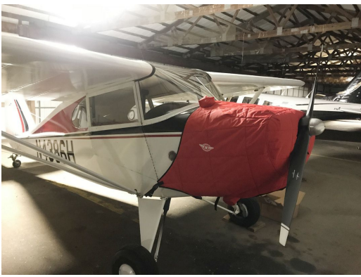
Piper PA-15 Vagabond Insulated Engine Cover