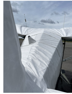
Piper PA-22 Tri-Pacer Empennage Cover