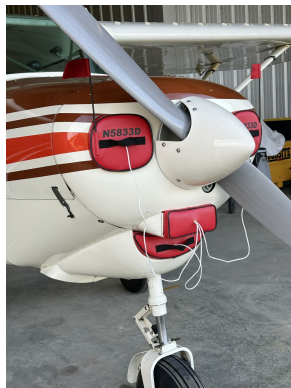
Piper PA-22-150 Engine Inlet Plugs

Engine Inlet Plugs are custom fit for your Piper Clipper, Pacer, Tri-Pacer, Vagabond, Colt: PA-15, 16, 20, 22 intakes, made with heavy-duty vinyl material, and stuffed with a single block of sculpted urethane foam. Each plug has a zipper that allows the foam to be removed and dried if necessary. Engine plugs have warning flags that are visible from the cockpit or 'remove before flight' streamers sewn onto the face of the plugs. Most plugs are imprinted with the aircraft registration number in black for an extra charge. Storage bag NOT included. Engine plugs may be inserted after flight when the engine is still warm. Engine Inlet Plugs are commonly referred to as Cowl Plugs, Intake Plugs, Cowl Blocks, Engine Blocks, and Engine Bungs.