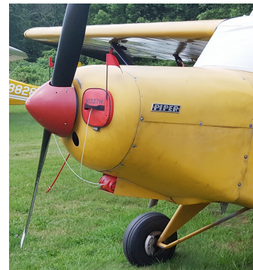
Piper PA-20 Engine Inlet Plugs