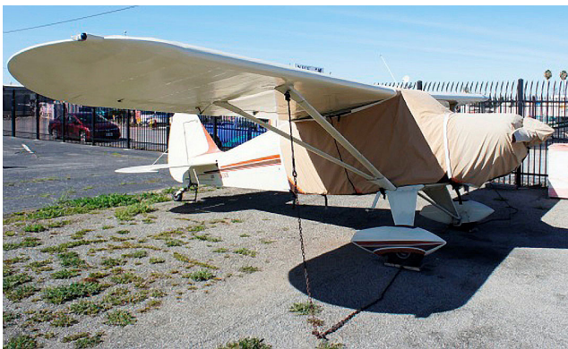
Piper PA-22-150 Pacer Extended Canopy, Engine & Prop/Spinner Covers

Travel Covers are made with Silver Solution-Dyed Polyester fabric and only lined over the windshield to save weight. The material is lightweight and more compact for easy stowage in the aircraft. The polyester material is water resistant, but only intended for occasional use outside. We also have an ultra lightweight material available for fitted hangar dust covers. For daily outdoor use, the non-travel Sunbrella Cover is the best choice.