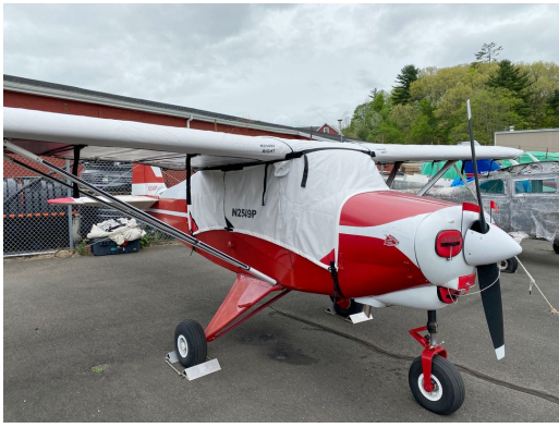
Piper Tri-Pacer PA22-150 Canopy & Wing Covers, Engine Plugs