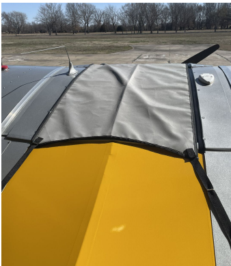
Piper PA-18 Windshield/Skylight Cover

This cover type is made from Silver Acrylic Sunbrella canvas and is 100% lined with a soft and smooth microfiber. Bruce's Custom Covers developed this material combination especially for aircraft protection. The outer material is medium weight and treated for water resistance, UV resistance and anti-static buildup. The inner lining is a very soft and smooth microfiber to prevent scratching. The material is very reflective, and tests show that the cabin interior temperature can be reduced to near-ambient temperature on the hottest of days. It is water, ice and snow repellent, yet breathable to allow moisture to escape from between the cover and the aircraft surface.