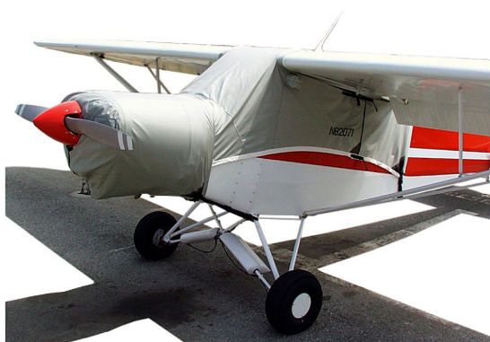
Piper PA-18 Super Cub Canopy & Engine Covers

This cover type is made from Silver Acrylic Sunbrella canvas and is 100% lined with a soft and smooth microfiber. Bruce's Custom Covers developed this material combination especially for aircraft protection. The outer material is medium weight and treated for water resistance, UV resistance and anti-static buildup. The inner lining is a very soft and smooth microfiber to prevent scratching. The material is very reflective, and tests show that the cabin interior temperature can be reduced to near-ambient temperature on the hottest of days. It is water, ice and snow repellent, yet breathable to allow moisture to escape from between the cover and the aircraft surface.