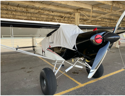
Piper PA-18 Super Cub Canopy Cover, Over Top Type