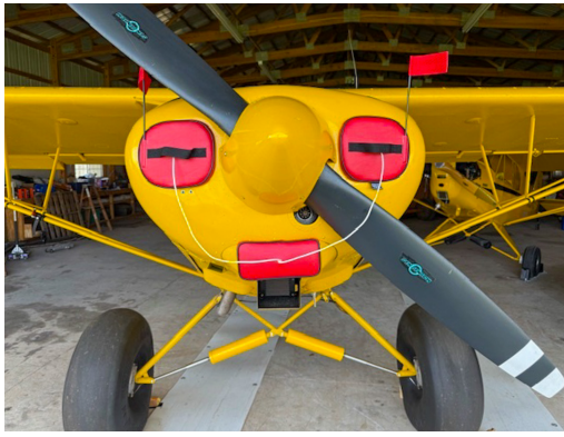
Piper PA-18-150 Engine Inlet Plugs (set of 3)