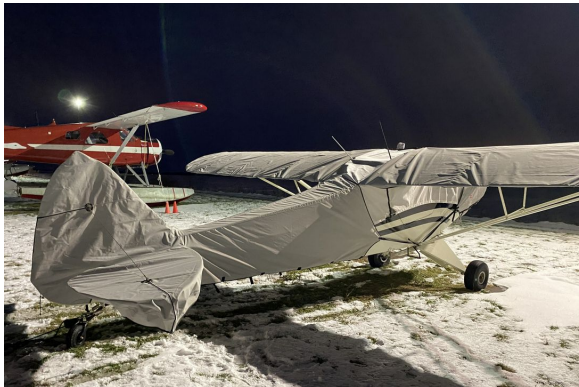
PA-18 Super Cub Winter Cover Set