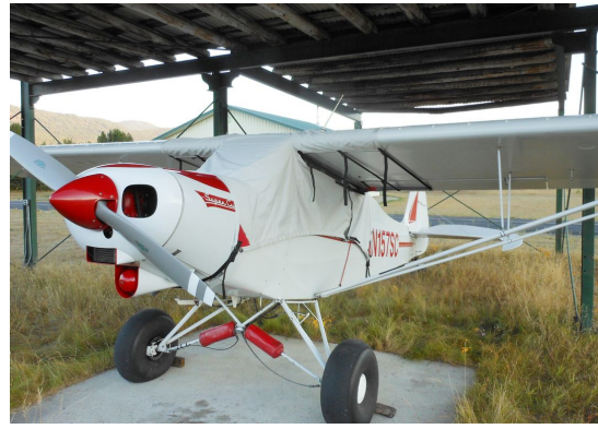
Piper PA-18 Super Cub Canopy Cover (Over-The-Top Style), Belly Strap Type, Extends To Cover Gas Caps