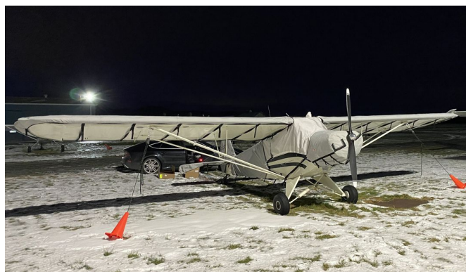
PA-18 Super Cub Winter Cover Set