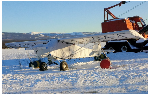
Piper Super Cub Complete Cover Set