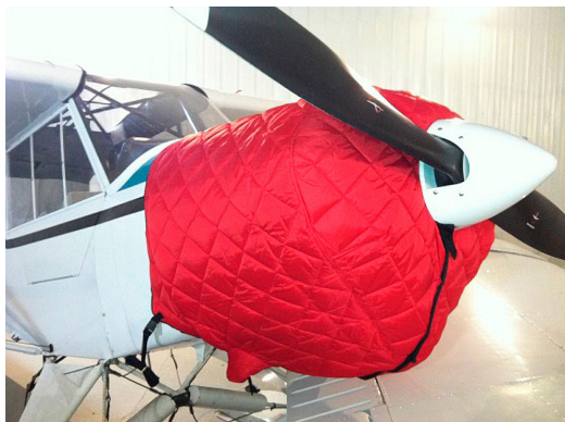
Piper Super Cub Insulated Engine Cover

This cover type is made from Silver Acrylic Sunbrella canvas and is 100% lined with a soft and smooth microfiber. Bruce's Custom Covers developed this material combination especially for aircraft protection. The outer material is medium weight and treated for water resistance, UV resistance and anti-static buildup. The inner lining is a very soft and smooth microfiber to prevent scratching. The material is very reflective, and tests show that the cabin interior temperature can be reduced to near-ambient temperature on the hottest of days. It is water, ice and snow repellent, yet breathable to allow moisture to escape from between the cover and the aircraft surface.