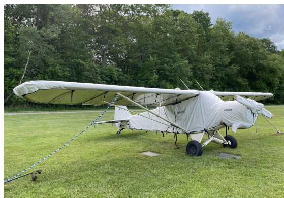
Piper Super Cub Complete Cover Set