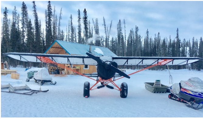
Piper PA-18 Super Cub Canopy Cover (Over-The-Top Style)