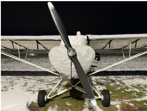
PA-18 Super Cub Insulated Engine Cover

WINTER USE MATERIAL - Made with Solution-Dyed Polyester fabric, this option is intended for seasonal use to aid in deicing, rain mitigation, or for occasional travel. The material is lighter and more compact, but more susceptible to UV damage and may have a shorter useful life if used continuously outside than the all-year use material.