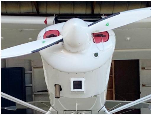
Piper PA-18 Super Cub Engine Plugs