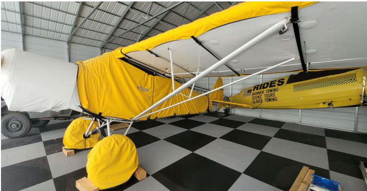
Piper PA-18 Complete Cover Set

WINTER USE MATERIAL - Made with Solution-Dyed Polyester fabric, this option is intended for seasonal use to aid in deicing, rain mitigation, or for occasional travel. The material is lighter and more compact, but more susceptible to UV damage and may have a shorter useful life if used continuously outside than the all-year use material.