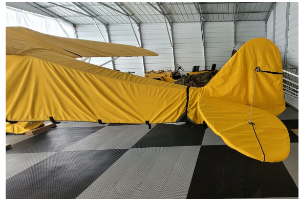
Piper PA-18 Empennage Cover