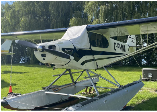
Piper PA-18 Super Cub Windshield/Skylight Cover