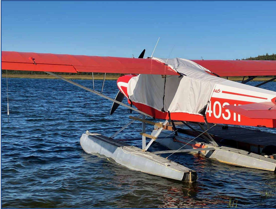
Piper PA-18 Super Cub Canopy Cover, Over Top Type