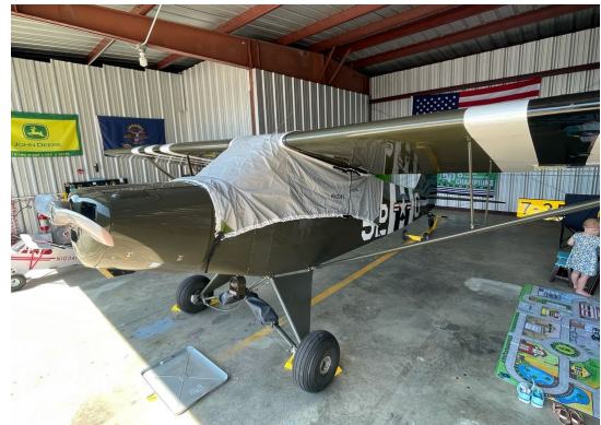
Piper PA-18 Super Cub L18-C Travel cover