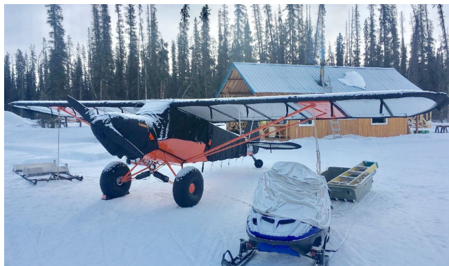
Piper PA-18 Super Cub Canopy Cover (Over-The-Top Style)