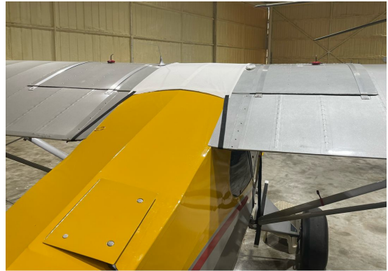
Piper J5A Windshield/Skylight Cover, test fit