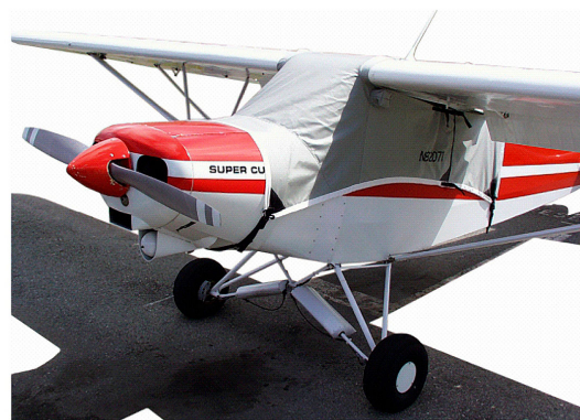
Piper PA-18 Super Cub Canopy Cover