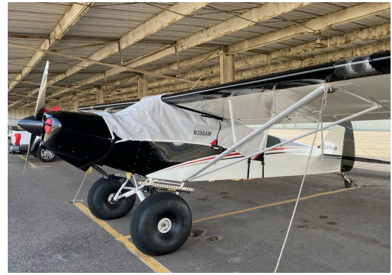
Piper PA-18 Super Cub Canopy Cover, Over Top Type