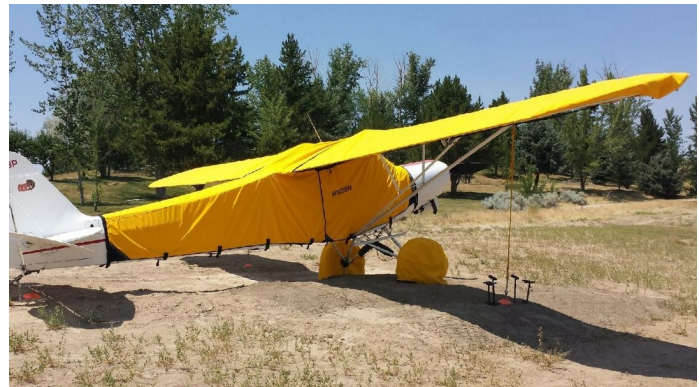
Piper PA-18 Super Cub Extended Canopy Cover, Wing & Tire Covers