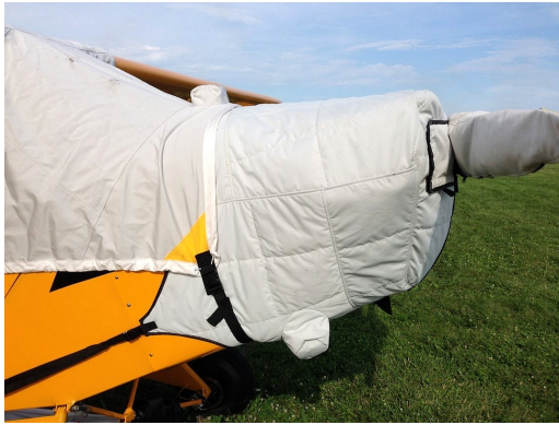
Piper J-3 Cub Insulated Engine Cover with added Pre-heater Access Flaps

This cover type is made from Silver Acrylic Sunbrella canvas and is 100% lined with a soft and smooth microfiber. Bruce's Custom Covers developed this material combination especially for aircraft protection. The outer material is medium weight and treated for water resistance, UV resistance and anti-static buildup. The inner lining is a very soft and smooth microfiber to prevent scratching. The material is very reflective, and tests show that the cabin interior temperature can be reduced to near-ambient temperature on the hottest of days. It is water, ice and snow repellent, yet breathable to allow moisture to escape from between the cover and the aircraft surface.