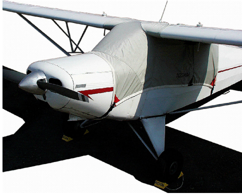
Piper PA-12 Super Cruiser Over-Top Canopy Cover

This cover type is made from Silver Acrylic Sunbrella canvas and is 100% lined with a soft and smooth microfiber. Bruce's Custom Covers developed this material combination especially for aircraft protection. The outer material is medium weight and treated for water resistance, UV resistance and anti-static buildup. The inner lining is a very soft and smooth microfiber to prevent scratching. The material is very reflective, and tests show that the cabin interior temperature can be reduced to near-ambient temperature on the hottest of days. It is water, ice and snow repellent, yet breathable to allow moisture to escape from between the cover and the aircraft surface.