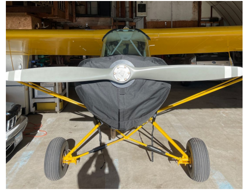
Piper PA-11 Replica Insulated Engine Cover