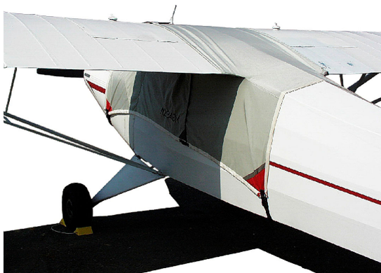
Piper PA-12 Super Cruiser Over-Top Canopy Cover

This cover type is made from Silver Acrylic Sunbrella canvas and is 100% lined with a soft and smooth microfiber. Bruce's Custom Covers developed this material combination especially for aircraft protection. The outer material is medium weight and treated for water resistance, UV resistance and anti-static buildup. The inner lining is a very soft and smooth microfiber to prevent scratching. The material is very reflective, and tests show that the cabin interior temperature can be reduced to near-ambient temperature on the hottest of days. It is water, ice and snow repellent, yet breathable to allow moisture to escape from between the cover and the aircraft surface.