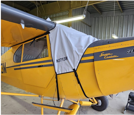
Piper PA-12: Super Cruiser, J5 Cub Windshield/Skylight Cover

The material is very reflective, and tests show that the cabin interior temperature can be reduced to near-ambient temperature on the hottest of days. It is water, ice and snow repellent, yet breathable to allow moisture to escape from between the cover and the aircraft surface.