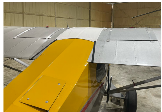
Piper J5A Windshield/Skylight Cover, test fit