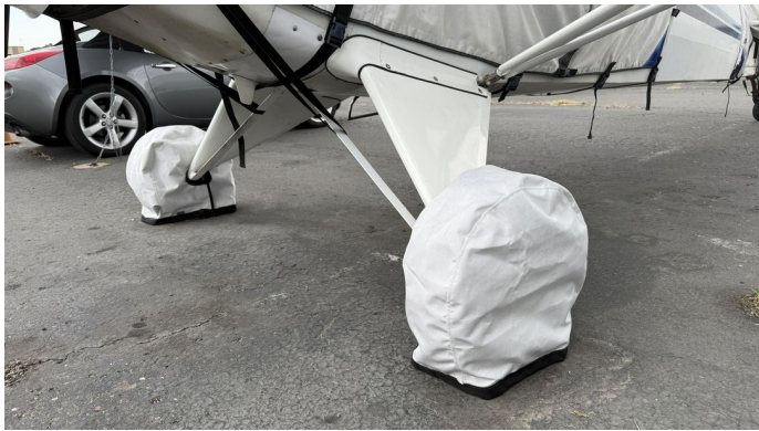
Piper PA-12: Super Cruiser, J5 Cub Tire Covers (No Wheelpant Faring) (Specify Tire Size)