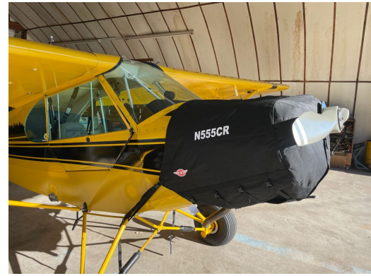
Piper PA-11 Replica Insulated Engine Cover