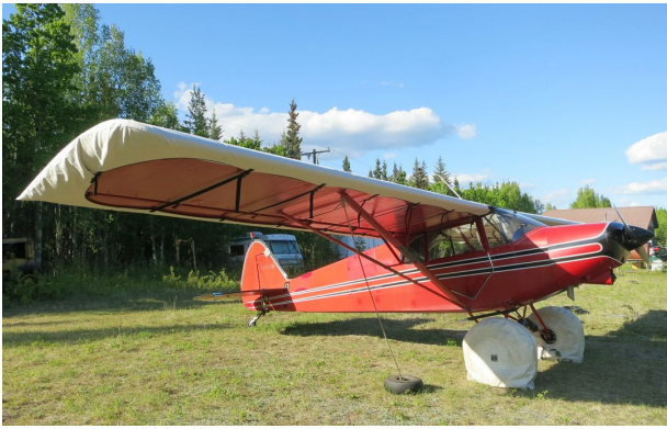
Piper PA-12 Wing Covers