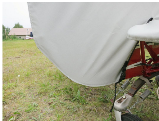
Piper PA-12 Abbreviated Empennage Cover