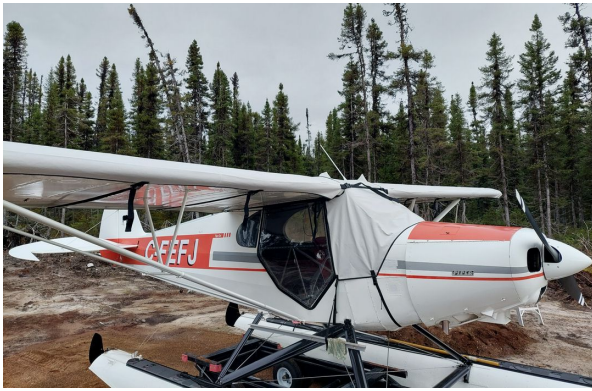
Piper PA-12 Windshield/Skylight & Wing Covers