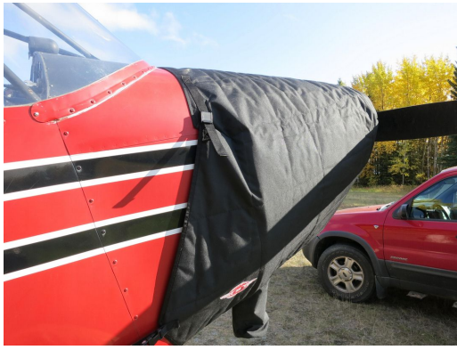
Piper PA-12 Insulated Engine Cover