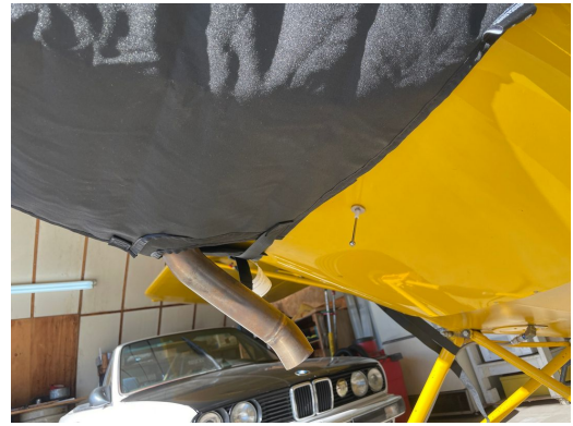
Piper PA-11 Replica Insulated Engine Cover