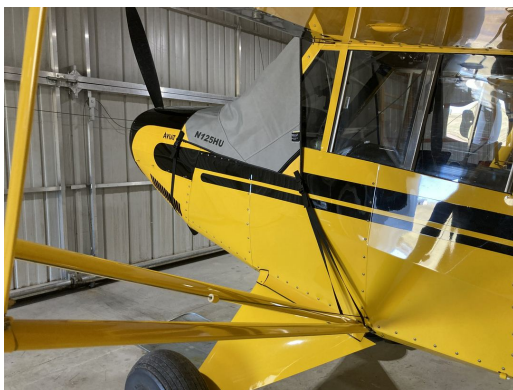
Aviat Husky Windshield/Skylight Cover

This cover type is made from Silver Acrylic Sunbrella canvas and is 100% lined with a soft and smooth microfiber. Bruce's Custom Covers developed this material combination especially for aircraft protection. The outer material is medium weight and treated for water resistance, UV resistance and anti-static buildup. The inner lining is a very soft and smooth microfiber to prevent scratching. The material is very reflective, and tests show that the cabin interior temperature can be reduced to near-ambient temperature on the hottest of days. It is water, ice and snow repellent, yet breathable to allow moisture to escape from between the cover and the aircraft surface.