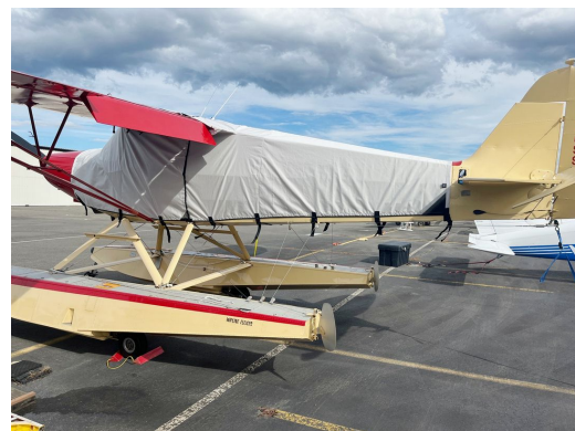
Piper PA-12 Extended Canopy Cover, Extends to Tail