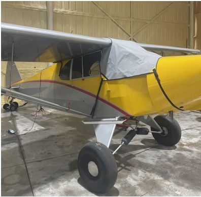
Piper PA-12: Super Cruiser Light Weight Travel Windshield/Skylight Cover