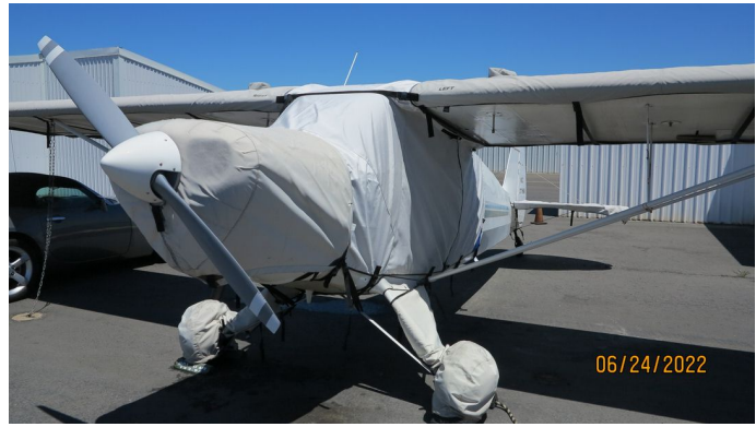
Piper PA-12 Over-Top Canopy Cover, Engine, Wing & Landing Gear Covers