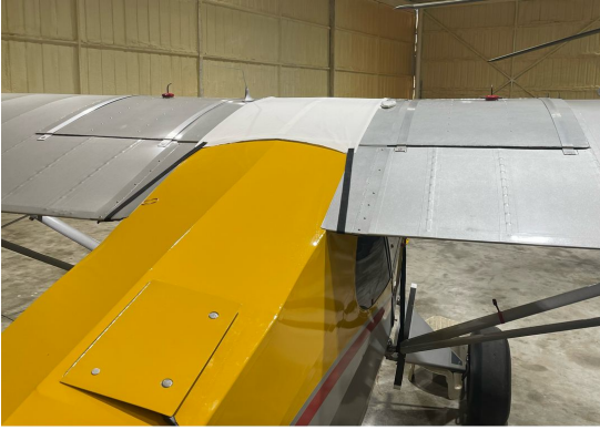
Piper J5A Windshield/Skylight Cover, test fit

The material is very reflective, and tests show that the cabin interior temperature can be reduced to near-ambient temperature on the hottest of days. It is water, ice and snow repellent, yet breathable to allow moisture to escape from between the cover and the aircraft surface.