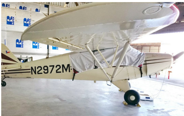
Piper PA-12 Wrap-Around Canopy Cover

This cover type is made from Silver Acrylic Sunbrella canvas and is 100% lined with a soft and smooth microfiber. Bruce's Custom Covers developed this material combination especially for aircraft protection. The outer material is medium weight and treated for water resistance, UV resistance and anti-static buildup. The inner lining is a very soft and smooth microfiber to prevent scratching. The material is very reflective, and tests show that the cabin interior temperature can be reduced to near-ambient temperature on the hottest of days. It is water, ice and snow repellent, yet breathable to allow moisture to escape from between the cover and the aircraft surface.