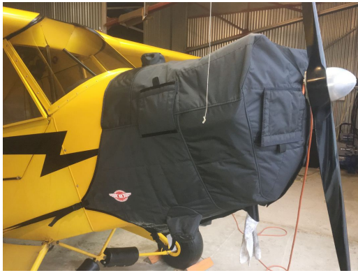
Piper J3 Cub Insulated Engine Cover