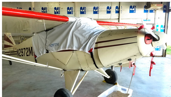
Piper PA-12 Wrap-Around Canopy Cover, Engine Plugs

Engine Inlet Plugs are custom fit for your Piper PA-12: Super Cruiser, J5 Cub intakes, made with heavy-duty vinyl material, and stuffed with a single block of sculpted urethane foam. Each plug has a zipper that allows the foam to be removed and dried if necessary. Engine plugs have warning flags that are visible from the cockpit or 'remove before flight' streamers sewn onto the face of the plugs. Most plugs are imprinted with the aircraft registration number in black for an extra charge. Storage bag NOT included. Engine plugs may be inserted after flight when the engine is still warm. Engine Inlet Plugs are commonly referred to as Cowl Plugs, Intake Plugs, Cowl Blocks, Engine Blocks, and Engine Bunges.