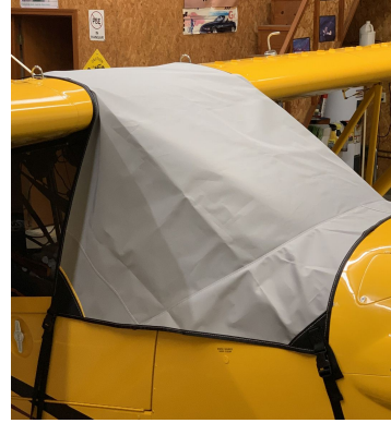
Cub Crafter's Carbon Cub FX3 Windshield/Skylight Cover, travel weight