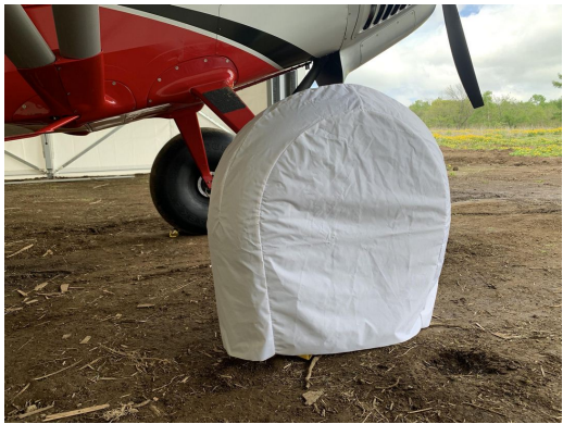
Cub Crafters CC19 Oversize Tire Covers, test fit cover

ALL-YEAR USE MATERIAL - Made with Silver Acrylic Sunbrella canvas, the all-year use material is the best option for sun protection and cover longevity. This heavier more durable material is intended for all weather conditions, such as rain and snow or lots of sun.