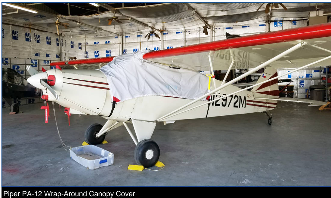
Piper PA-12 Wrap-Around Canopy Cover