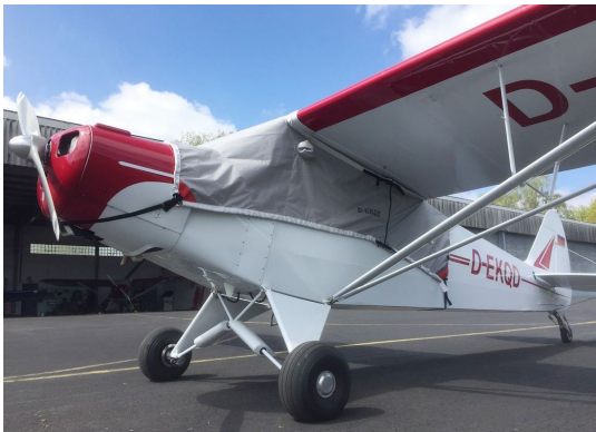
Piper Super Cub Travel Weight Canopy Cover