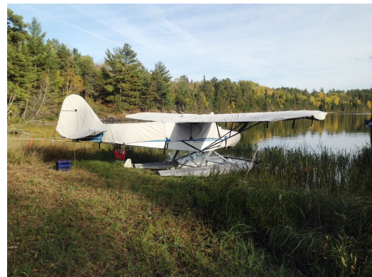
Piper PA-11 Cover Set