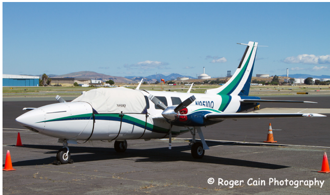
Piper Aerostar Cockpit Cover and Engine Inlet Plugs

The Piper PA-601 Aerostar Nose Cover is designed to cover the section of the fuselage forward of the windshield to the tip of the nose. It is secured with belly straps. This cover type is made from Silver Acrylic Sunbrella canvas and is 100% lined with a soft and smooth microfiber. Bruce's Custom Covers developed this material combination especially for aircraft protection. The outer material is medium weight and treated for water resistance, UV resistance and anti-static buildup. The inner lining is a very soft and smooth microfiber to prevent scratching. The material is very reflective, and tests show that the cabin interior temperature can be reduced to near-ambient temperature on the hottest of days. It is water, ice and snow repellent, yet breathable to allow moisture to escape from between the cover and the aircraft surface.