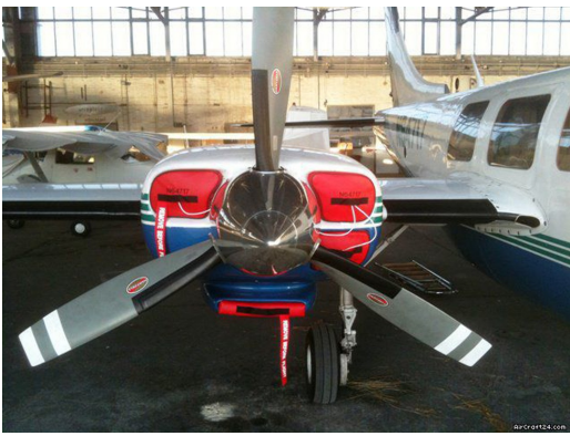
Aerostar Engine Inlet Plugs