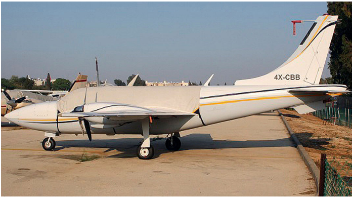
Piper Aerostar Canopy Cover