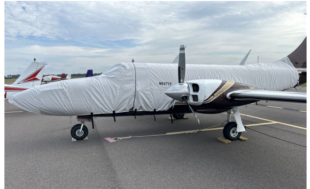
Piper PA-601 Aerostar Canopy Cover (Windows Only), Engine Plugs Piper PA-601 Aerostar Fuselage Cover (back to Horiz Stab)