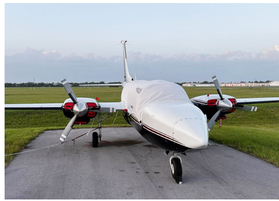
Piper PA-601 Aerostar Canopy Cover (Windows Only), Engine Plugs