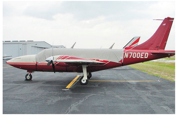
Piper Aerostar Canopy Cover, extended over baggage door