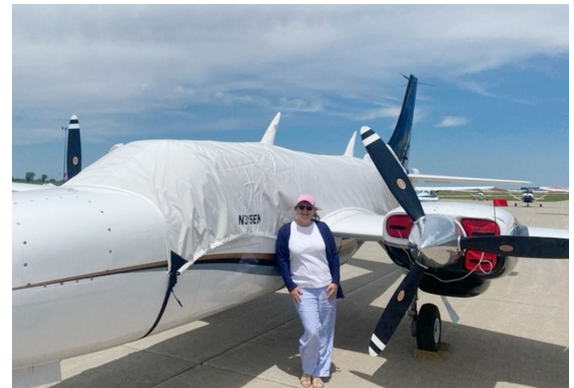
Piper PA-601 Aerostar