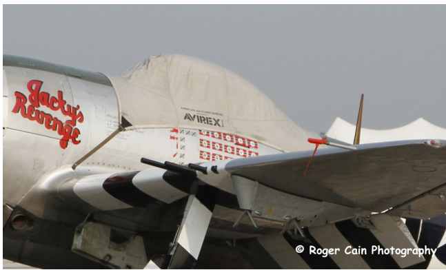
P47D Thunderbolt Canopy Cove