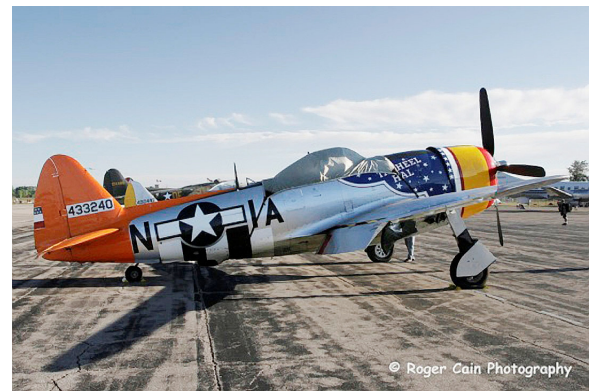
P47D Thunderbolt Canopy Cove