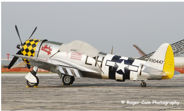
P47D Thunderbolt Canopy Cove