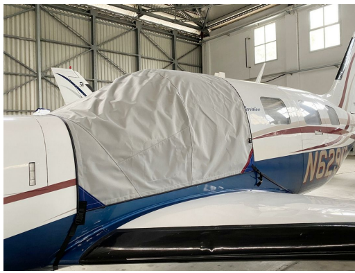
Piper PA-46-500TP Travel Cover Cockpit Cover