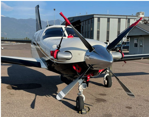
Piper Meridian Prop Tie/Exhaust Cover, Plug Set