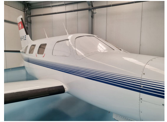
Piper PA-46 Malibu Cockpit Heatshields