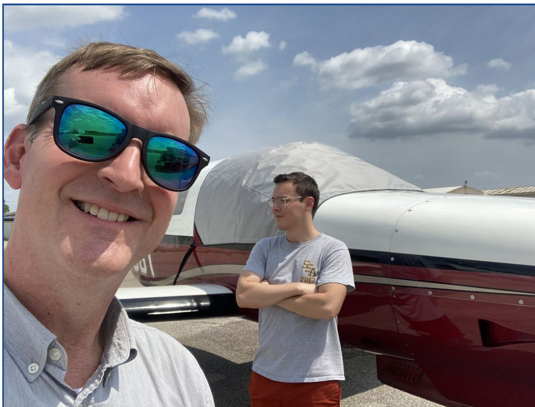
Piper Malibu/Mirage Cockpit Cover