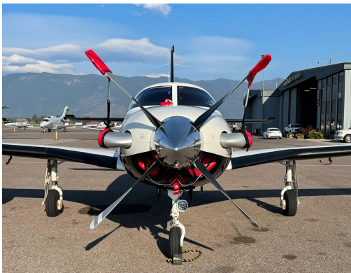
Piper Meridian Prop Tie/Exhaust Cover, Plug Set

This cover type is made from Silver Acrylic Sunbrella canvas and is 100% lined with a soft and smooth microfiber. Bruce's Custom Covers developed this material combination especially for aircraft protection. The outer material is medium weight and treated for water resistance, UV resistance and anti-static buildup. The inner lining is a very soft and smooth microfiber to prevent scratching. The material is very reflective, and tests show that the cabin interior temperature can be reduced to near-ambient temperature on the hottest of days. It is water, ice and snow repellent, yet breathable to allow moisture to escape from between the cover and the aircraft surface.