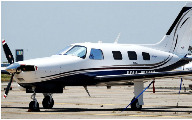
Piper PA-46-350P Mirage, Matrix, JetProp Cockpit Heatshields