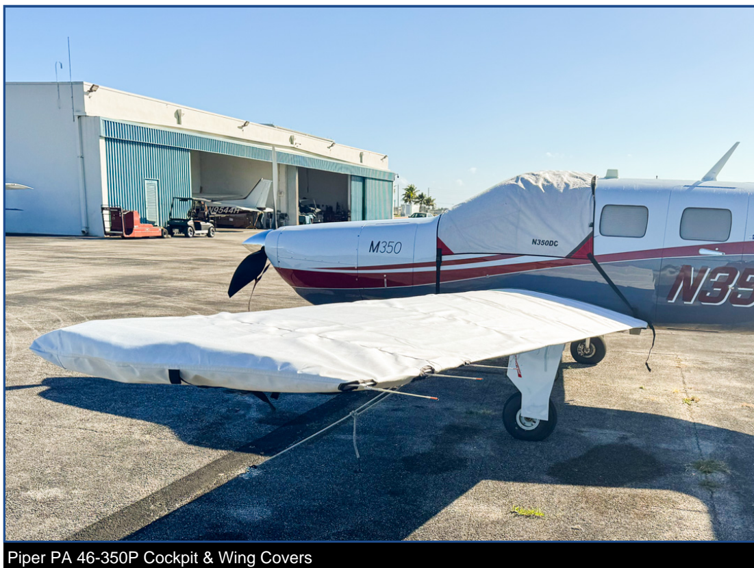
Piper PA 46-350P Cockpit &amp; Wing Covers