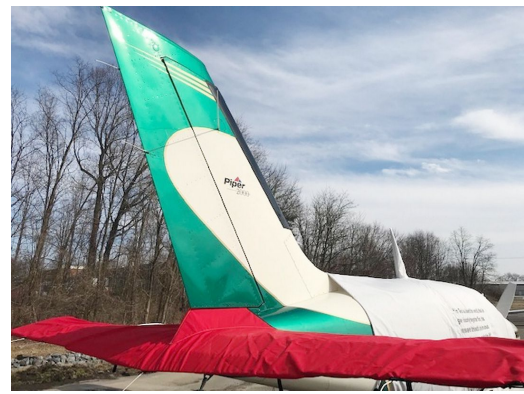
Piper Malibu/Mirage Horizontal Stabilizer/Tailcone Cover