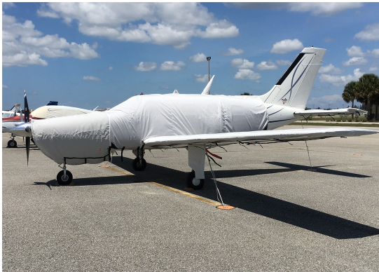
Piper Malibu Extended Canopy Cover, Engine, Wing & Horiz. Stab. Covers

This cover type is made from Silver Acrylic Sunbrella canvas and is 100% lined with a soft and smooth microfiber. Bruce's Custom Covers developed this material combination especially for aircraft protection. The outer material is medium weight and treated for water resistance, UV resistance and anti-static buildup. The inner lining is a very soft and smooth microfiber to prevent scratching. The material is very reflective, and tests show that the cabin interior temperature can be reduced to near-ambient temperature on the hottest of days. It is water, ice and snow repellent, yet breathable to allow moisture to escape from between the cover and the aircraft surface.