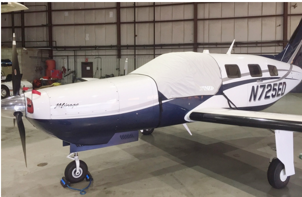
Piper Malibu/Mirage Cockpit Cover, Engine Plugs