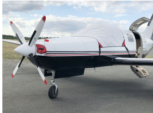
Piper PA-46-50P Malibu Mirage Cockpit Cover