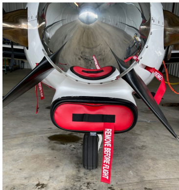
Piper Malibu JetProp Inlet Plugs

This cover type is made from Silver Acrylic Sunbrella canvas and is 100% lined with a soft and smooth microfiber. Bruce's Custom Covers developed this material combination especially for aircraft protection. The outer material is medium weight and treated for water resistance, UV resistance and anti-static buildup. The inner lining is a very soft and smooth microfiber to prevent scratching. The material is very reflective, and tests show that the cabin interior temperature can be reduced to near-ambient temperature on the hottest of days. It is water, ice and snow repellent, yet breathable to allow moisture to escape from between the cover and the aircraft surface.