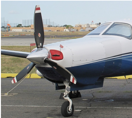
Piper Mirage Engine Plugs

Engine Inlet Plugs are custom fit for your Piper PA-46-350P Mirage, Matrix, JetProp intakes, made with heavy-duty vinyl material, and stuffed with a single block of sculpted urethane foam. Each plug has a zipper that allows the foam to be removed and dried if necessary. Engine plugs have warning flags that are visible from the cockpit or 'remove before flight' streamers sewn onto the face of the plugs. Most plugs are imprinted with the aircraft registration number in black for an extra charge. Storage bag NOT included. Engine plugs may be inserted after flight when the engine is still warm. Engine Inlet Plugs are commonly referred to as Cowl Plugs, Intake Plugs, Cowl Blocks, Engine Blocks, and Engine Bungs.