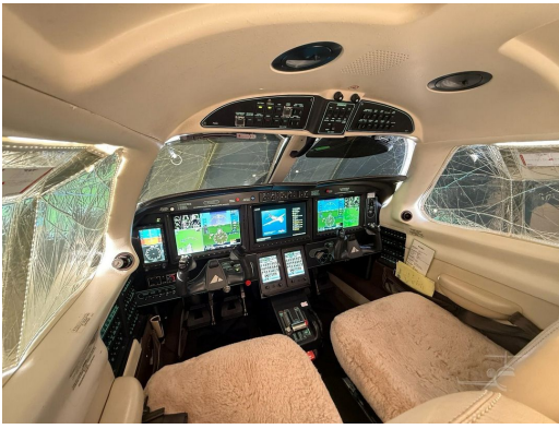
Piper PA46-600TP Cockpit HeatShields