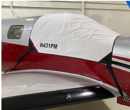
Piper Meridian Cockpit Cover

This cover type is made from Silver Acrylic Sunbrella canvas and is 100% lined with a soft and smooth microfiber. Bruce's Custom Covers developed this material combination especially for aircraft protection. The outer material is medium weight and treated for water resistance, UV resistance and anti-static buildup. The inner lining is a very soft and smooth microfiber to prevent scratching. The material is very reflective, and tests show that the cabin interior temperature can be reduced to near-ambient temperature on the hottest of days. It is water, ice and snow repellent, yet breathable to allow moisture to escape from between the cover and the aircraft surface.