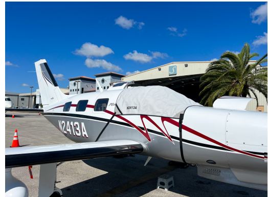
Piper PA-46-350P Cockpit Cover