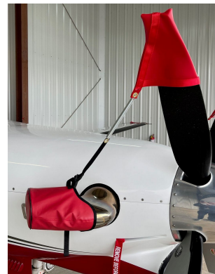
Piper Malibu JetProp Prop Tie & Exhaust Cover