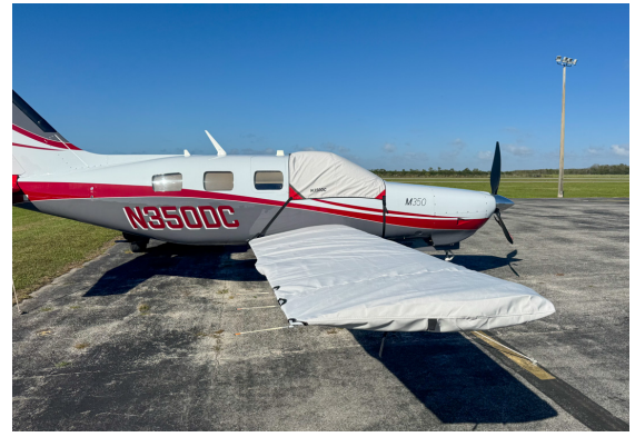
Piper PA 46-350P Cockpit & Wing Covers