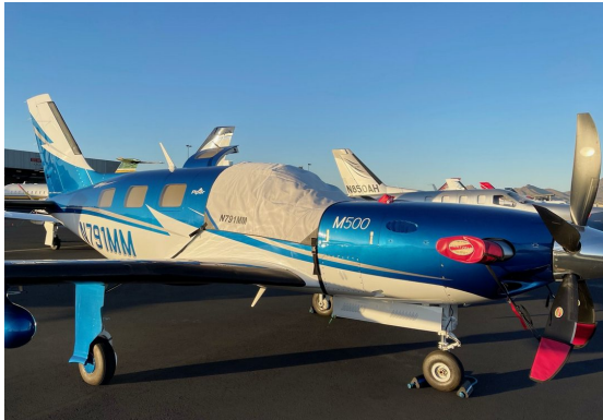
Piper M500 Cockpit Cover

Travel Covers are made with Silver Solution-Dyed Polyester fabric and only lined over the windshield to save weight. The material is lightweight and more compact for easy stowage in the aircraft. The polyester material is water resistant, but only intended for occasional use outside. We also have an ultra lightweight material available for fitted hangar dust covers. For daily outdoor use, the non-travel Sunbrella Cover is the best choice.