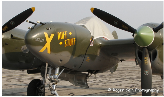
P38 Lightning Canopy Cover (snap-on type)