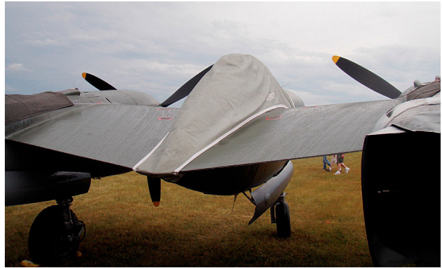
P38 Lightning Canopy Cover (snap-on type)