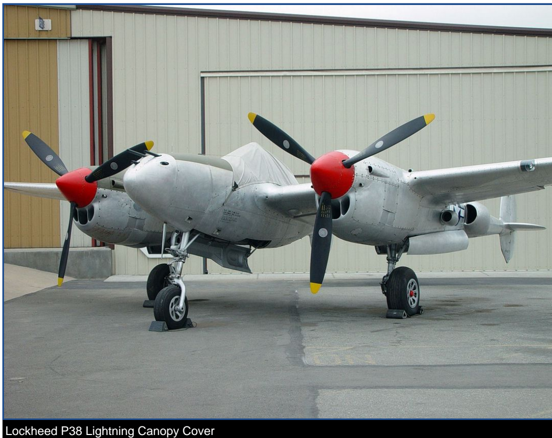
Lockheed P38 Lightning Canopy Cover