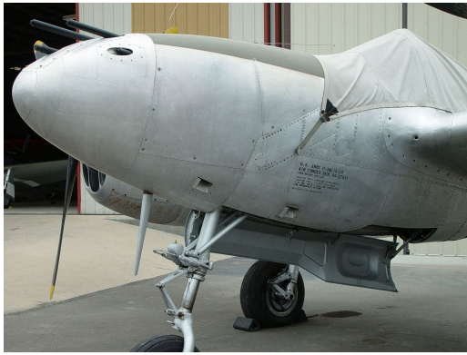
Lockheed P38 Lightning Canopy Cover