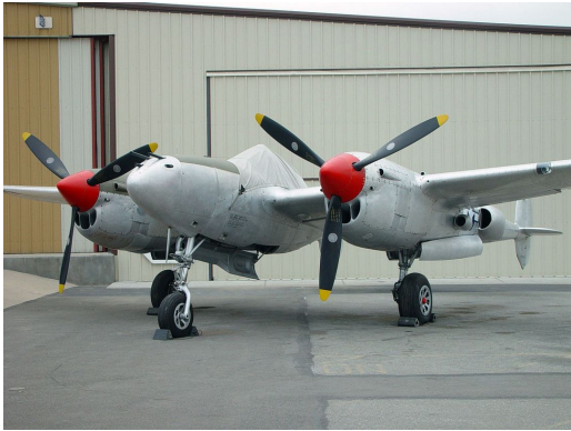
Lockheed P38 Lightning Canopy Cover

The material is very reflective, and tests show that the cabin interior temperature can be reduced to near-ambient temperature on the hottest of days. It is water, ice and snow repellent, yet breathable to allow moisture to escape from between the cover and the aircraft surface.