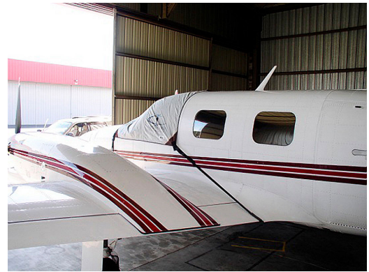
Piper Cheyenne Cockpit Cover