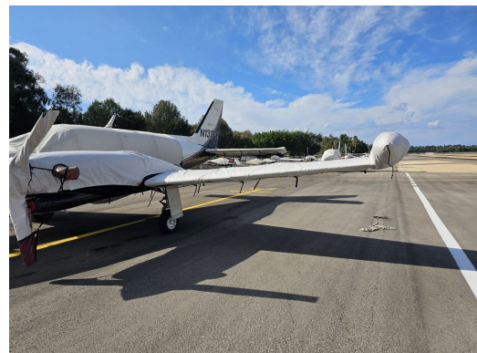
Piper PA-31T Cheyenne Canopy, Wing & Engine Covers