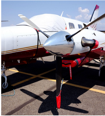
Piper Cheyenne Cockpit Cover, Engine Plugs, Prop Tie/Exhaust Covers

non-travel Sunbrella Cover is the best choice.