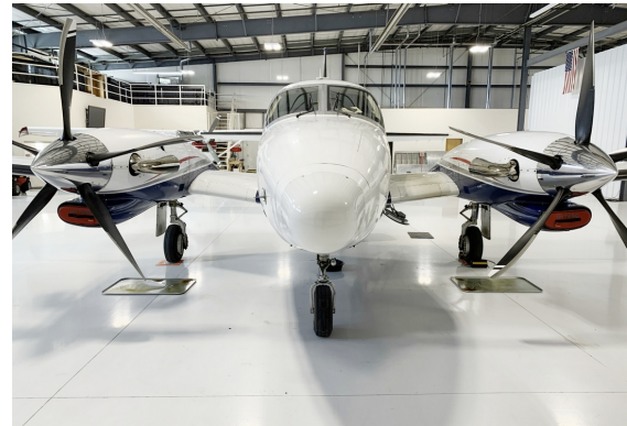
Piper Cheyenne Engine Inlet Plugs