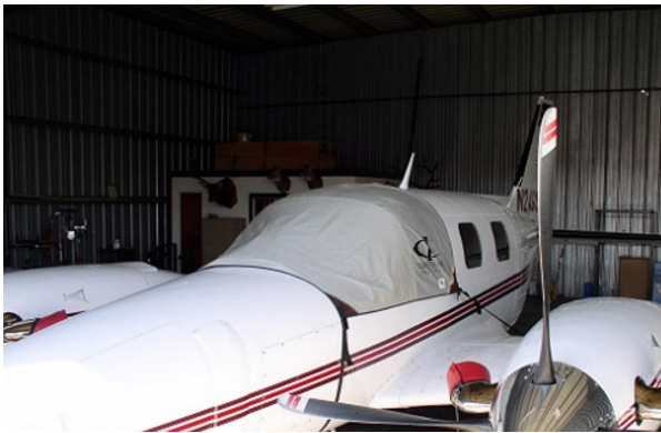
Piper Cheyenne Cockpit Cover

This cover type is made from Silver Acrylic Sunbrella canvas and is 100% lined with a soft and smooth microfiber. Bruce's Custom Covers developed this material combination especially for aircraft protection. The outer material is medium weight and treated for water resistance, UV resistance and anti-static buildup. The inner lining is a very soft and smooth microfiber to prevent scratching. The material is very reflective, and tests show that the cabin interior temperature can be reduced to near-ambient temperature on the hottest of days. It is water, ice and snow repellent, yet breathable to allow moisture to escape from between the cover and the aircraft surface.