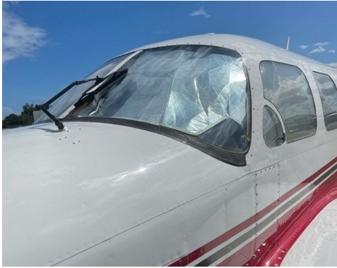
Piper PA-31 Models Cockpit HeatShields

for cockpit overheating, but an external fabric cover is more effective for long-term protection.