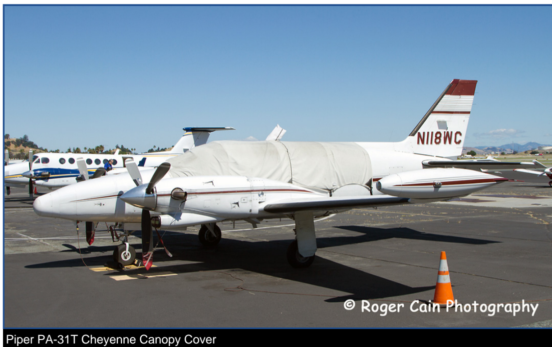
Piper PA-31T Cheyenne Canopy Cover