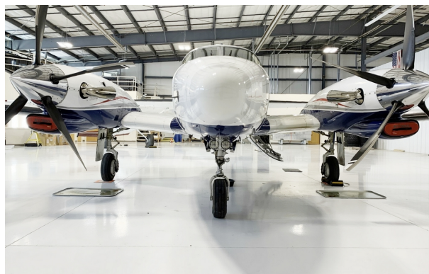
Piper Cheyenne Engine Inlet Plugs