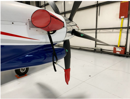
Piper PA-31T Cheyenne II Prop Tie-Downs/Exhaust Covers

This cover type is made from Silver Acrylic Sunbrella canvas and is 100% lined with a soft and smooth microfiber. Bruce's Custom Covers developed this material combination especially for aircraft protection. The outer material is medium weight and treated for water resistance, UV resistance and anti-static buildup. The inner lining is a very soft and smooth microfiber to prevent scratching. The material is very reflective, and tests show that the cabin interior temperature can be reduced to near-ambient temperature on the hottest of days. It is water, ice and snow repellent, yet breathable to allow moisture to escape from between the cover and the aircraft surface.