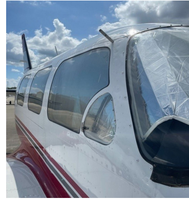
Piper PA-31 Models Cockpit HeatShields