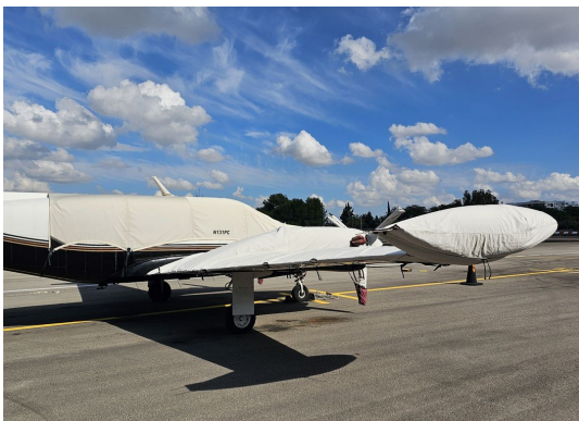
Piper PA-31T Cheyenne Canopy, Wing & Engine Covers

WINTER USE MATERIAL - Made with Solution-Dyed Polyester fabric, this option is intended for seasonal use to aid in deicing, rain mitigation, or for occasional travel. The material is lighter and more compact, but more susceptible to UV damage and may have a shorter useful life if used continuously outside than the all-year use material.