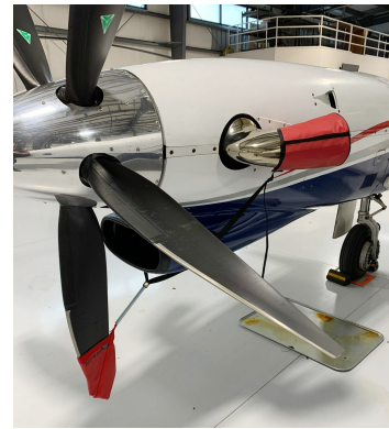
Piper PA-31T Cheyenne II Prop Tie-Downs/Exhaust Covers