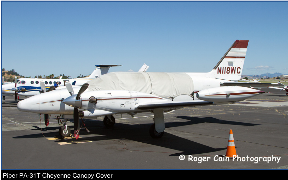
Piper PA-31T Cheyenne Canopy Cover