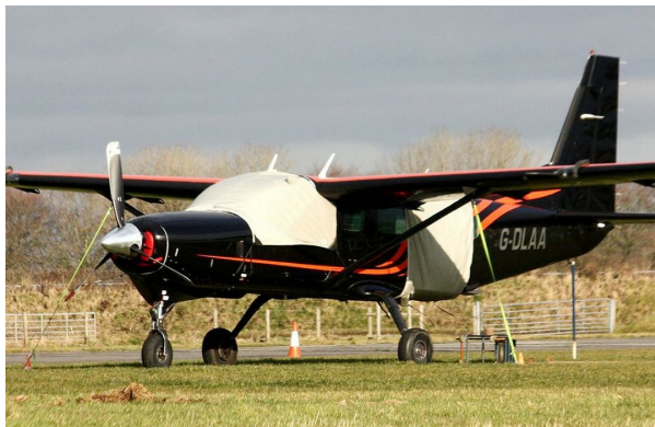
Cessna Caravan Cockpit Cover, Engine Plugs, Jump Door Cover