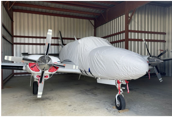
Piper Chieftain Canopy/Engine Cover, Engine Plugs, Pitot Covers