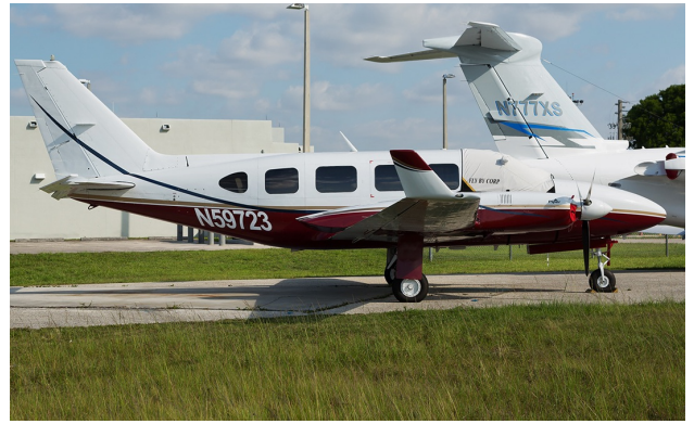
Piper Navajo Cockpit Cover, Engine Plugs