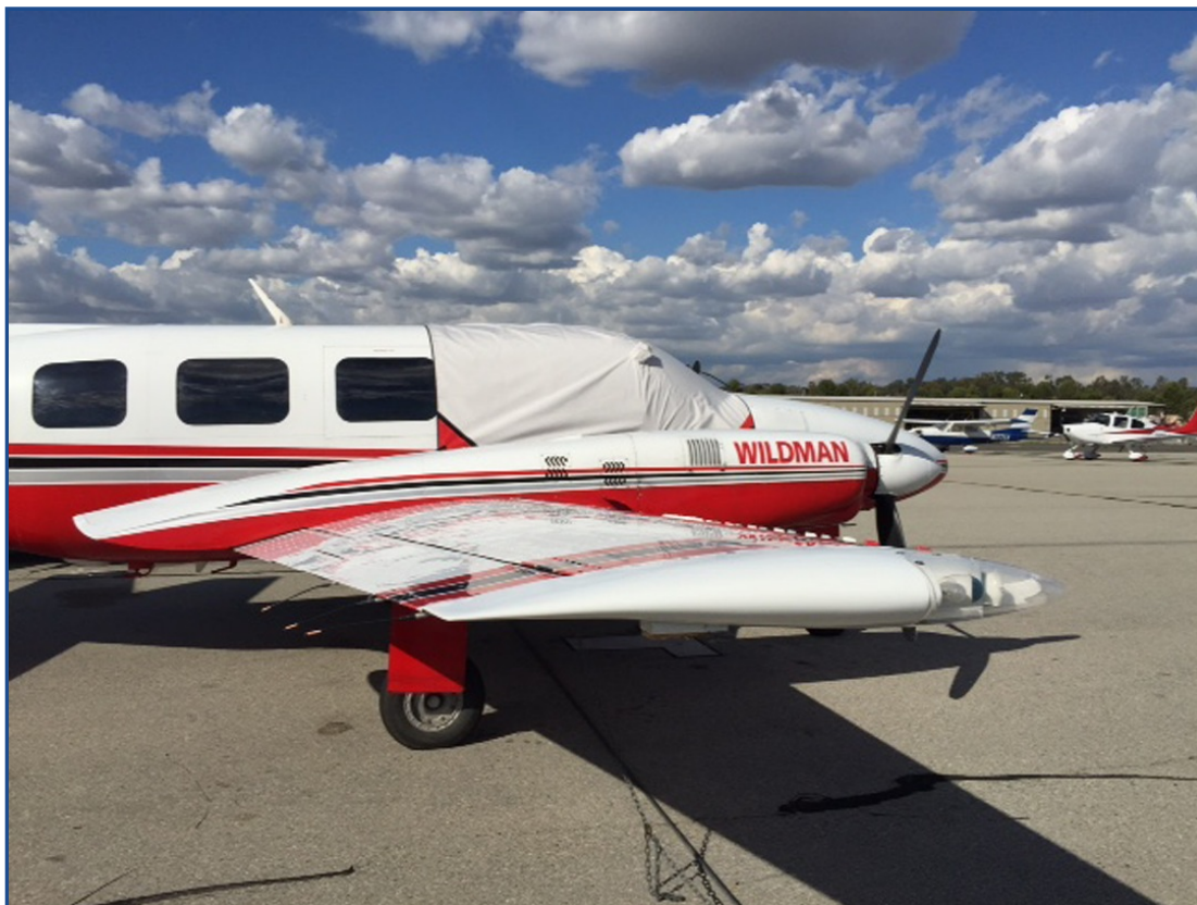
Piper Navajo Cockpit Cover, extended to cover emerg. door.