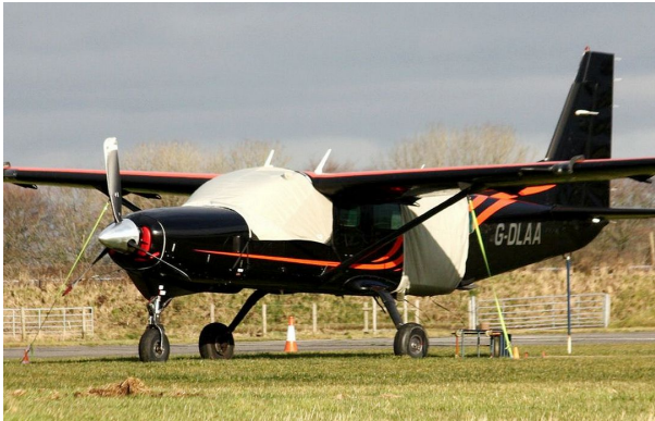
Cessna Caravan Cockpit Cover, Engine Plugs, Jump Door Cover