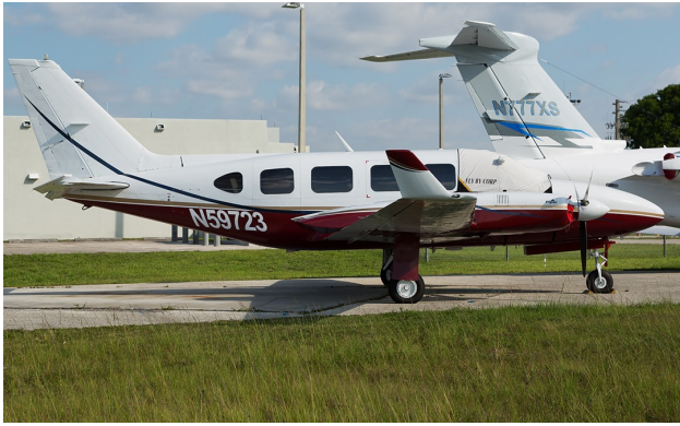
Piper Navajo Cockpit Cover, Engine Plugs

the hottest of days. It is water, ice and snow repellent, yet breathable to allow moisture to escape from between the cover and the aircraft surface.