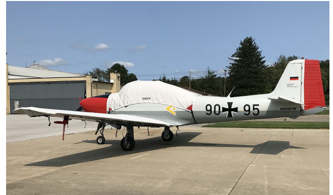
Focke Wulf F149 Canopy Cover, Wing Covers