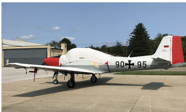
Focke Wulf F149 Canopy Cover, Wing Covers

WINTER USE MATERIAL - Made with Solution-Dyed Polyester fabric, this option is intended for seasonal use to aid in deicing, rain mitigation, or for occasional travel. The material is lighter and more compact, but more susceptible to UV damage and may have a shorter useful life if used continuously outside than the all-year use material.