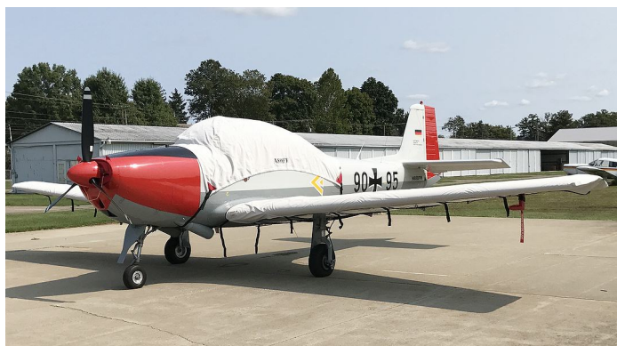
Focke Wulf F149 Canopy Cover, Wing Covers, Engine Plugs