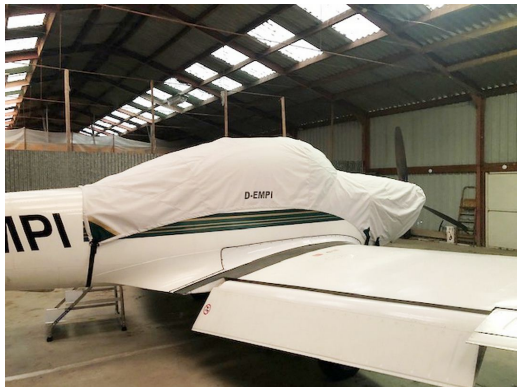
Piaggio FW-149D Canopy/Engine Cover

Cover and Engine Cover. This cover will enclose the engine cowl and will extend aft to cover all of the windows. This cover type is made from Silver Acrylic Sunbrella canvas and is 100% lined with a soft and smooth microfiber. Bruce's Custom Covers developed this material combination especially for aircraft protection. The outer material is medium weight and treated for water resistance, UV resistance and anti-static buildup. The inner lining is a very soft and smooth microfiber to prevent scratching. The material is very reflective, and tests show that the cabin interior temperature can be reduced to near-ambient temperature on the hottest of days. It is water, ice and snow repellent, yet breathable to allow moisture to escape from between the cover and the aircraft surface.