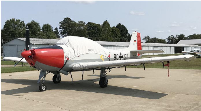
Focke Wulf F149 Canopy Cover, Wing Covers, Engine Plugs

Engine Inlet Plugs are custom fit for your Piaggio P-149 intakes, made with heavy-duty vinyl material, and stuffed with a single block of sculpted urethane foam. Each plug has a zipper that allows the foam to be removed and dried if necessary. Engine plugs have warning flags that are visible from the cockpit or 'remove before flight' streamers sewn onto the face of the plugs. Most plugs are imprinted with the aircraft registration number in black for an extra charge. Storage bag NOT included. Engine plugs may be inserted after flight when the engine is still warm. Engine Inlet Plugs are commonly referred to as Cowl Plugs, Intake Plugs, Cowl Blocks, Engine Blocks, and Engine Bunges.