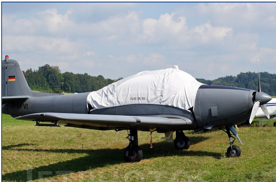
Piaggio P-149 Canopy Cover