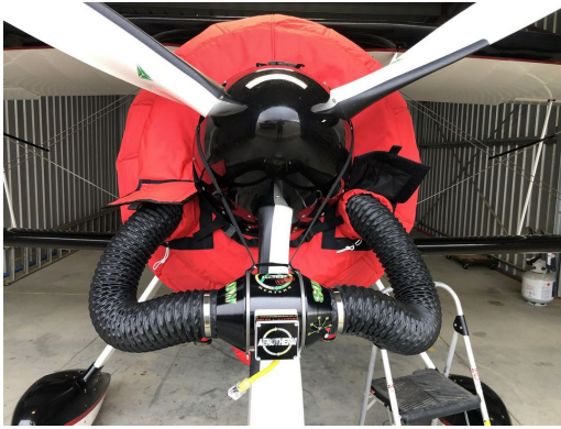
Pitts Model 12 Insulated Engine Cover

the hottest of days. It is water, ice and snow repellent, yet breathable to allow moisture to escape from between the cover and the aircraft surface.