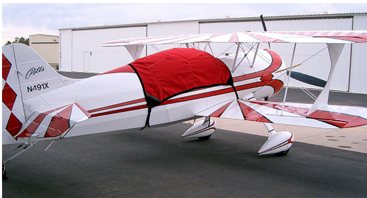
Pitts Model 12 Canopy Cover

Travel Covers are made with Silver Solution-Dyed Polyester fabric and only lined over the windshield to save weight. The material is lightweight and more compact for easy stowage in the aircraft. The polyester material is water resistant, but only intended for occasional use outside. We also have an ultra lightweight material available for fitted hangar dust covers. For daily outdoor use, the non-travel Sunbrella Cover is the best choice.