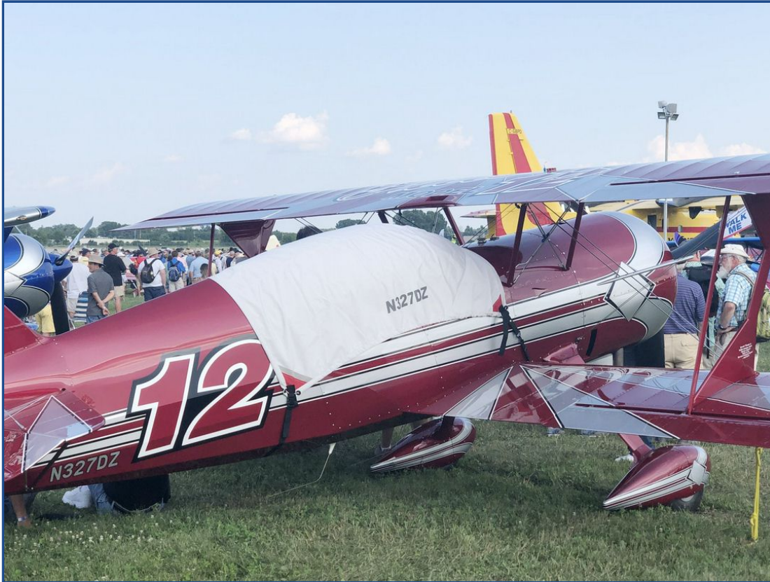
Pitts Model 12 Canopy Cover