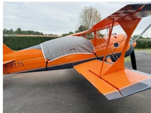
Pitts Model 12 Travel Canopy Cover