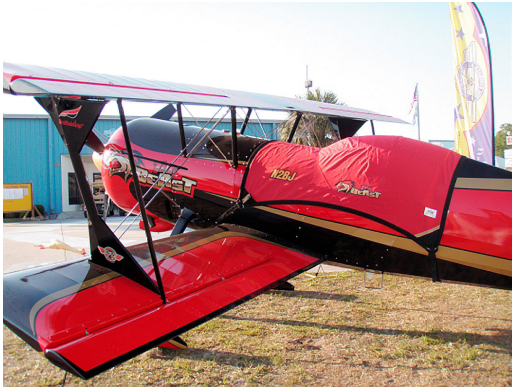
Pitts Model 12 Canopy Cover, single seat

the hottest of days. It is water, ice and snow repellent, yet breathable to allow moisture to escape from between the cover and the aircraft surface.