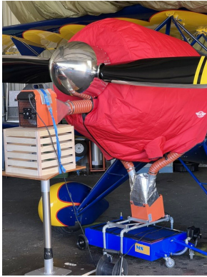
Culp Special Insulated Engine Cover

Covers developed this material combination especially for aircraft protection. The outer material is medium weight and treated for water resistance, UV resistance and anti-static buildup. The inner lining is a very soft and smooth microfiber to prevent scratching. The material is very reflective, and tests show that the cabin interior temperature can be reduced to near-ambient temperature on the hottest of days. It is water, ice and snow repellent, yet breathable to allow moisture to escape from between the cover and the aircraft surface.