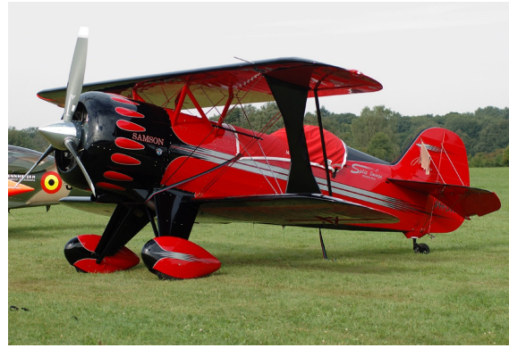
Pitts Samson II Canopy Cover