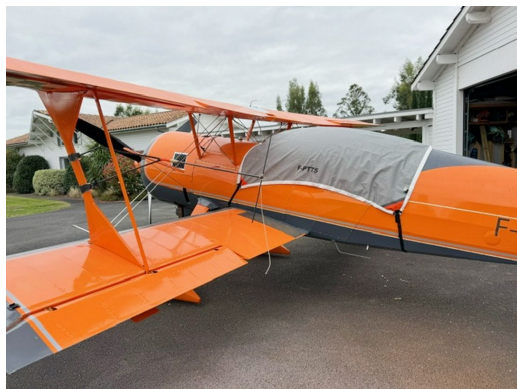
Pitts Model 12 Travel Canopy Cover

Travel Covers are made with Silver Solution-Dyed Polyester fabric and only lined over the windshield to save weight. The material is lightweight and more compact for easy stowage in the aircraft. The polyester material is water resistant, but only intended for occasional use outside. We also have an ultra lightweight material available for fitted hangar dust covers. For daily outdoor use, the non-travel Sunbrella Cover is the best choice.