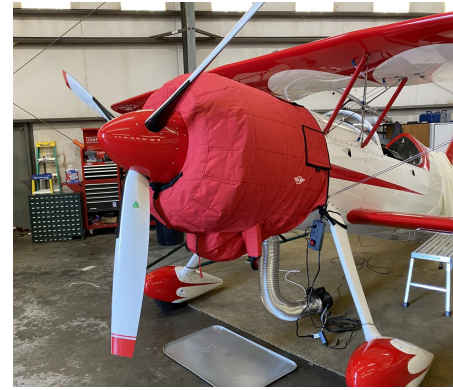
Pitts Model 12 Insulated Engine Cover