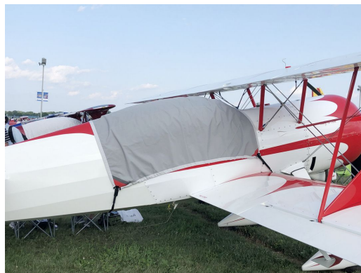
Pitts Model 12 Canopy Cover