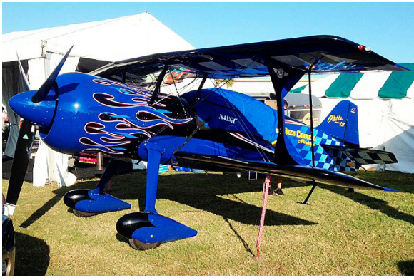
Pitts Model 12 Canopy Cover