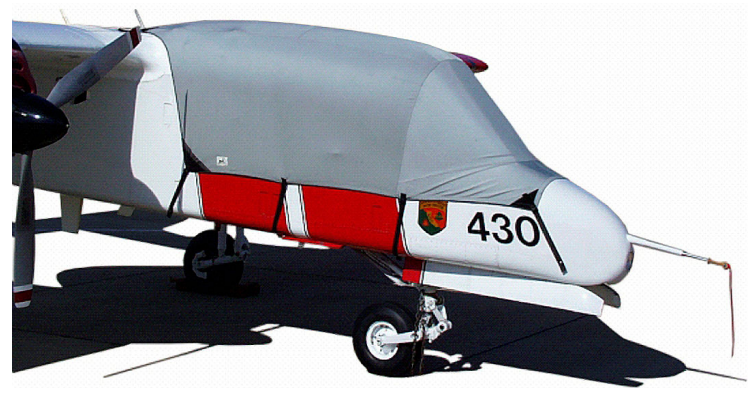
Rockwell OV-10 Canopy Cover