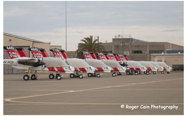
Rockwell OV-10 Bronco Canopy Cover