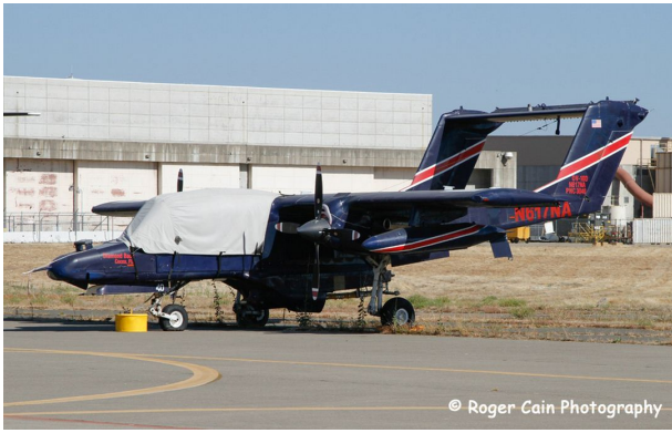
Rockwell OV-10 Bronco Canopy Cover