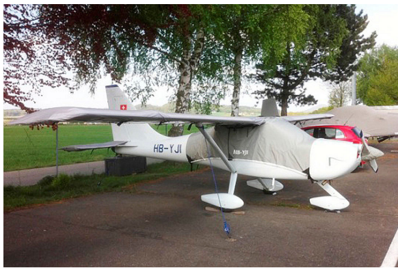
OMF Symphony Canopy, Wings, Horiz. Stab, and Prop Covers