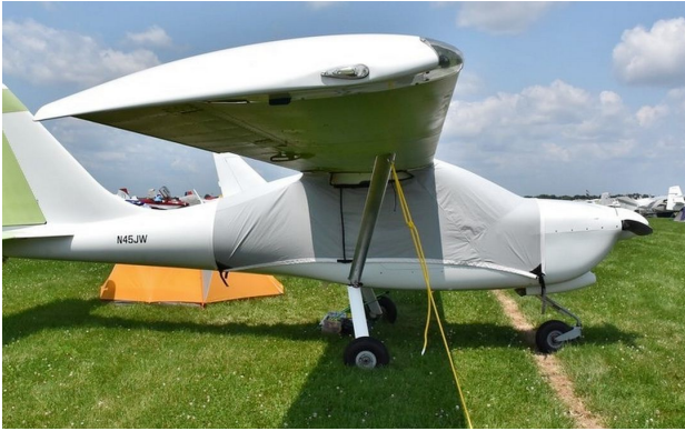
Glstar Travel Cover

This cover type is made from Silver Acrylic Sunbrella canvas and is 100% lined with a soft and smooth microfiber. Bruce's Custom Covers developed this material combination especially for aircraft protection. The outer material is medium weight and treated for water resistance, UV resistance and anti-static buildup. The inner lining is a very soft and smooth microfiber to prevent scratching. The material is very reflective, and tests show that the cabin interior temperature can be reduced to near-ambient temperature on the hottest of days. It is water, ice and snow repellent, yet breathable to allow moisture to escape from between the cover and the aircraft surface.