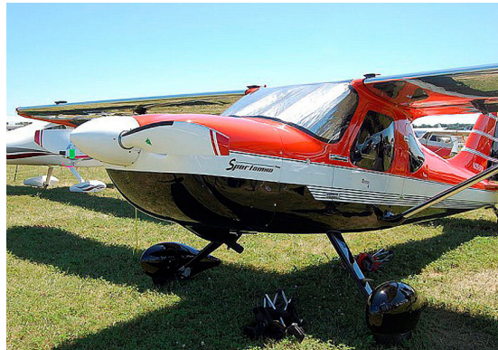
Glstar Sportsman Windshield HeatShield

Windshield Heatshields are interior sunshades for an aircraft's front windshield. The product is a unique composite of closed-cell foam with a silver mylar finish. The semi-rigid design is stiff enough to stand along the inside of the windshield using sun visors or window framing. It folds up flat and easily stores in the included storage sleeve. Some designs may require velcro and suction cups or split right and left sides. A Heatshield is an excellent short-term remedy for cockpit overheating. An external fabric cover is far more effective and practical for long-term protection.