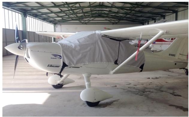
Glasair Aviation Glastar, Sportsman 2+2 Canopy Cover (Over-The-Top Style)