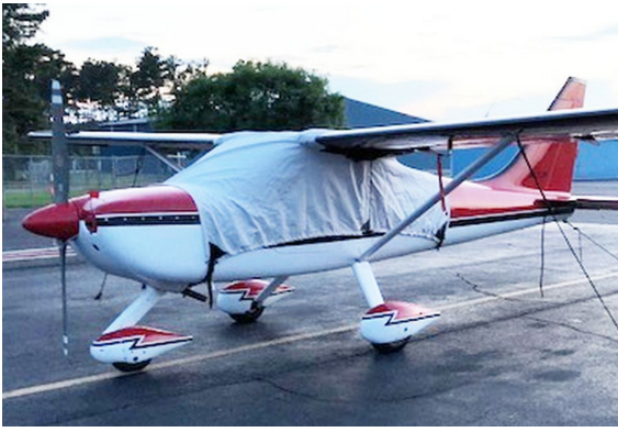
Glasair Aviation Glastar, Sportsman 2+2 Canopy Cover (Over-The-Top Style)