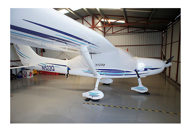
TL Ultralight Sirius Canopy Cover

This cover type is made from Silver Acrylic Sunbrella canvas and is 100% lined with a soft and smooth microfiber. Bruce's Custom Covers developed this material combination especially for aircraft protection. The outer material is medium weight and treated for water resistance, UV resistance and anti-static buildup. The inner lining is a very soft and smooth microfiber to prevent scratching. The material is very reflective, and tests show that the cabin interior temperature can be reduced to near-ambient temperature on the hottest of days. It is water, ice and snow repellent, yet breathable to allow moisture to escape from between the cover and the aircraft surface.