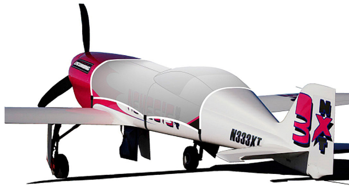
NXT Canopy Cover (illustration)