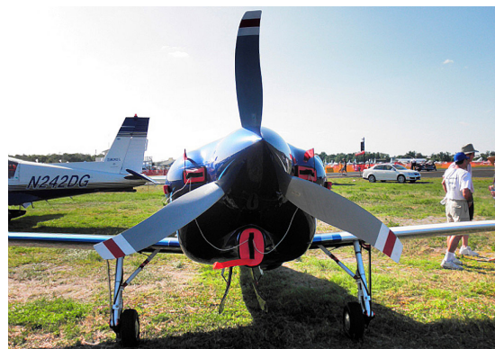
Nemesis NXT Engine Inlet Plug set