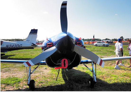
Nemesis NXT Engine Inlet Plug set

Engine Inlet Plugs are custom fit for your Nemesis NXT intakes, made with heavy-duty vinyl material, and stuffed with a single block of sculpted urethane foam. Each plug has a zipper that allows the foam to be removed and dried if necessary. Engine plugs have warning flags that are visible from the cockpit or 'remove before flight' streamers sewn onto the face of the plugs. Most plugs are imprinted with the aircraft registration number in black for an extra charge. Storage bag NOT included. Engine plugs may be inserted after flight when the engine is still warm. Engine Inlet Plugs are commonly referred to as Cowl Plugs, Intake Plugs, Cowl Blocks, Engine Blocks, and Engine Bungs.