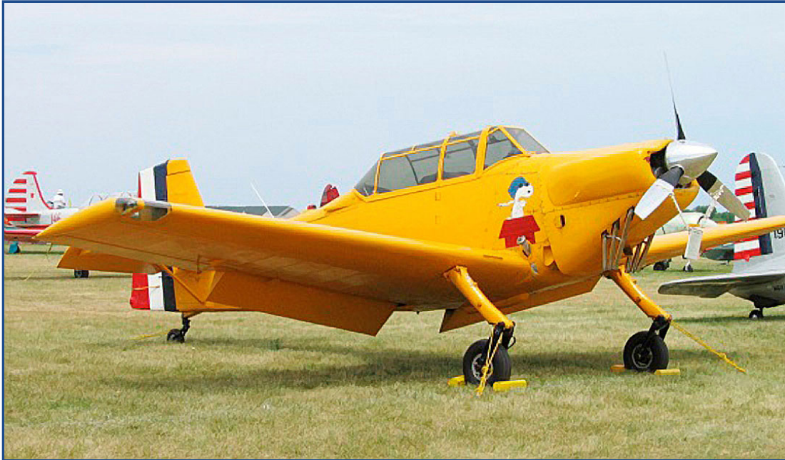
Canopy Cover for the Nord Tandem Trainer 3202