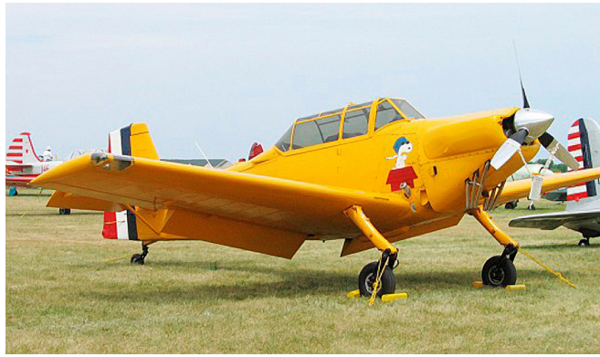
Canopy Cover for the Nord Tandem Trainer 3202