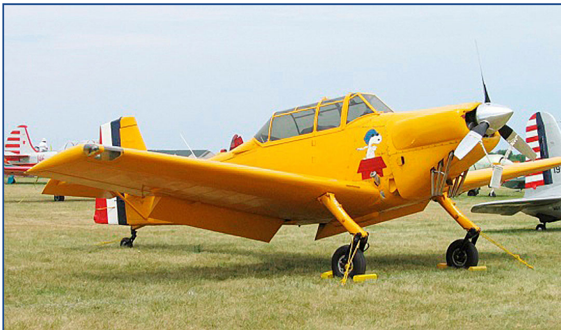
Canopy Cover for the Nord Tandem Trainer 3202