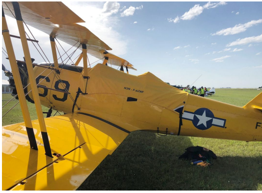
Naval Aircraft Factory N3N Canopy Cover