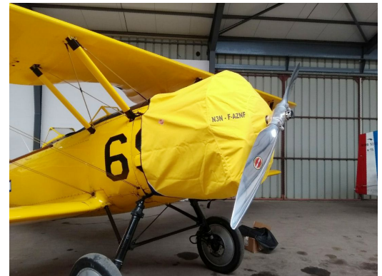
N3N Engine Cover