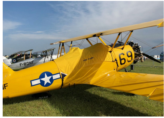
Naval Aircraft Factory N3N Canopy Cover