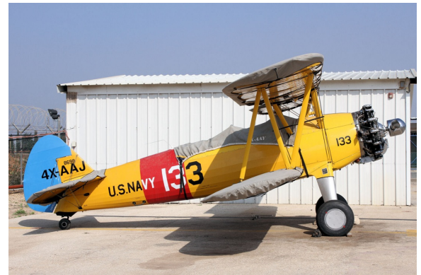
Boeing Stearman PT-13 Canopy, Wing & Horiz. Stab Covers