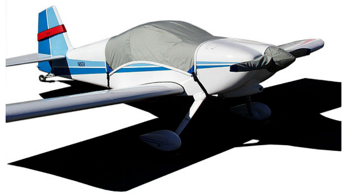
Canopy Cover, Prop Cover