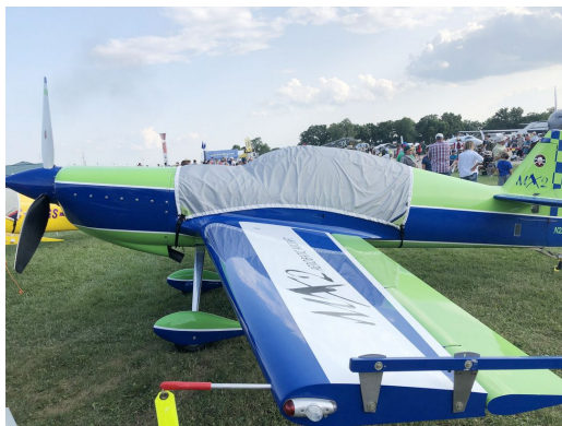
MX2 Lightweight Travel Canopy Cover