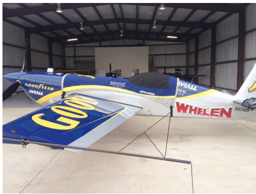
Extra 300SC with NASCAR style custom cover