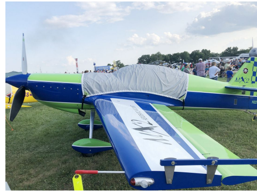
MX2 Lightweight Travel Canopy Cover