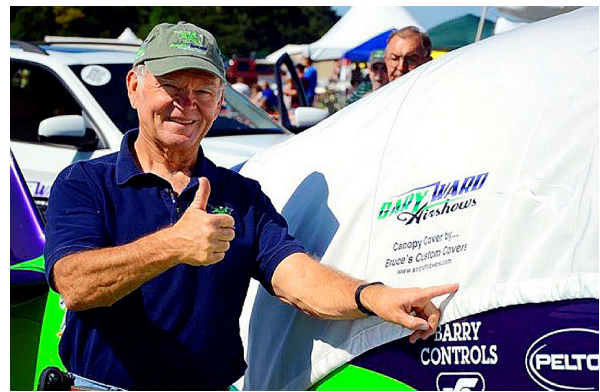
MX-2 Canopy Cover