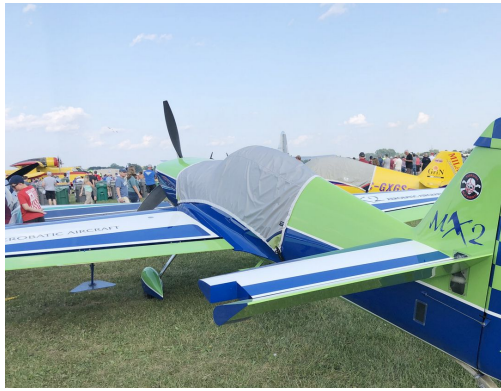
MX2 Lightweight Travel Canopy Cover