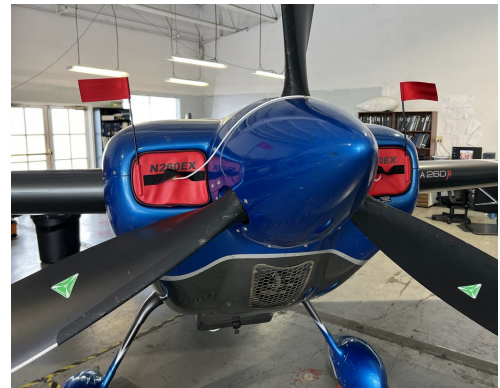
Extra 260 Engine Inlet Plugs