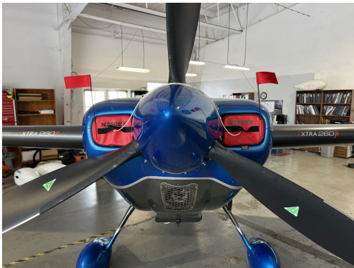
Extra 260 Engine Inlet Plugs

Engine Inlet Plugs are custom fit for your MXR Technologies MXS & MX2 intakes, made with heavy-duty vinyl material, and stuffed with a single block of sculpted urethane foam. Each plug has a zipper that allows the foam to be removed and dried if necessary. Engine plugs have warning flags that are visible from the cockpit or 'remove before flight' streamers sewn onto the face of the plugs. Most plugs are imprinted with the aircraft registration number in black for an extra charge. Storage bag NOT included. Engine plugs may be inserted after flight when the engine is still warm. Engine Inlet Plugs are commonly referred to as Cowl Plugs, Intake Plugs, Cowl Blocks, Engine Blocks, and Engine Bungs.