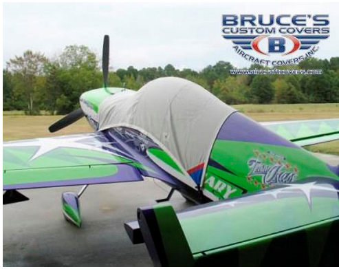
MX-2 Canopy Cover