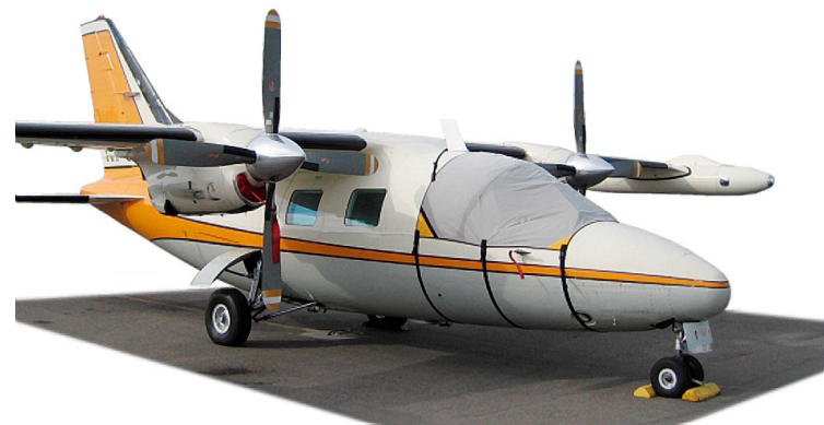
MU-2 Cockpit/Nose, Wing/Engine & Prop Covers