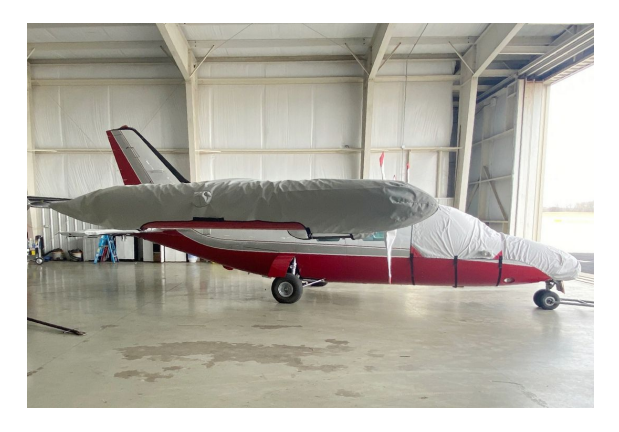
MU-2 Cockpit/Nose, Wing/Engine & Prop Covers