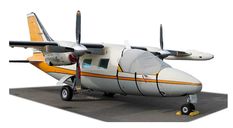
MU-2 Windshield Cover & Engine Plugs