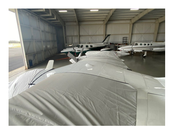
MU-2 Wing/Engine Covers

WINTER USE MATERIAL - Made with Solution-Dyed Polyester fabric, this option is intended for seasonal use to aid in deicing, rain mitigation, or for occasional travel. The material is lighter and more compact, but more susceptible to UV damage and may have a shorter useful life if used continuously outside than the all-year use material.