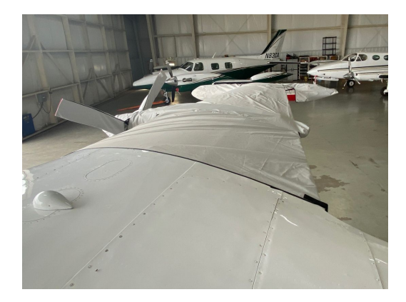
MU-2 Wing/Engine Covers