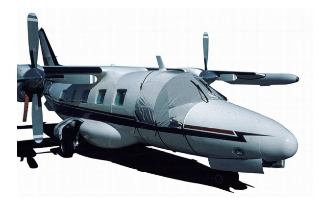
MU-2 Windshield Cover & Engine Plugs

Travel Covers are made with Silver Solution-Dyed Polyester fabric and only lined over the windshield to save weight. The material is lightweight and more compact for easy stowage in the aircraft. The polyester material is water resistant, but only intended for occasional use outside. We also have an ultra lightweight material available for fitted hangar dust covers. For daily outdoor use, the non-travel Sunbrella Cover is the best choice.