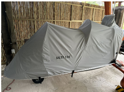
MTO Sport Travel Weight Canopy/Nose Cover

Travel Covers are made with Silver Solution-Dyed Polyester fabric and fully lined over the entire cover. The material is lightweight and more compact for easy stowage in the aircraft. The polyester material is water resistant, but only intended for occasional use outside. We also have an ultra lightweight material available for fitted hangar dust covers. For daily outdoor use, the non-travel Sunbrella Cover is the best choice.