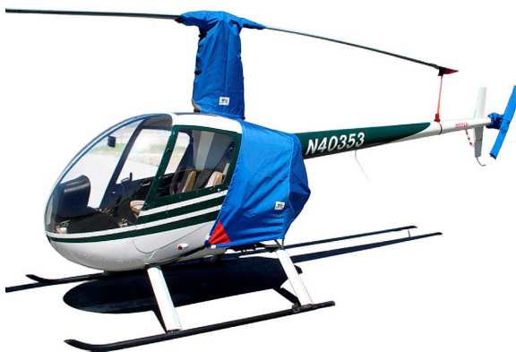
Robinson R-22 Engine, Rotor Mast & Tail Rotor Covers, with Blade Tie-down

Bruce's Autogyro MTO Sport, 2010, 2017 Gyrocopter Blade Covers are made of medium-weight Solution-Dyed Polyester and designed to avoid trim tabs or wicks. You can install Blade Covers from the ground with the aid of a lightweight rope attached to the open end. Covers are cinched tight at the blade root with straps and quick-release plastic buckles. The Cold Weather Blade Covers are fitted with full-length zippers and optional deice "boots" designed to accept a preheater hose; a small opening at the tip of the cover allows for some air circulation and drainage in freezing weather. Some part numbers have features for an extra charge.