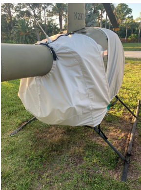
Robinson R-22 Engine Cover

Bruce's Autogyro MTO Sport, 2010, 2017 Gyrocopter Blade Covers are made of medium-weight Solution-Dyed Polyester and designed to avoid trim tabs or wicks. You can install Blade Covers from the ground with the aid of a lightweight rope attached to the open end. Covers are cinched tight at the blade root with straps and quick-release plastic buckles. The Cold Weather Blade Covers are fitted with full-length zippers and optional deice "boots" designed to accept a preheater hose; a small opening at the tip of the cover allows for some air circulation and drainage in freezing weather. Some part numbers have features for an extra charge.