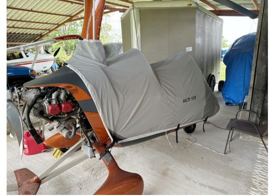
MTO Sport Travel Weight Canopy/Nose Cover