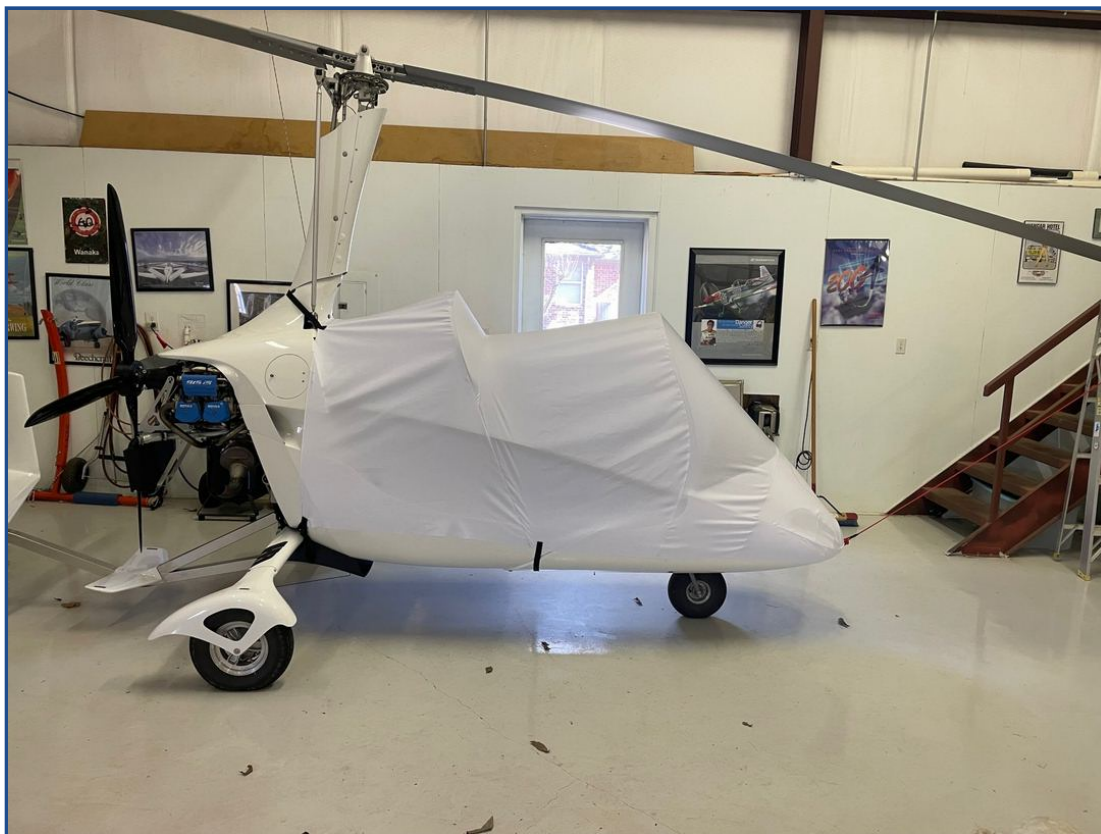
MTO Sport Gyrocopter Canopy/Nose Cover, test fit cover