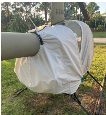
Robinson R-22 Engine Cover

Bruce's Autogyro MTO Sport, 2010, 2017 Gyrocopter Blade Covers are made of medium-weight Solution-Dyed Polyester and designed to avoid trim tabs or wicks. You can install Blade Covers from the ground with the aid of a lightweight rope attached to the open end. Covers are cinched tight at the blade root with straps and quick-release plastic buckles. The Cold Weather Blade Covers are fitted with full-length zippers and optional deice "boots" designed to accept a preheater hose; a small opening at the tip of the cover allows for some air circulation and drainage in freezing weather. Some part numbers have features for an extra charge.