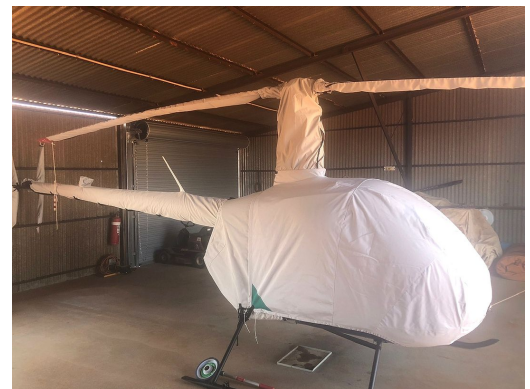
Robinson R-22 Full Cover Set