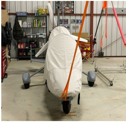
Magni Auto Gyro M16 Cockpit/Nose Cover