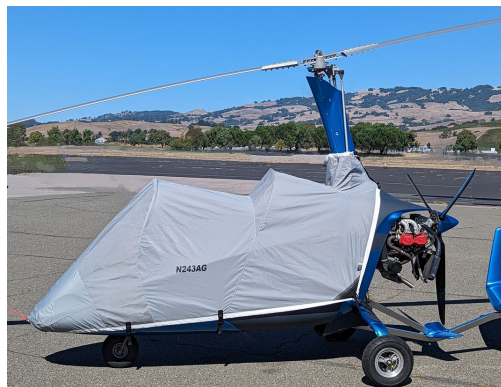
Autogyro MTOSPORT Travel Cover, Light Weight Canopy/Nose Cover