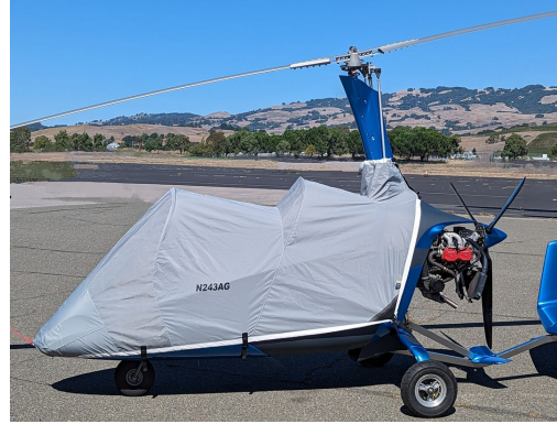
Magni M16 Autogyro Canopy/Nose Cover, test fit cover Autogyro MTOSPORT Travel Cover, Light Weight Canopy/Nose Cover