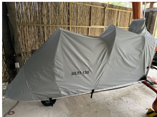
MTO Sport Travel Weight Canopy/Nose Cover

Travel Covers are made with Silver Solution-Dyed Polyester fabric and fully lined over the entire cover. The material is lightweight and more compact for easy stowage in the aircraft. The polyester material is water resistant, but only intended for occasional use outside. We also have an ultra lightweight material available for fitted hangar dust covers. For daily outdoor use, the non-travel Sunbrella Cover is the best choice.