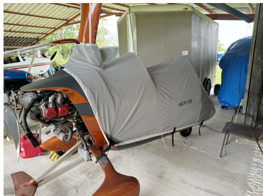
MTO Sport Travel Weight Canopy/Nose Cover

Travel Covers are made with Silver Solution-Dyed Polyester fabric and fully lined over the entire cover. The material is lightweight and more compact for easy stowage in the aircraft. The polyester material is water resistant, but only intended for occasional use outside. We also have an ultra lightweight material available for fitted hangar dust covers. For daily outdoor use, the non-travel Sunbrella Cover is the best choice.