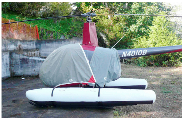
Robinson R-22 Standard Bubble Cover & Engine Cover

Bruce's Autogyro MTO Sport, 2010, 2017 Gyrocopter Blade Covers are made of medium-weight Solution-Dyed Polyester and designed to avoid trim tabs or wicks. You can install Blade Covers from the ground with the aid of a lightweight rope attached to the open end. Covers are cinched tight at the blade root with straps and quick-release plastic buckles. The Cold Weather Blade Covers are fitted with full-length zippers and optional deice "boots" designed to accept a preheater hose; a small opening at the tip of the cover allows for some air circulation and drainage in freezing weather. Some part numbers have features for an extra charge.