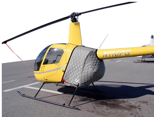
Robinson R-22 Insulated Engine Cover (also covers bottom) & Front Blade Tie-down