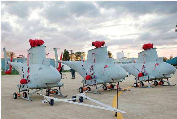
Northrop Grumman MQ-8 Firescout Plugs and Covers

WINTER USE MATERIAL - Made with Solution-Dyed Polyester fabric, this option is intended for seasonal use to aid in deicing, rain mitigation, or for occasional travel. The material is lighter and more compact, but more susceptible to UV damage and may have a shorter useful life if used continuously outside than the all-year use material.