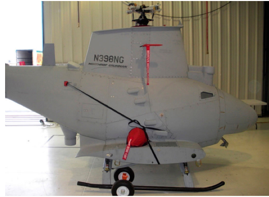
Covers & Plugs for the Northrop Grumman MQ-8 Fire Scout