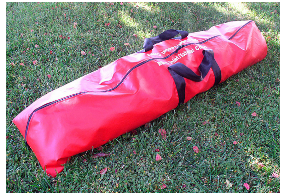
Intake/Exhaust Cover Set Storage Bag