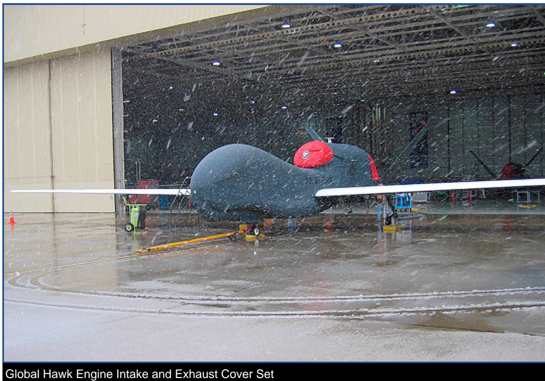
Global Hawk Engine Intake and Exhaust Cover Set