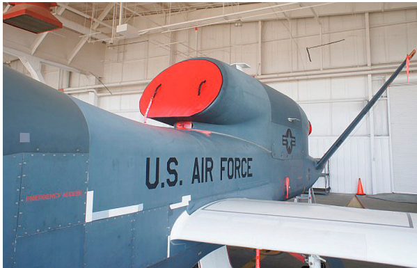
RQ-4/MQ-4 Global Hawk Intake Plug w/ lip (Fits both A & B models & all blocks)

The Engine Inlet Plugs are custom fit for your Northrop Grumman Triton MQ-4C intakes, made with heavy-duty vinyl material, and stuffed with a single block of sculpted urethane foam. Each plug has a zipper that allows the foam to be removed and dried if necessary. Engine plugs have 'remove before flight' streamers sewn onto the face of the plugs. Most plugs are imprinted with the aircraft registration number in black for an extra charge. Storage bag NOT included. Engine plugs may be inserted after flight when the engine is still warm. Engine Inlet Plugs are commonly referred to as Cowl Plugs, Intake Plugs, Cowl Blocks, Engine Blocks, and Engine Bungs.