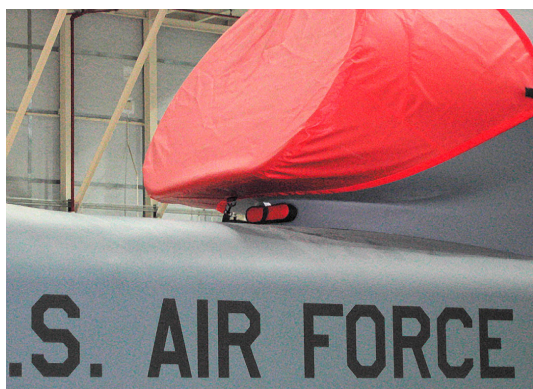
Intake Cover with small inlet plug

The Northrop Grumman Triton MQ-4C Intake Covers are designed to install easily yet be completely storable. A spring steel hoop is sewn into the hem of each cover, allowing them to be installed without climbing onto the wing or using a stepladder. To store the covers the spring steel hoop folds like a band-saw blade into three nesting rings. Each cover folds into a compact circular bundle which is stored in the included duffle bag, yet they unfold quickly for use. The Tri-Fold Ring cover is made of medium weight nylon which is available in a variety of colors to match the paint trim. Each cover set comes complete with installation and folding instructions. The aircraft's registration number can be silkscreened onto the cover for an extra charge.