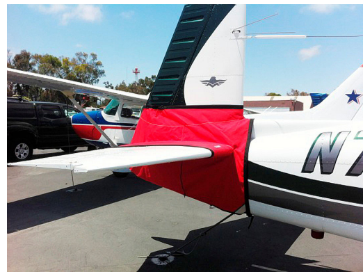
Mooney Tailcone Cover, completely enclosed