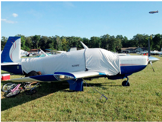
Mooney 231 Extended Canopy Cover

This cover type is made from Silver Acrylic Sunbrella canvas and is 100% lined with a soft and smooth microfiber. Bruce's Custom Covers developed this material combination especially for aircraft protection. The outer material is medium weight and treated for water resistance, UV resistance and anti-static buildup. The inner lining is a very soft and smooth microfiber to prevent scratching. The material is very reflective, and tests show that the cabin interior temperature can be reduced to near-ambient temperature on the hottest of days. It is water, ice and snow repellent, yet breathable to allow moisture to escape from between the cover and the aircraft surface.