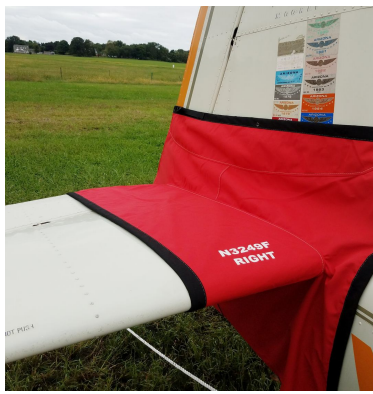
Mooney M20E Tailcone Cover