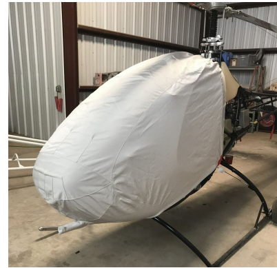
Helicycle Bubble Cover