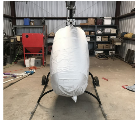
Helicycle Bubble Cover