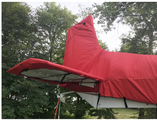
Cessna 185 Empennage Cover