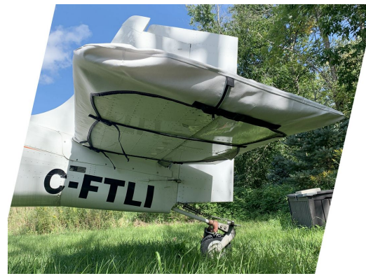
Murphy Elite Horizontal Stabilizer Covers