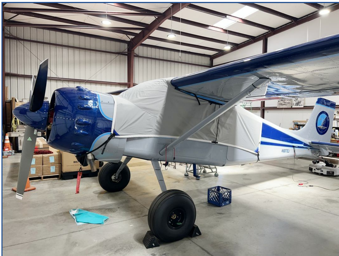
Murphy Moose Travel Weight Canopy Cover