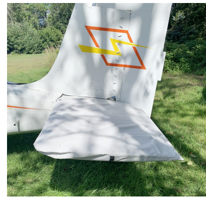
Murphy Elite Horizontal Stabilizer Covers