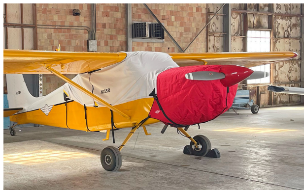
Murphy Super Rebel Insulated Engine Cover

This cover type is made from Silver Acrylic Sunbrella canvas and is 100% lined with a soft and smooth microfiber. Bruce's Custom Covers developed this material combination especially for aircraft protection. The outer material is medium weight and treated for water resistance, UV resistance and anti-static buildup. The inner lining is a very soft and smooth microfiber to prevent scratching. The material is very reflective, and tests show that the cabin interior temperature can be reduced to near-ambient temperature on the hottest of days. It is water, ice and snow repellent, yet breathable to allow moisture to escape from between the cover and the aircraft surface.