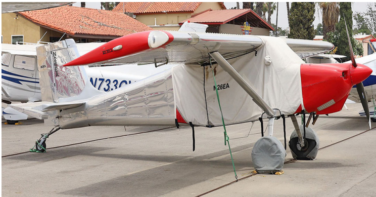
Murphy Elite Extended Canopy Cover