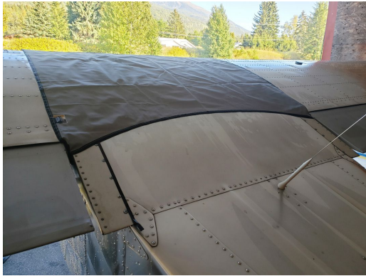
Murphy Rebel, Moose, Renegade, Spirit, Elite, etc. Windshield/Skylight Cover

This cover type is made from Silver Acrylic Sunbrella canvas and is 100% lined with a soft and smooth microfiber. Bruce's Custom Covers developed this material combination especially for aircraft protection. The outer material is medium weight and treated for water resistance, UV resistance and anti-static buildup. The inner lining is a very soft and smooth microfiber to prevent scratching. The material is very reflective, and tests show that the cabin interior temperature can be reduced to near-ambient temperature on the hottest of days. It is water, ice and snow repellent, yet breathable to allow moisture to escape from between the cover and the aircraft surface.