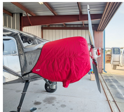
Murphy Moose Insulated Engine Cover