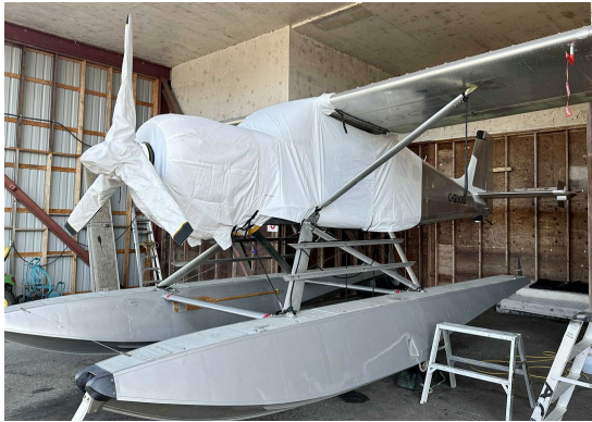
Murphy Moose Extended Canopy Cover, Engine & Prop Covers, test fit covers.

This cover type is made from Silver Acrylic Sunbrella canvas and is 100% lined with a soft and smooth microfiber. Bruce's Custom Covers developed this material combination especially for aircraft protection. The outer material is medium weight and treated for water resistance, UV resistance and anti-static buildup. The inner lining is a very soft and smooth microfiber to prevent scratching. The material is very reflective, and tests show that the cabin interior temperature can be reduced to near-ambient temperature on the hottest of days. It is water, ice and snow repellent, yet breathable to allow moisture to escape from between the cover and the aircraft surface.